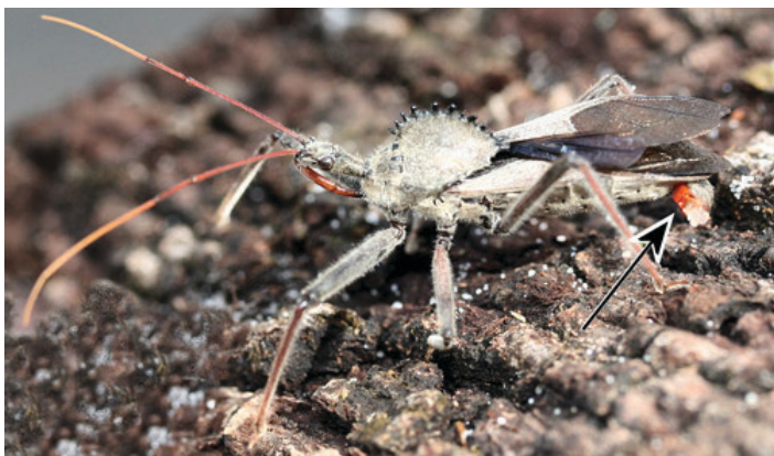
Figure 7. Adult female wheel bug, Arilus cristatus (Linnaeus), showing orange-red subrectal glands (arrow).

of 2-methylpropanoic, butanoic, 2-methylbutanoic, and 3-methylbutanoic acids (Aldrich et al. 2013).