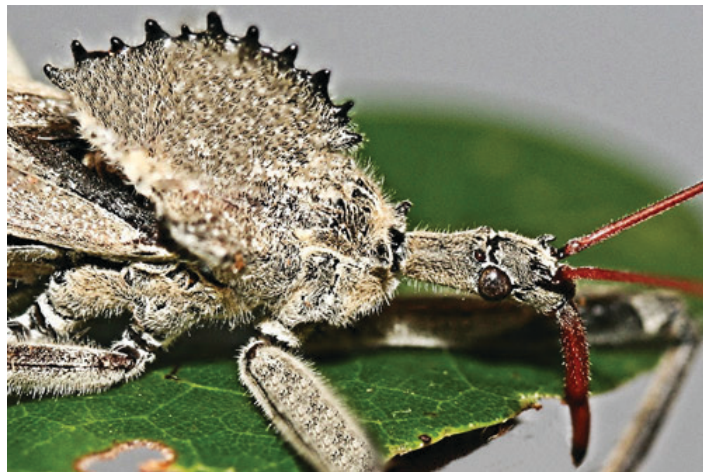
Figure 4. Close-up of head, pronotum and "wheel" of the wheel bug, Arilus cristatus (Linnaeus).

The wheel bug adult usually measures from 1 to 1.25 inches long. This assassin bug is a dark, robust creature with long legs and antennae, a stout beak, large eyes on a slim head, and a prominent thoracic, semicircular crest that resembles a cogwheel or chicken's comb. This is the only insect species in the United States with such a crest. The number of teeth (tubercles) in the crest varies from eight to 12. Females are larger than males, with the abdominal margins being more widely exposed in the females. A very fine yellowish pubescence is present over most of the body, except the hemelytral membrane, which is iridescent bronze. The overall color is dark brown. Variable amounts of tiny white patches or granules are scattered throughout the pubescence.