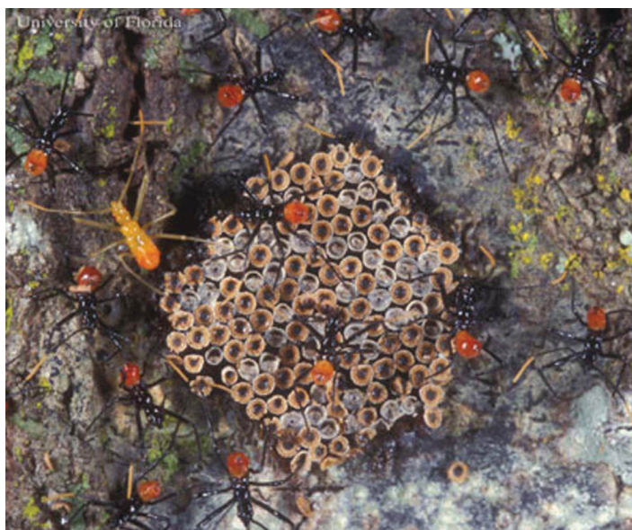
Figure 6. Eggs and early instar nymphs of the wheel bug, Arilus cristatus (Linnaeus).