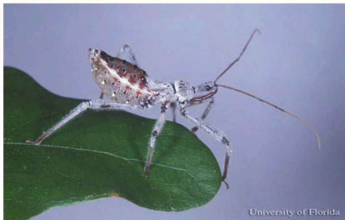
Figure 5. A nymph of the wheel bug, Arilus cristatus (Linnaeus).

Nymphs have been described in detail by Readio (1927). Smaller nymphs are bright red with black marks. The last instar nymphs are darker. Nymphs lack the "wheel" or crest. For a diagnostic key to identify nymphs of the family Reduviidae to genus (including), see Fracker and Usinger (1949).