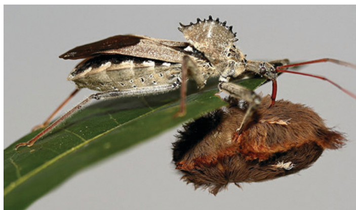
Figure 9. Adult wheel bug, Arilus cristatus (Linnaeus), feeding on a puss caterpillar, Megalopyge opercularis (Smith).