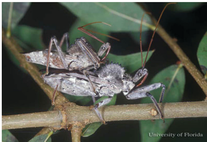
Figure 2. Adult wheel bugs, Arilus cristatus (Linnaeus).

Eggs resemble miniature brown bottles with white stoppers. They are 3.7 mm long and are laid on end, side by side, in a compact hexagonal cluster of 42 to 182 eggs. The cluster is glued together and covered by gummy cement that may protect the eggs from foul weather, parasites, and predators. Egg clusters are typically found at a height of 4 feet or below on tree trunks and limbs, shrubs, and miscellaneous objects.