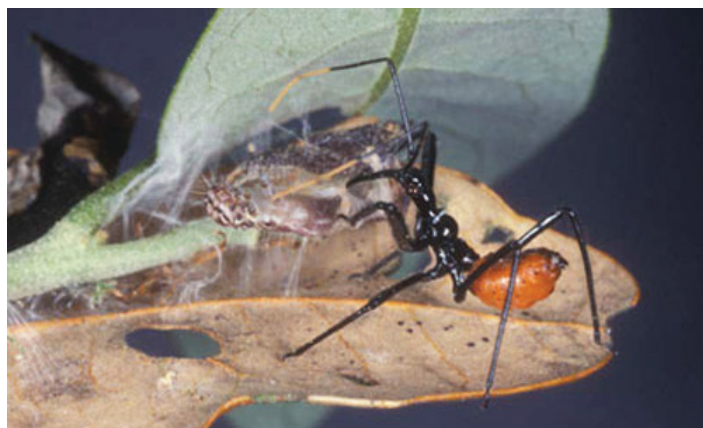
Figure 8. A nymph of the wheel bug, Arilus cristatus (Linnaeus), feeding on a caterpillar.

from bees, wasps, or hornets. Barber (1919) and Hall (1924) described in detail the effects of such bites. In general, initial pain often is followed by numbness for several days. The afflicted area often becomes reddened and hot to the touch, but later may become white and hardened at the puncture area. Occasionally, a hard core may slough off, leaving a small hole at the puncture site. Healing time varies but usually takes two weeks. Smith et al. (1958) reviewed the literature concerning wheel bug bites and concluded that serious or prolonged effects from these bites usually are due to secondary infection or an individual hypersensitivity.