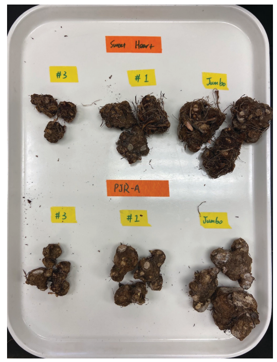
Figure 6. Caladium tubers (two cultivars Sweet Heart and Postman Joyner, each with three different tuber sizes "#3", "#1", and "Jumbo") infested with root-knot nematodes, UF/GCREC, July 2020.