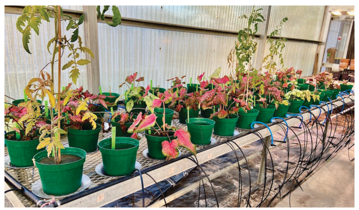
Figure 8. Hot water treatment on caladium tubers. Top: greenhouse trials were conducted at the UF/GCREC in 2020 to study the effects of different water bath exposure periods on killing root-knot nematodes in tubers of caladium cultivars; bottom left: water bath equipment; bottom right: caladium tubers with different sizes under hot water treatment.

2004; Braz et al. 2016); however, sorghum-sudangrass is a good host to sting and stubby root nematodes (Crow et al. 2001). For more information on nematode management with cover crops, please refer to other EDIS publications ENY059 ("Soil Organic Matter, Green Manures, and Cover Crops for Nematode Management"), ENY063 ("Cover Crops for Managing Root-Knot Nematodes"), ENY716 ("Nematode Management Using Sorghum and Its Relatives"), and ENY717 ("Management of Nematodes and Soil Fertility with Sunn Hemp Cover Crop").