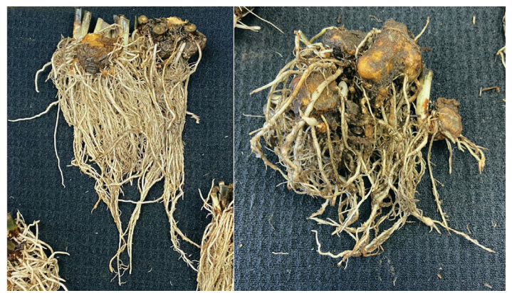
Figure 5. Galled root symptoms on caladium caused by root-knot nematode, UF/GCREC, July 2020. Left: healthy caladium roots; right: galled root symptom.