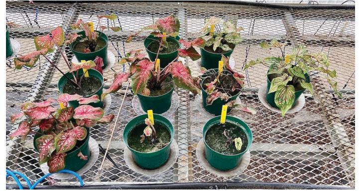
Figure 1. Different caladium varieties with variable leaf colors and patterns grown at UF/GCREC in 2020.

Caladiums (Caladium × hortulanum) are widely planted as ornamental crops throughout the world for their large leaves with variable shapes and colorful patterns (Figure 1). They are native to the tropical regions of South and Central America. Florida has been leading the commercial production of caladium tubers in the past seven decades and provides more than 95% of the world's tuber supply (Deng 2018). Many nematodes may damage caladium roots, severely reduce the vigor and quality of plants, and lead to symptoms like leaf die back, plant stunting and tuber yield loss. In Florida, root-knot, sting, and stubby root nematodes are the most common nematodes found in caladium fields. Root-knot nematodes ( Meloidogyne spp.) are considered the most important of all pests in caladiums that are grown in sand. This paper will help caladium growers understand what plant-parasitic nematodes are and current nematode management strategies for the caladium industry.