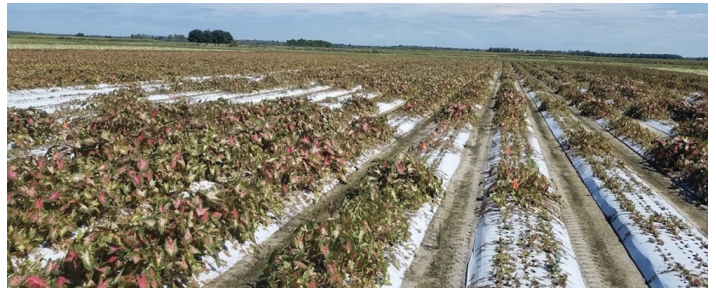
Figure 3. Irregularly distributed aboveground damage symptoms in caladium field infested with Meloidogyne arenaria, FL, October 2019.

Caladiums are vegetatively propagated ornamentals grown from tubers, so root-knot nematodes can be transmitted in tubers from generation to generation. The growing season of caladiums lasts approximately nine months, which means severe damage can be caused as the nematodes have much time to build up to a very high level. Above ground symptoms of root-knot nematodes are irregularly distributed in the field (Figure 3), and include leaf dieback, plant stunting, wilting, and yellowing (Figure 4). Most diagnostic symptoms are found below ground and include galled roots and tubers (Figure 5), root and tuber rot (Figure 6), and corky lesions on tubers (Kokalis-Burelle et al. 2017).