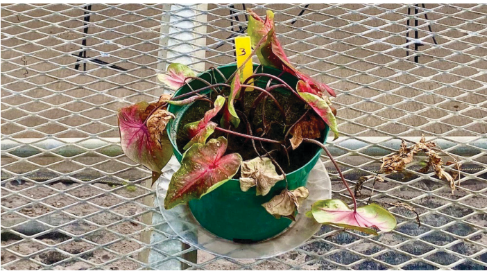
Figure 4. Wilting and yellowing symptoms caused by root-knot nematode Meloidogyne javanica on caladium variety Red Flash at UF/ GCREC in 2020.