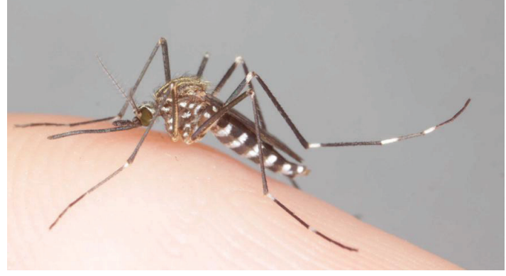
Figure 8. Adult female Aedes japonicus.

This invasive temperate species, originating from Japan and Korea (Fonseca et al. 2010), was first detected in 1999 in the continental United States in Connecticut (Andreadis et al. 2001). Multiple independent introductions of this species are responsible for populations on the eastern Atlantic seaboard and in the Pacific Northwest and Hawaii (Fonseca et al. 2010). Aedes japonicus (Figure 8) is currently only found in Florida's Panhandle counties (Riles et al. 2017; Smith et al. 2020). Artificial containers, such as rainwater barrels and discarded tires, are commonly occupied by this species where rock holes containing water are not available.