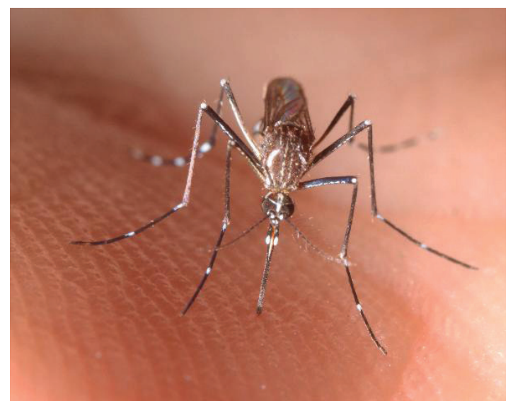
Figure 4. Adult female Aedes aegypti.

This cosmopolitan species, native to Africa, has spread throughout most of the Western Hemisphere since its first introductions to the United States and the New World tropics during the slave trade (Lounibos 2002). Currently found in all of Florida except the Panhandle (Parker et al. 2019), this species is highly adapted to urban and suburban environments, where it develops in containers that hold stored water or rainwater (Braks et al. 2003). Aedes aegypti (Figure 4) is currently regarded as the most important vector species of dengue, chikungunya, and Zika viruses, both in Florida and worldwide.