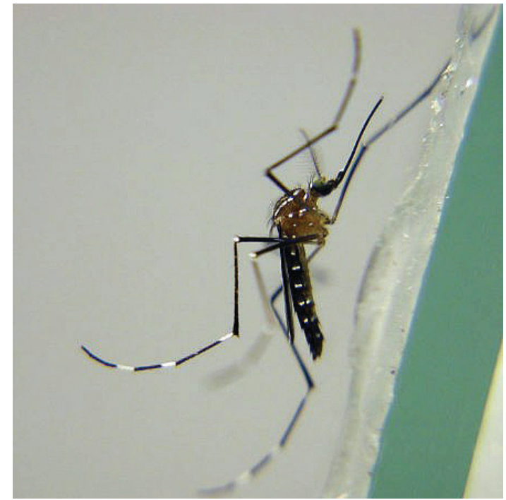
Figure 6. Aedes bahamensis.

This non-native species was first discovered in Florida during surveillance for the Asian tiger mosquito (Pafume et al. 1988). Because it is not known to have spread outside of Broward and Miami-Dade Counties and does not require blood to develop an egg batch (O'Meara et al. 1993), A. bahamensis (Figure 6) is not regarded as a public health threat comparable to the two previous, invasive species.