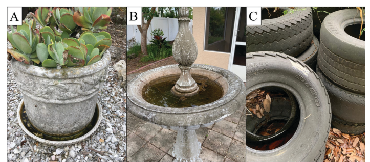
Figure 3. Examples of artificial containers frequently occupied by immature mosquitoes. A. Plant pot saucer; B. Neglected bird bath; C. Discarded tires.

Some of Florida's container mosquitoes are invasive species, i.e., non-native to the United States, introduced inadvertently by humans, and having a known or potential negative impact on human or ecosystem health (Juliano and Lounibos 2005). The transport of containers occupied by immature stages of these species has facilitated their international and local spread (Juliano and Lounibos 2005). Both the yellow fever mosquito, Aedes aegypti, introduced by the slave trade from Africa during the 15<sup>th</sup>-17<sup>th</sup> centuries (Lounibos 2002), and the Asian tiger mosquito, Aedes albopictus, spread from Asia by the international trade of used tires in the late 20<sup>th</sup> century (Lounibos 2002), are currently widespread in Florida (Parker et al. 2019). Because these two container mosquito species are broadly distributed in Florida and the most important vectors of the arboviruses (arthropod-borne viruses) that cause dengue, chikungunya, and Zika diseases, their surveillance and control are a priority of many of Florida's mosquito control programs.