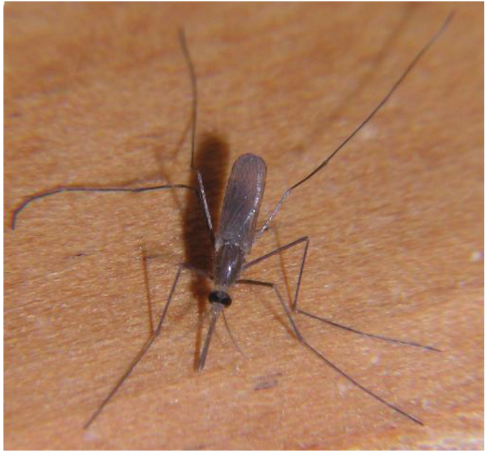
Figure 10. Adult female Anopheles barberi.