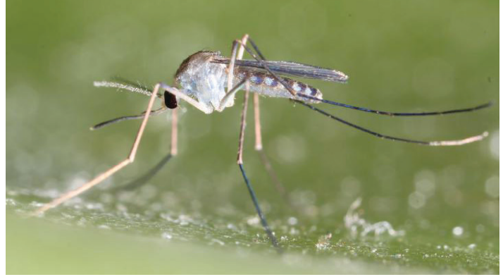
Figure 11. Adult female Culex biscaynensis.

9. Orthopodomyia signifera (Coq.) and Orthopodomyia alba (ornate treehole mosquitoes)