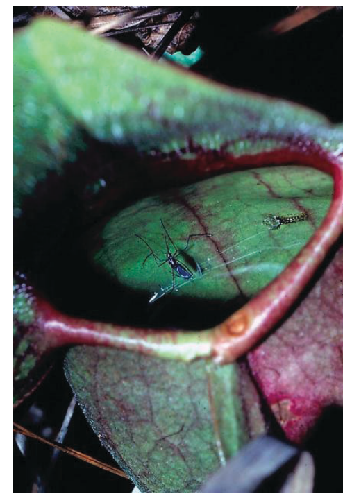
Figure 15. Adult female Wyeomyia smithii in leaf of purple pitcher plant.

Like its sister species W. mitchellii , immature W. vanduzeei can be found in bromeliads native to Florida as well as in the water-filled tanks and leaf axils of exotic ornamental bromeliads that have been imported into Florida. The range of this species on the Florida peninsula is similar to that of its sister species W. mitchellii , but the preferred habitats of the two species differ in sun/shade exposure, with W. vanduzeei (Figure 16) being more prevalent in bromeliads exposed to more sun compared to W. mitchellii (Frank and O'Meara 1985).