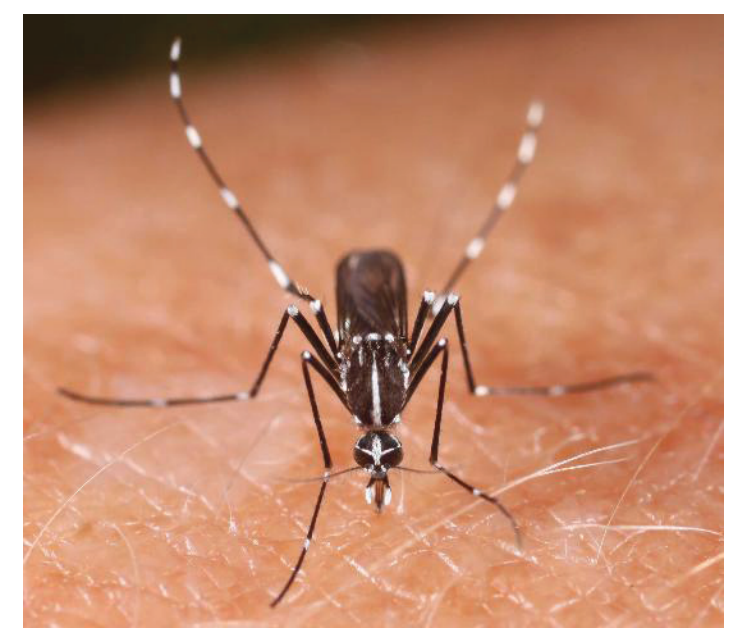
Figure 5. Adult female Aedes albopictus. 3. Aedes bahamensis Berlin (Bahamian container mosquito)

This invasive species became established in Texas in the mid-1980s before entering Florida from the north and sweeping southward through the peninsula (Lounibos 2002). During its spread from Texas into the southeastern United States, A. albopictus (Figure 5) competitively displaced A. aegypti from parts of its former range (Lounibos 2002; Lounibos and Juliano 2018). Although A. albopictus is currently distributed throughout Florida, where it often co-occurs with A. aegypti , the Asian tiger mosquito is preferentially found in containers in vegetated zones, such as suburban yards (Braks et al. 2003).