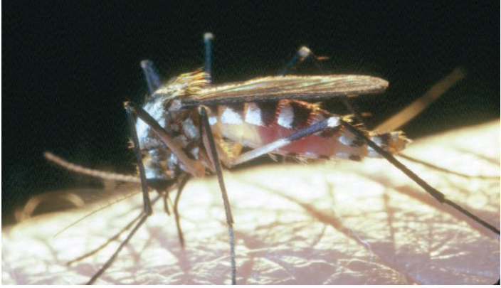
Figure 7. Adult female Aedes hendersoni.

To date, this species has been identified in Florida from only the more northern, temperate area of the state (Zavortink and Belkin 1979) where it co-occurs with its sister species, Aedes triseriatus (see below). The two vertically segregate in hardwood forests of the United States, with A. hendersoni (Figure 7) preferring higher treeholes and A. triseriatus lower (Scholl and DeFoliart 1977).