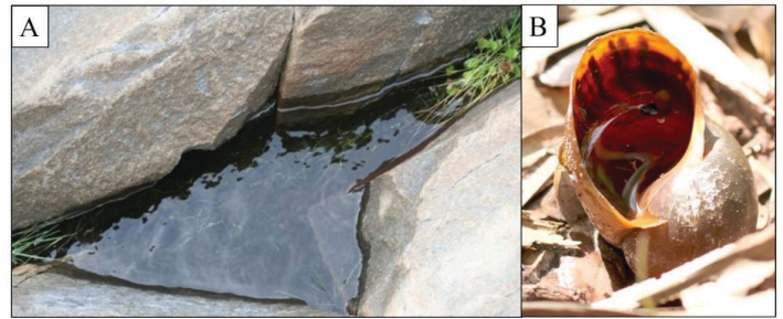
Figure 2. Examples of natural but non-living containers frequently occupied by immature mosquitoes. A. Rock pool; B. Golden apple snail shell.