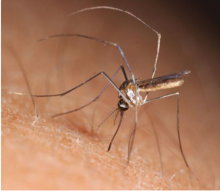
Figure 14. Adult female Wyeomyia mitchellii.

any pathogens, but the two sister species can be daytime biting pests where exotic bromeliads proliferate in suburban gardens (Frank 1985). In addition to Florida, W. mitchellii (Figure 14) is now thriving in Hawaii, having hitchhiked across the Pacific and established in bromeliads planted in gardens (Shroyer 1981).