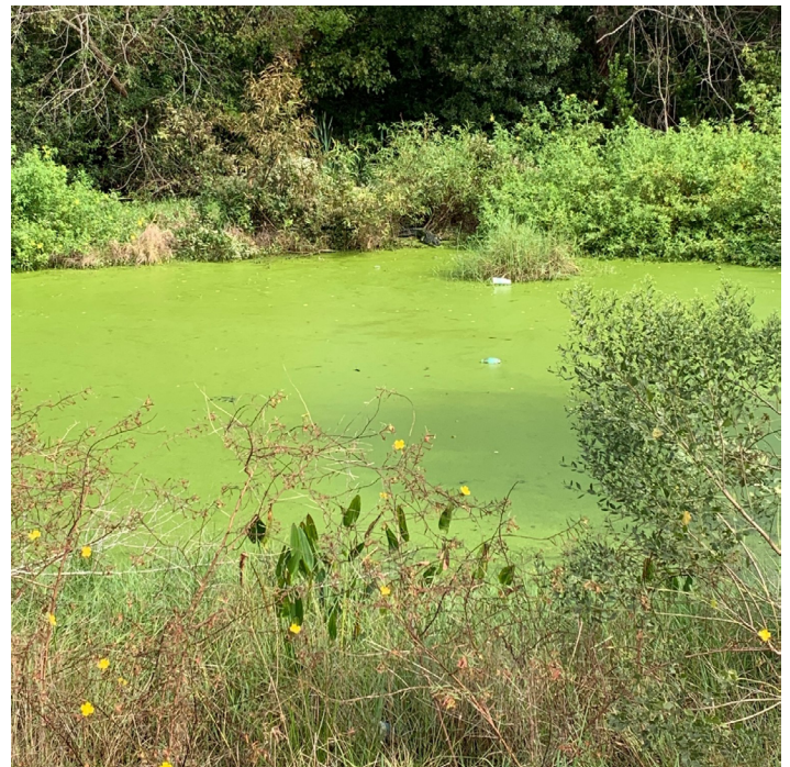
Figure 3. A eutrophic pond with stagnant water. This pond is likely highly stratified with low dissolved oxygen in the bottom waters.

The word "algae" has almost become a dirty word in Florida, because it has many negative connotations. But algae are not "good" or "bad." In the right concentrations, algae are an important part of a natural, functioning aquatic ecosystem. Algae are a food source for animals, can absorb excess nutrients from the water, and produce oxygen via photosynthesis. However, when free-floating algae (phytoplankton) grow to excess (Figure 3), they can block the sunlight from reaching submersed vegetation and can lead to low DO conditions, which can result in a fish kill (see below). Furthermore, some species of algae or cyanobacteria (blue-green algae) can cause algal blooms that produce toxins that can be harmful to humans or wildlife. Toxin-producing algal blooms are commonly referred to as harmful algal blooms. For more information, refer to the EDIS topic area on harmful algal blooms, available at https://edis.ifas.ufl.edu/topic_harmful_algal_blooms .