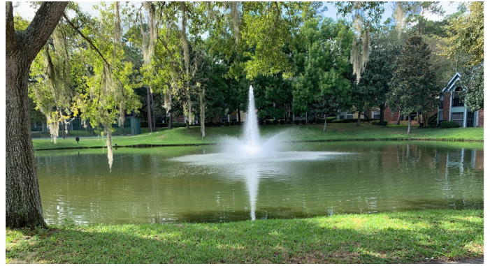
Figure 1. A stormwater pond in a residential neighborhood in Gainesville, FL. This fountain provides important functions to the pond while also providing aesthetic benefits.

Natural processes within an aquatic ecosystem can remove various pollutants, such as nitrogen and phosphorus, via plant uptake or microbial transformations. These natural processes represent temporary (vegetation and certain microbial processes) or permanent (specific microbial processes) removal of nutrients and pollutants from the water column, reducing potential impacts on downstream ecosystems. For instance, vegetation requires nutrients for growth, and therefore plants can act as a filter to remove nutrients from the water column. However, this is only a temporary solution as vegetation will eventually die and decay, returning any stored nutrients back to the water. In contrast, denitrification is a natural microbial process that occurs within pond sediments, providing a permanent removal of nitrate from the water column (for more on the nitrogen cycle, see https://edis.ifas.ufl.edu/ss641 ). When coupled together, permanent and temporary processes of nutrient removal can reduce eutrophication, an increase in primary production (from plants or algae) typically caused by an accumulation of nutrients (naturally or via human inputs like fertilizer, grass clippings, and pet waste). Eutrophication can result in hypoxia (low oxygen concentrations in the water column) via decomposition of algae or an abundance of respiration by plants and animals. For more information on eutrophication, visit https://edis.ifas.ufl.edu/sg118 .