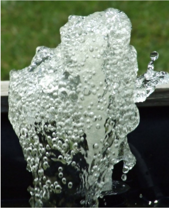
Figure 2. A bottom aerator, also known as a bubbler, propels air collected from a blower located on the pond shore or bank through diffusers. Bubbles can optimize pond function, especially for ponds greater than eight feet in depth.

bringing oxygen-poor water with them to the pond surface. Fountains expose water to the atmosphere in long sprays, while bubblers create bubbles and ripples at the surface. Either fountains or blowers can enhance aeration and mixing of a pond, with fountains typically recommended for shallow ponds, whereas bubblers are more effective in deeper ponds.