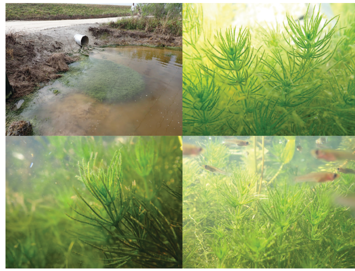
Figure 1. Images of Chara in the field, including large beds that create underwater habitats for aquatic life. Credits: E. Becks and D. E. Berthold

differentiated at the apex, nodes, and basal region. The basal region consists of colorless rhizoidal branches, which are used for attachment to muddy or silty substrates. The rhizoids of these algae do not uptake nutrients; rather, these algae translocate nutrients from the water column via cell-to-water interface (Perez et al. 2014).