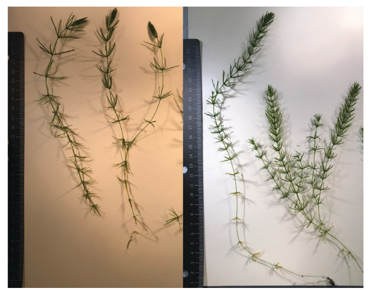
Figure 4. Chara plants. Left: Chara zeylanica . Right: C. haitensis .

Florida. In the field, Chara can often be mistaken for Nitella or coontail (Ceratophyllum demersum L.) due to superficial similarities in morphology. Although the genus Chara is the richest in species number within the order, species discrimination is complicated. Morphological identification is based on features of the stem-such as length and number of spine cells, length of stipulodes (needle-shaped structures), and cortication-and reproductive structures, and many of these features overlap among species. Two species of Chara abound in south Florida waters-Chara haitensis Turpin and C. zeylanica Klein ex Willdenow-and their morphology is very similar. The main differences between them are that C. haitensis has longer lengths, larger stem diameters, and longer branches than C. zeylanica. Visually, C. haitensis appears longer and finer, while C. zeylanica appears shorter with more pointed branchlets (Figure 4). Because Chara species are morphologically similar, simultaneous morphological and genetic analyses are warranted for more reliable identification.