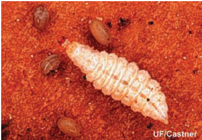
Figure 2. Large larval Pheropsophus aequinoctialis pictured next to mole cricket eggs.

Larvae take approximately 10 days to develop to final instar larvae after hatching from eggs. There are three distinct larval instars for Pheropsophus aequinoctialis and all have a white body, an eyeless, cream colored head, and darkened mandibular (chewing) mouthparts (Figures 2 and 3) (Frank et al. 2009). However, Pheropsophus aequinoctialis undergoes what is known as hypermetamorphosis whereby the first and subsequent juvenile forms (instars) look markedly different from one another (beyond the typical size increase seen between molts in most immature insects). Specifically, the first instars of Pheropsophus aequinoctialis have longer legs and a narrower body than those of subsequent instars (Weed 2003).