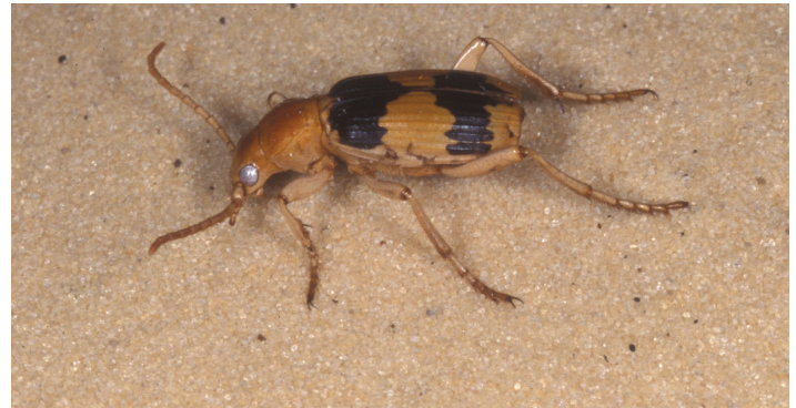
Figure 1. Adult Pheropsophus aequinoctialis .

aequinoctialis typically inhabits riverbanks, sandbars, or in soils adjacent to bodies of freshwater, areas where Neoscapteriscus mole cricket species also inhabit (Frank et al. 2009).