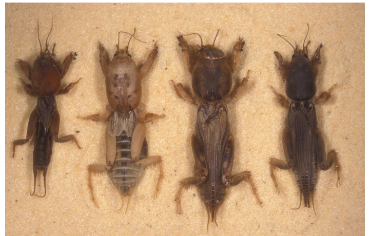
Figure 5. From left to right: northern mole cricket ( Neocurtilla hexadactyla ), short winged mole cricket ( Neoscapteriscus abbreviatus ), tawny mole cricket ( Neoscapteriscus vicinus ), and southern mole cricket ( Neoscapteriscus borellii ).

adult female Neocurtilla mole crickets are thought to actively monitor and defend their egg clutches, a trait that might reduce risks associated with introducing Pheropsophus aequinoctialis into the mole cricket's natural range (Frank et al. 2009). Aside from concerns about the beetle's effects on the northern mole cricket, Pheropsophus aequinoctialis adults were also found to be phoretic carriers of nematodes, mites, and fungi, which raised concerns about potential ancillary introductions of other exotic organisms (Frank et al. 2009). Risks associated with accidentally introducing an invasive pest (or associated pathogen) by way of Pheropsophus aequinoctialis warrants further research before using the beetle as a biological control agent in the United States. Still, other biological control organisms (e.g. Steinernema scapterisci , Larria bicolor ) released under the MCBCP have established self-sustaining populations and saved Florida's cattle industry an estimated $13 million annually since their establishment (Mhina et al. 2016). One possible advantage of using Pheropsophus aequinoctialis is that its natural riverine/water habitat may allow pest managers to avoid pesticides in these areas, which can pose risks to aquatic life (Frank et al. 2009). Therefore, Pheropsophus aequinoctialis may have additional untapped economic benefits to supplement existing mole cricket control programs.