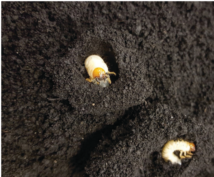
Figure 3. White grubs (Coleoptera: Scarabaeidae).

The second group of soil insect pests reported causing significant damage in Florida sugarcane historically were white grubs (Coleoptera: Scarabaeidae) (Figure 3).