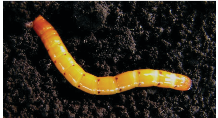
Figure 1. Melanotus communis wireworm (Coleoptera: Elateridae). Credits: Mike Karounos

Abundance of soil insect pests from 20 commercial sugarcane fields (sampled 2015 and 2016) is shown in Table 1. Insects were collected from intact sugarcane stools by hand. Sampling was done post-harvest for easier access to fields. For more detailed methods on survey sampling, see Changes in the Relative Abundance of Soil-Dwelling Insect Pests in Sugarcane Grown in Florida , on which this publication was based: Cherry et al. (2017), https://doi.org/10.18474/JES16-33.1 .