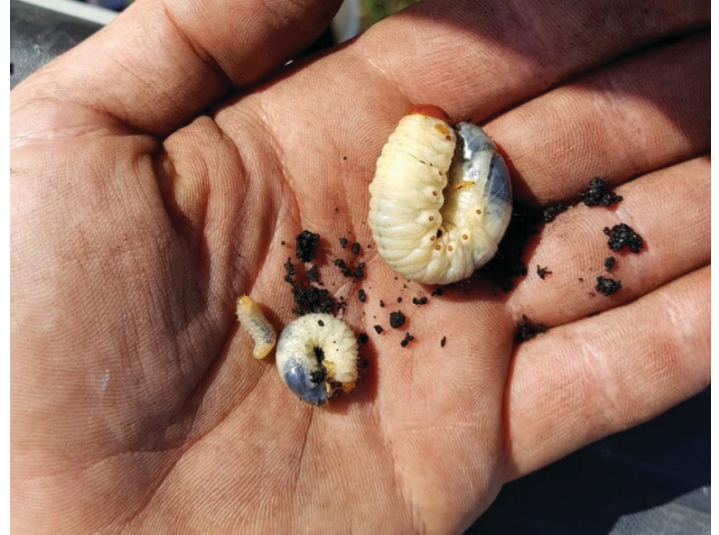
Figure 4. Diaprepes grub (left), a typical scarab grub (middle), and a Tomarus subtropicus grub (right). Typical size differences.

although not causing damage. We did not find this latter species in any of our samples. Of special interest are our findings with T. subtropicus (Figures 4 and 5).