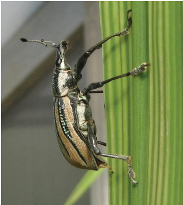
Figure 6. Diaprepes abbreviatus sugarcane root weevil adult on sugarcane.

Diaprepes root weevil ( Curculionidae ), Diaprepes abbreviatus (L.), is an important pest of sugarcane and citrus in various islands of the Caribbean. It has long been a pest in Florida citrus. In 2010, infestations of the weevil were observed causing damage to Florida sugarcane for the first time (Cherry et al. 2011) (Figure 6).