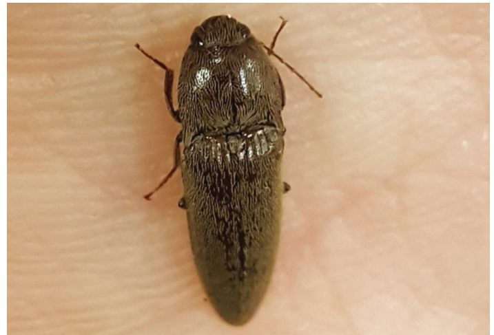
Figure 2. Melanotus communis adult click beetle (Coleoptera: Elateridae).