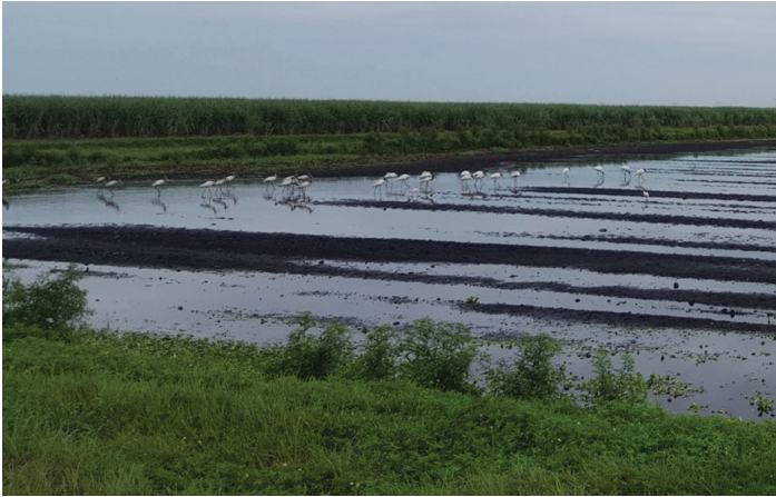
Figure 9. Wood storks foraging in a naturally flooded sugarcane field.

publications for sugarcane soil insect IPM . Flooding can kill soil insects directly by drowning them, or it can kill them indirectly by exposing them to predation, often by diverse and abundant birds (Figure 9).