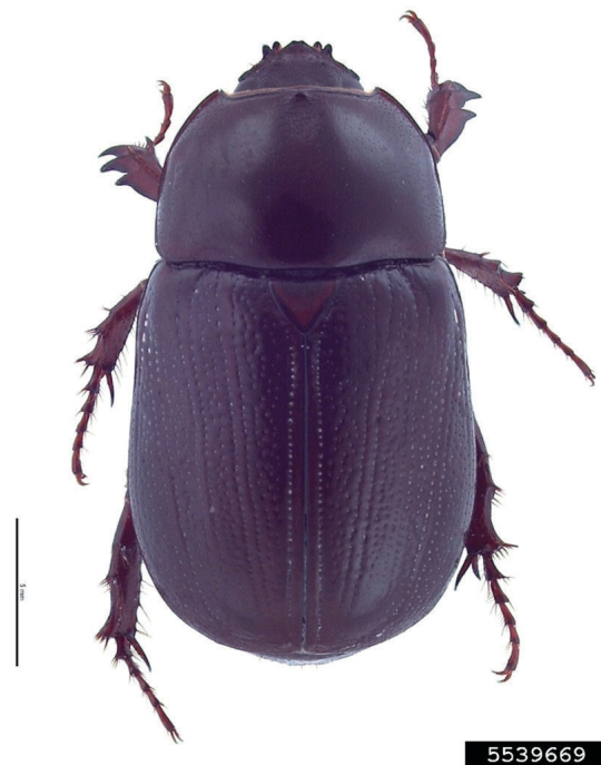
Figure 5. Tomarus subtropicus adult female (Coleoptera: Scarabaeidae).

Our study was conducted using methods very similar to the historical surveys. However, despite sampling more fields, we found no T. subtropicus in our 2015 and 2016 surveys. This is consistent with R. H. Cherry's observation that no incidences of grub damage in Florida sugarcane have been reported during the last ca. 20 years while working in the heart of Florida sugarcane. Hence, what was once the