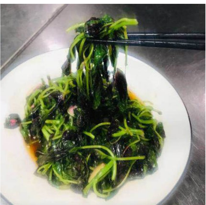
Figure 2. Wok stir-fried vegetable amaranth ( Amaranthus tricolor L.) with garlic.

potassium), and all essential amino acids (Table 1) (Ebert et al. 2011; Fern 2014; USDA-ARS 2019). However, the leaves and stems of this plant may contain some antinutrients like nitrates and oxalates, which can bind calcium and cause kidney stones for those prone to this disease (Massey et al. 1993; Schippers 2000). These chemicals can be removed by adequate cooking but may still pose a health threat from eating the uncooked plant in excess (>7 oz/day) (Alegbejo 2013; Ebert et al. 2011; Schippers 2000).