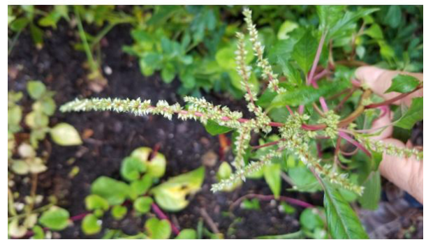
Figure 4. Vegetable amaranth ( Amaranthus tricolor L.) flowers. Top: The plant starts blooming. Bottom: Two weeks after blooming started.

The entire vegetable amaranth plant is laxative and diuretic (Ebert et al. 2011; Fern 2014). Vegetable amaranth has potential pharmacological properties, including antimicrobial, antioxidant, and antibacterial activities (Srivastava 2017). The polyphenolic content plays a key role in fighting free radicals (Rao et al. 2012; Srivastava 2017), and the tannin content inhibits the growth of microorganisms (Pulipati et al. 2014; Srivastava 2017).