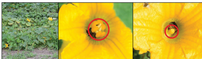
Figure 1. A squash field in bloom (left), a female flower (center), and a male flower (right). Flower reproductive organs that can be used to sex flowers are circled in red.