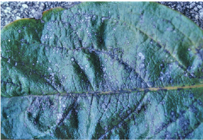
Figure 20. Phyllosticta spotting on persimmon leaf.