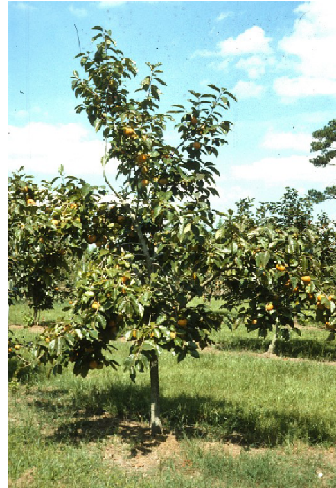
Figure 3. Modified central leader system.

laterals every 8–12 inches to keep. The goal is to have 4–6 well-spaced branches radiating from the trunk. Once this is achieved, the central leader is then “modified” by cutting it back to the final lateral branch, which will limit significant height increases in the future (Figure 3).