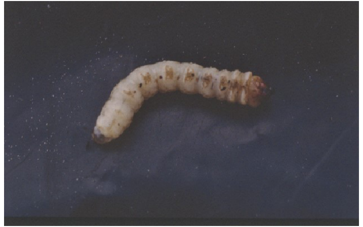
Figure 13. Tree borer of persimmon.