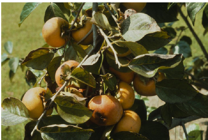
Figure 7. Very heavy crop load, unthinned.

Thinning persimmon fruit is often needed to regulate the crop load (Figure 7) and to help limit the alternate bearing tendency. Some regulation of crop load can be made through judicious pruning during the winter. Most flower buds will grow from the few end buds on a branch tip. By leaving some of these unpruned, some tipped a bud or two, and other weak branches pruned back further, less thinning of fruit is required. Hand thinning is done just after the first natural fruit drop, or about 3 weeks after flowering. Fruit should be spaced 6 inches apart on a branch to prevent rubbing damage to adjacent fruit. Remove any deformed or damaged fruit, and leave the fruit with the largest calyxes for the best fruit quality at harvest.