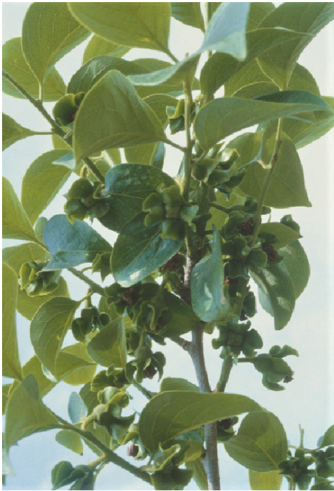
Figure 6. Persimmon shoots with flowers.