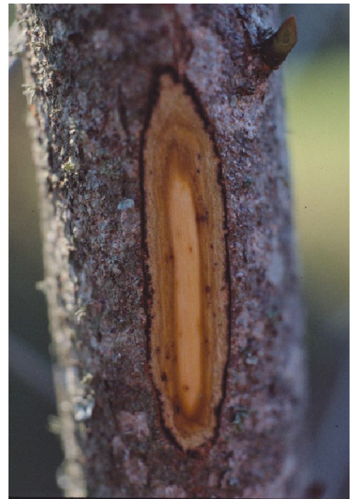
Figure 10. Damage from scale under the bark.