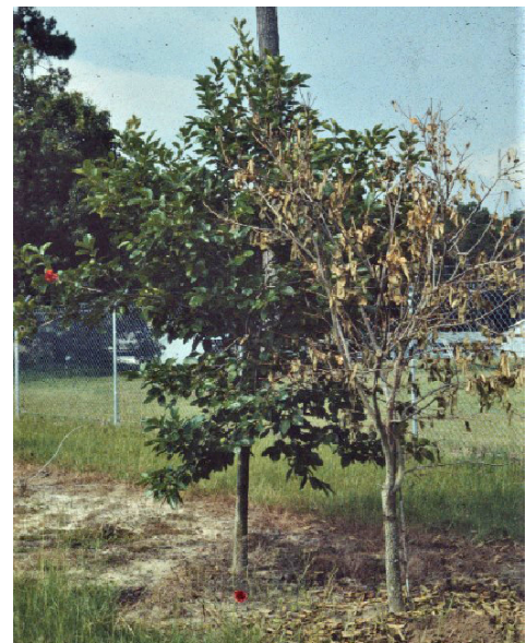
Figure 23. Whole persimmon tree decline.