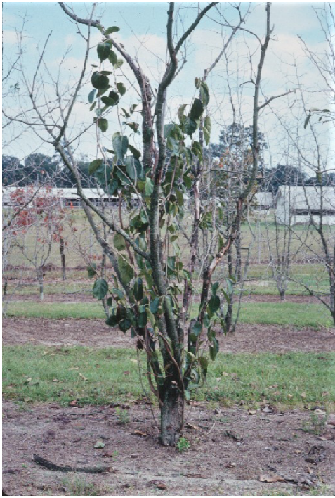
Figure 8. Freeze damage and regrowth from dormant buds.