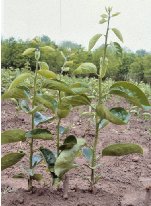
Figure 1. Chip-budded trees.

orchard but is typically performed on much older trees. If rootstocks are available, but scion bud wood happens to be limited, one temporary strategy would be to establish the rootstock in the field, and to bud or graft the scion in situ when material is available.