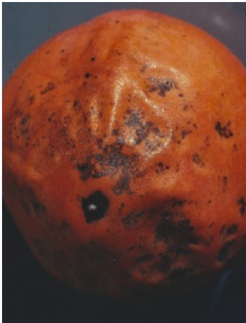
Figure 16. Fruit spotting on persimmon.