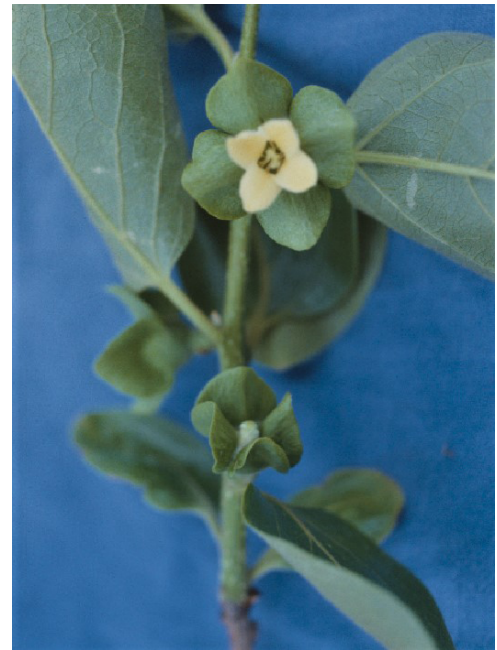
Figure 4. Female persimmon flower.

level, because persimmons tend toward biennial bearing if fruit load is high. Mature trees of smaller-fruited cultivars may reasonably support 250–300 fruit per tree at maturity, whereas larger-fruited cultivars could handle 150–200 fruit per tree. Trees will begin bearing fruit by the third year, with 8–10 years required for full production. Recent production data from 2013–2014 in California shows the average persimmon yield is 5.4 tons per acre. Estimates of production in south Florida are in the 3.6–5.4 tons per acre range, and north Florida is likely on the higher end. Yields are generally lower for the nonastringent varieties.