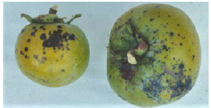
Figure 18. Anthracnose on persimmon fruit.