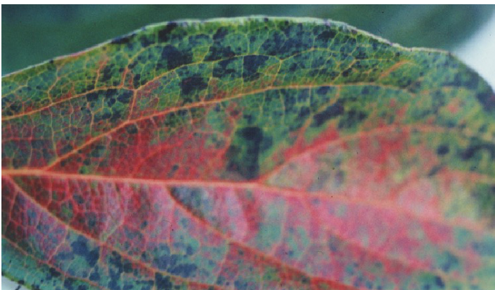
Figure 21. Alternaria spotting on persimmon leaf.