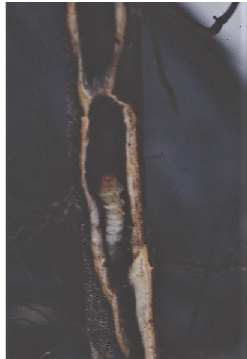
Figure 14. Tree borer inside the root.