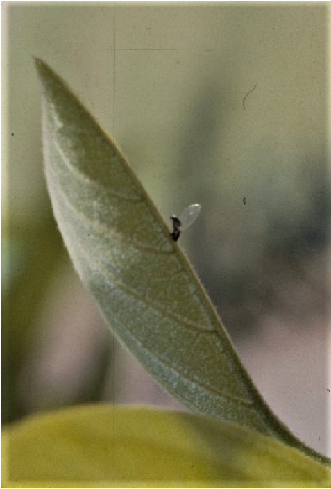
Figure 11. Adult persimmon psylla on leaf.