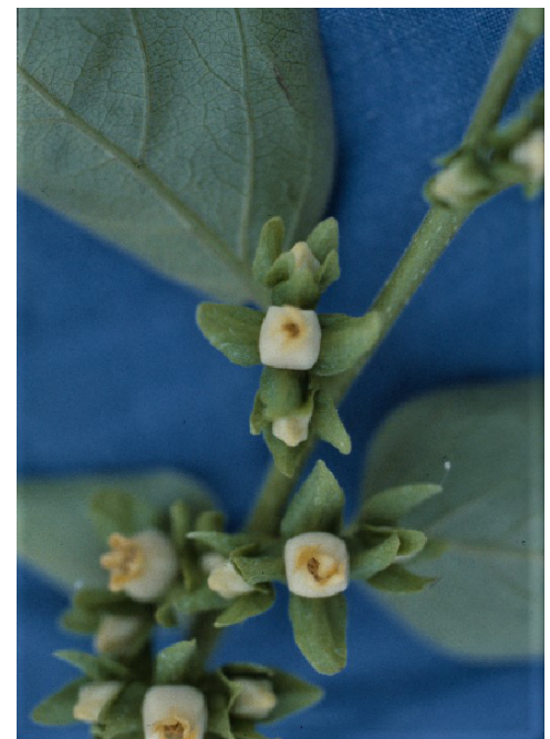
Figure 5. Male persimmon flowers.