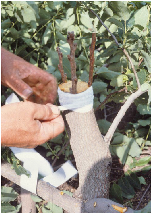
Figure 2. Top-grafting scions.