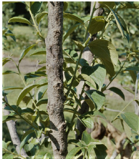
Figure 24. Persimmon decline canker on the trunk.