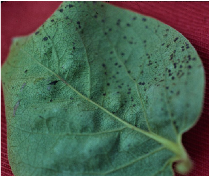
Figure 19. Persimmon leaf spotting.