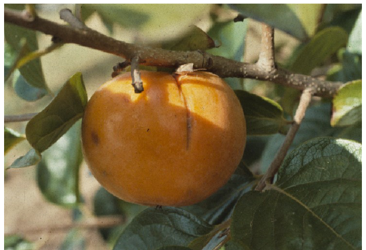
Figure 15. Stink bug on persimmon fruit.