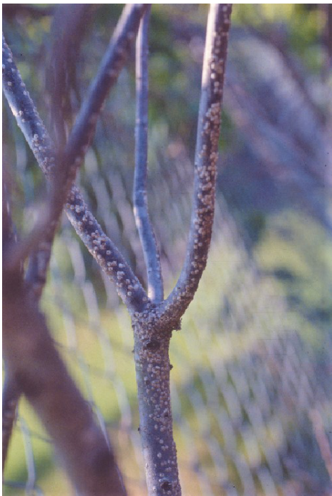
Figure 9. Scale on persimmon.