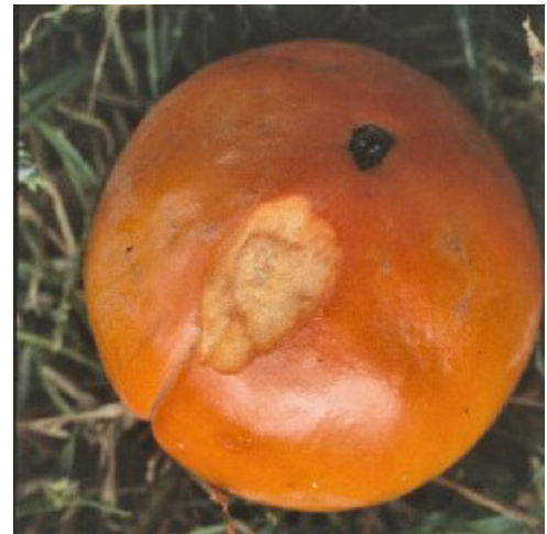
Figure 17. Anthracnose on persimmon fruit.