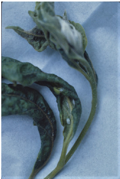
Figure 12. Psylla nymphs on distorted leaves.