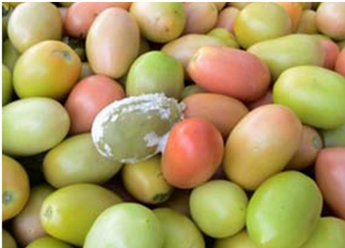
Figure 8. Water mold covering infected fruit (snowball) and spreading to adjacent fruit.

have lost their gel due to a severe internal bruise (Figure 11) are likely to develop internal blackspot. This disease usually does not spread from fruit to fruit in boxes. Green fruit are quite resistant unless exposed to chilling temperatures, blossom-end rot, or damage by certain spray mixtures.