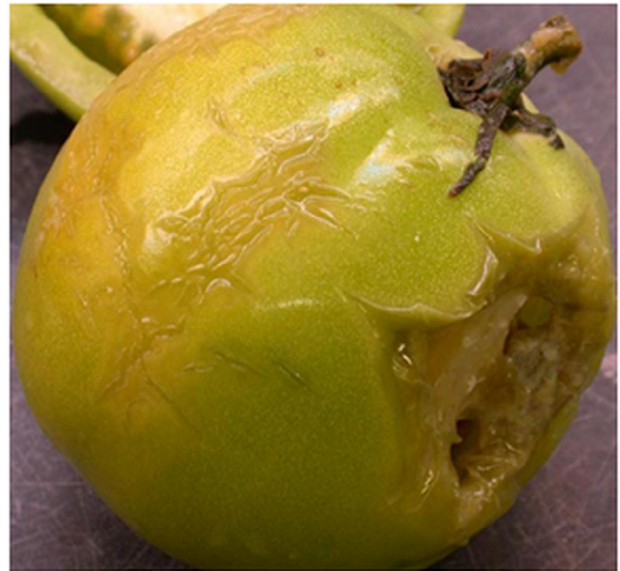
Figure 3. Watery-rot phase of sour rot on water-congested green fruit.

The sour-rot pathogen, Geotrichum candidum , is a type of yeast. Its growth on lesions on fruit resembles a thick, gelatinous mass similar in appearance to cottage cheese. The lesions themselves may initially be watery (Figure 3) but later become coated with pathogen growth (Figure 4) and remain relatively firm unless a secondary infection by a soft rot bacterium occurs. However, the odor of these lesions is similar to that produced by lactic acid bacteria, hence the disease name, sour rot.