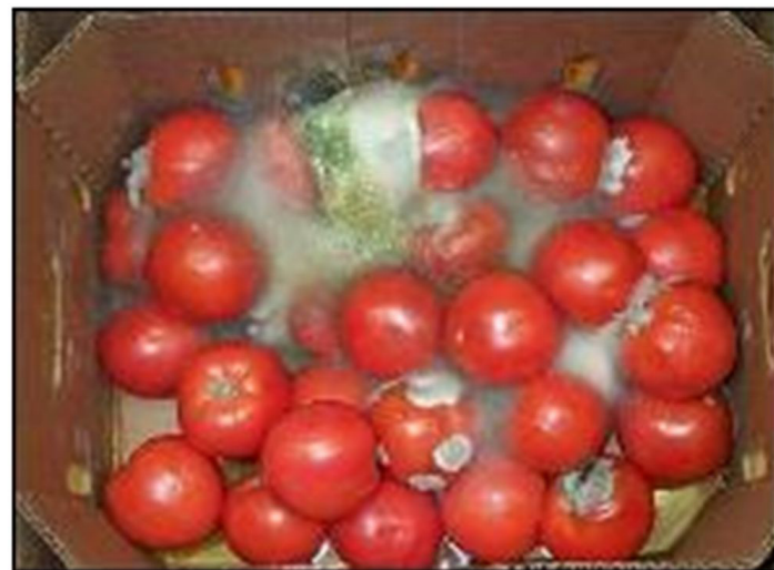
Figure 6. A carton of tomatoes with “nested” Rhizopus rot (and secondary fungi).

Black mold rot often appears on the shoulders, by the stem scar, or on the blossom end of fruit that has been injured by chilling, calcium deficiency, sun exposure, climatic factors that cause fruit cracking (e.g., high temperatures and high rainfall), pesticide phytotoxicity, imperfectly closed blossom-end pores (catfacing), and, perhaps, harvests during cold weather. Several different pathogens may cause black mold rots including Alternaria arborescens , Stemphylium botryosum , or S. consortiale . Lesions are initially sunken or flattened areas associated with a crack or other injury that quickly become covered with a dark brown to black mold (Figure 9). Internal lesions may develop from an infected stylar pore or vascular strand connected to the stem scar (Figure 10). In particular, dry locular cavities that