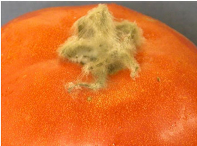
Figure 12. Storage mold covering an attached stem but without evidence of penetration into the fruit.

Storage molds can develop on fruit that have been gassed or stored for prolonged periods of time in humidified rooms. These molds grow over the stem scar, attached stem, blossom scar or other corky areas (Figure 12). They are generally nonpathogenic and do not penetrate into the flesh of the fruit. However, the mold detracts from the appearance of the fruit and may lead to shipment rejection.