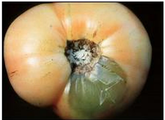
Figure 1. A typical bacteria soft rot lesion.

ubiquitous and have been found in places as diverse as ocean spray off the coast of California, snow in the Rocky Mountains, well water in a few locations, and surface water nearly everywhere. These soft rot strains can grow on the surface of plants and cause a soft rot of succulent plant parts, particularly during wet weather. They can be spread by rainstorms, insects, harvest crews, picking containers, and packinghouse equipment. Fortunately, these bacteria cannot penetrate directly through the waxy skin of a tomato. However, small wounds, even the size of abrasion from sand particles or tiny cuticle cracks, enable the bacteria to infect fruit tissues. Additionally, fruit may internalize the bacteria (see discussion below on internalization). Cells inside the fruit lack a cuticle or other structures that protect the fruit surface from direct pathogen attack. Consequently, soft rot bacteria that are internalized initiate lesions that begin inside the fruit (Figure 2).