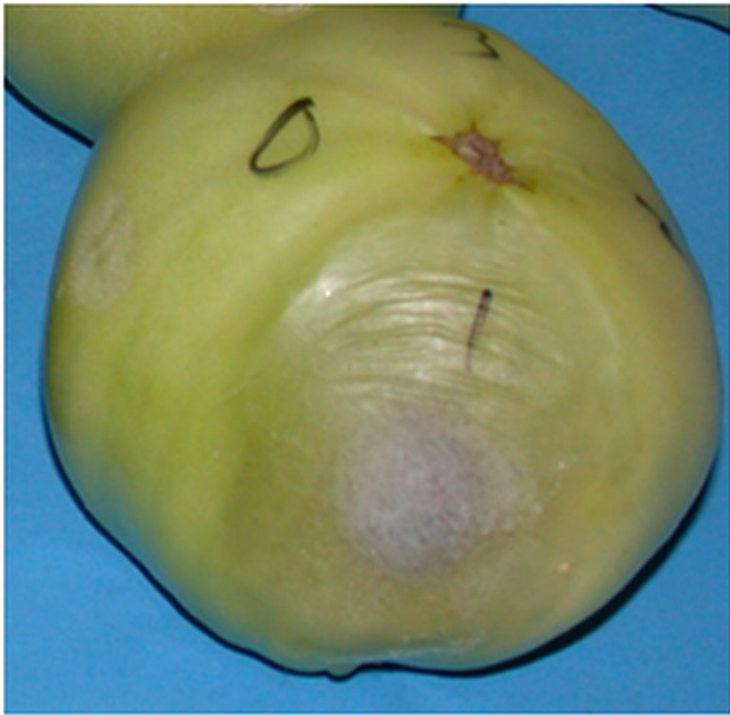
Figure 5. Rhizopus rot on green fruit.

water-soaked and may exude a clear liquid (Figure 5). The lesion surface may be covered with thin, cotton-like fungal structures (especially under humid conditions). Tissues within the lesion are usually held together by relatively coarse strands of fungal hyphae. Dark sporulation may crown the white tuft of Rhizopus . The mycelium can infect adjacent fruit through natural openings or mechanical wounds, creating nests of mold and diseased fruit (Figure 6). The spores are extremely small and lightweight, and can be carried by air currents to infest new fruit, potentially far from the source. Under favorable conditions, Rhizopus has been observed to grow short distances on dry surfaces, such as pallets and cartons, and it may survive for months in fruit residues left in picking containers and field bins.