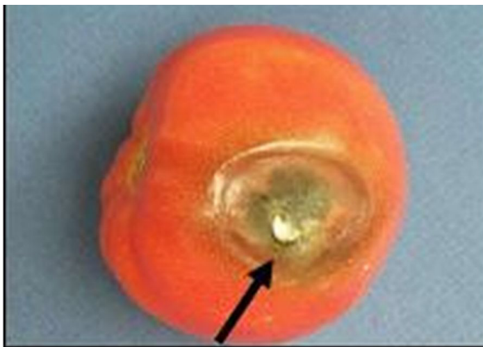
Figure 9. A fruit with a fingernail wound (arrow) that later developed into black mold rot.

Several other fungi can infect tomato fruit in the field and later lead to postharvest decays. However, these, like black mold rot, rarely spread among fruit within a box and can be considered minor decay problems for Florida tomatoes. However, each of these diseases can provide entry points for more aggressive decays such as bacterial soft rot, Rhizopus rot, or sour rot. Fusarium rots can develop on tomatoes that are in contact with the soil and/or have been chilled in the field. The surface of the lesions is covered with fluffy white mycelium with undertones ranging from shades of pink of orange to purple. Target spot ( Corynespora cassiicola ) develops on tomatoes (plants and fruit) during long