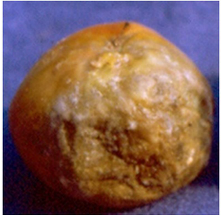
Figure 7. Advanced buckeye rot.

Phytophthora , or buckeye rot , usually causes a circular rot that looks water-soaked, later darkening in the center and/or becoming overgrown with sparse, white mycelia (Figure 7). The pathogen belongs to a group of microorganisms often referred to as “water molds,” because their infectious propagules are dispersed by water. Therefore, buckeye rot often develops on fruit growing near wet spots in a field. Initial symptoms appear as small stains in the fruit surface. On harvested fruit these stains may be overlooked by sorters. However, in storage the small stains enlarge, and the pathogen can move from diseased to adjacent healthy fruit, leading to the term “buckeye nesting” or “snowballs” (Figure 8). Buckeye rot is rare during normal production seasons but is not uncommon during wet periods, particularly if standing water exists in fields.