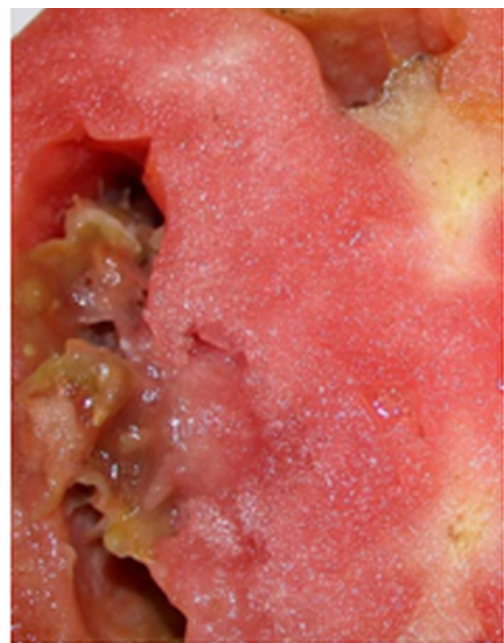
Figure 11. Dry locular cavity due to severe internal bruise.