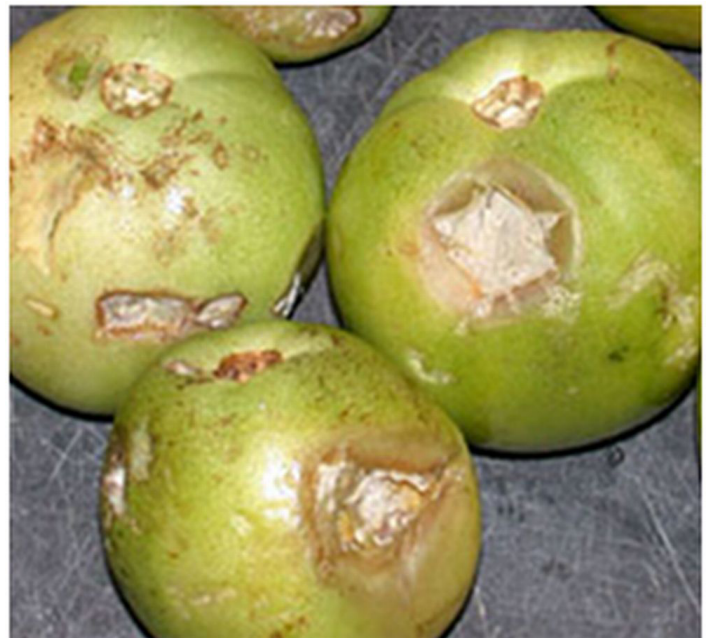
Figure 4. Sour rot lesions covered with pathogen growth.

A second common fungal pathogen is Rhizopus stolonifer , which is in the bread mold group of fungi. This pathogen grows very aggressively . On tomatoes, Rhizopus rot appears