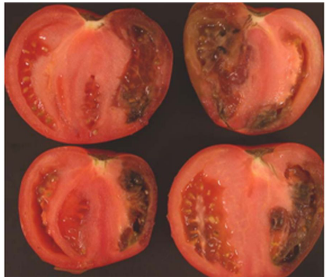
Figure 10. Internal black mold rot lesions developing in fruit harvested (as pinks) during a cold morning.

periods of high moisture and warm ambient temperatures. Fruit lesions are small, dark brown spots that enlarge and split open as the fruit ripens. If the disease becomes severe in the field, the plants will defoliate, thereby exposing the fruit to sunlight, which increases surface cracking and sun damage. Phoma rot ( Phoma destructiva ) begins at the blossom end of fruit as sunken black spots with water-soaked edges and dark-centered rings, similar in appearance to buckeye rot. Anthracnose , caused by Colletotricum spp. develops on primarily ripe to overripe fruit, usually during wet, warm conditions. Cladosporium rot , caused by Fulvia fulva , develops under highly humid conditions, usually in greenhouses or under high-tunnel production systems.