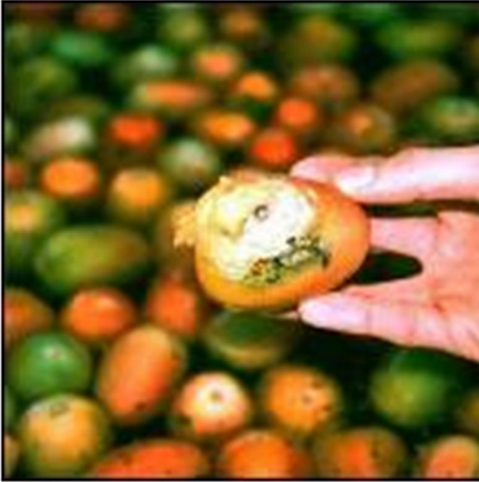
Figure 13. An infected tomato can spread inoculum to healthy tomatoes in the flume/dump tank.

sites when the tomatoes are transferred from the picking container (field bin, gondola) to the packing line and into cartons (Figure 13). Sufficient sanitation requires the inactivation of freshly introduced microbes within about 10 seconds of initial contact in the dump tank water. Suspended microbes that are not killed within 10 seconds may internalize in wounds or stem scars on tomatoes where they are protected from antimicrobial treatments. “Vigilance” is the key word in preventing decay. In the following section, key considerations are presented for establishing good management practices (GMPs) to maintain sanitary conditions during tomato packing and handling.