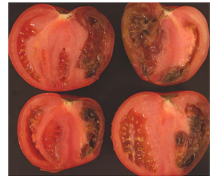
Figure 10. Internal black mold rot lesions developing in fruit harvested (as pinks) during a cold morning.

periods of high moisture and warm ambient temperatures. Fruit lesions are small, dark brown spots that enlarge and split open as the fruit ripens. If the disease becomes severe in the field, the plants will defoliate, thereby exposing the fruit to sunlight, which increases surface cracking and sun damage. Phoma rot ( Phoma destructiva ) begins at the blossom end of fruit as sunken black spots with water-soaked edges and dark-centered rings, similar in appearance to buckeye rot. Anthracnose , caused by Colletotricum spp. develops on primarily ripe to overripe fruit, usually during wet, warm conditions. Cladosporium rot , caused by Fulvia fulva , develops under highly humid conditions, usually in greenhouses or under high-tunnel production systems.