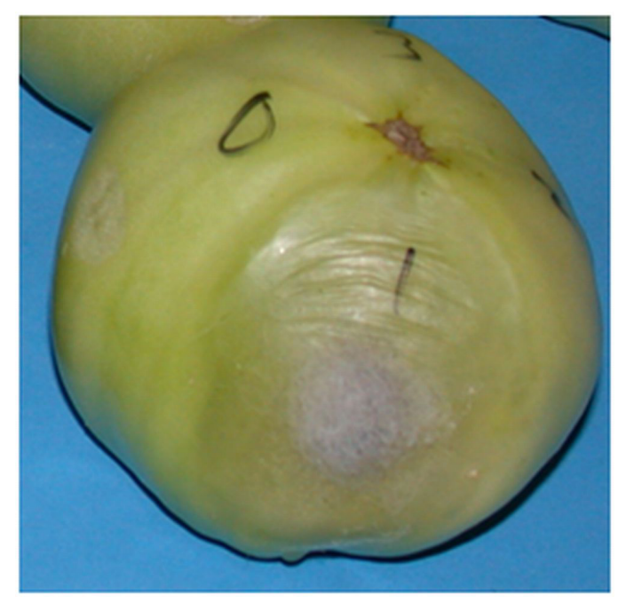
Figure 5. Rhizopus rot on green fruit.

water-soaked and may exude a clear liquid (Figure 5). The lesion surface may be covered with thin, cotton-like fungal structures (especially under humid conditions). Tissues within the lesion are usually held together by relatively coarse strands of fungal hyphae. Dark sporulation may crown the white tuft of Rhizopus . The mycelium can infect adjacent fruit through natural openings or mechanical wounds, creating nests of mold and diseased fruit (Figure 6). The spores are extremely small and lightweight, and can be carried by air currents to infest new fruit, potentially far from the source. Under favorable conditions, Rhizopus has been observed to grow short distances on dry surfaces, such as pallets and cartons, and it may survive for months in fruit residues left in picking containers and field bins.