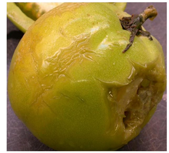
Figure 3. Watery-rot phase of sour rot on water-congested green fruit.

The sour-rot pathogen, Geotrichum candidum , is a type of yeast. Its growth on lesions on fruit resembles a thick, gelatinous mass similar in appearance to cottage cheese. The lesions themselves may initially be watery (Figure 3) but later become coated with pathogen growth (Figure 4) and remain relatively firm unless a secondary infection by a soft rot bacterium occurs. However, the odor of these lesions is similar to that produced by lactic acid bacteria, hence the disease name, sour rot.