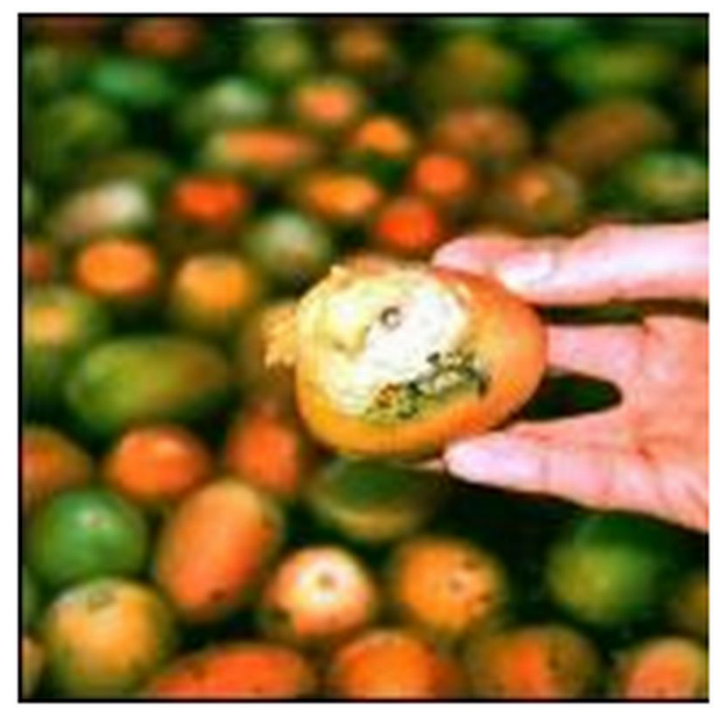
Figure 13. An infected tomato can spread inoculum to healthy tomatoes in the flume/dump tank.

sites when the tomatoes are transferred from the picking container (field bin, gondola) to the packing line and into cartons (Figure 13). Sufficient sanitation requires the inactivation of freshly introduced microbes within about 10 seconds of initial contact in the dump tank water. Suspended microbes that are not killed within 10 seconds may internalize in wounds or stem scars on tomatoes where they are protected from antimicrobial treatments. "Vigilance" is the key word in preventing decay. In the following section, key considerations are presented for establishing good management practices (GMPs) to maintain sanitary conditions during tomato packing and handling.