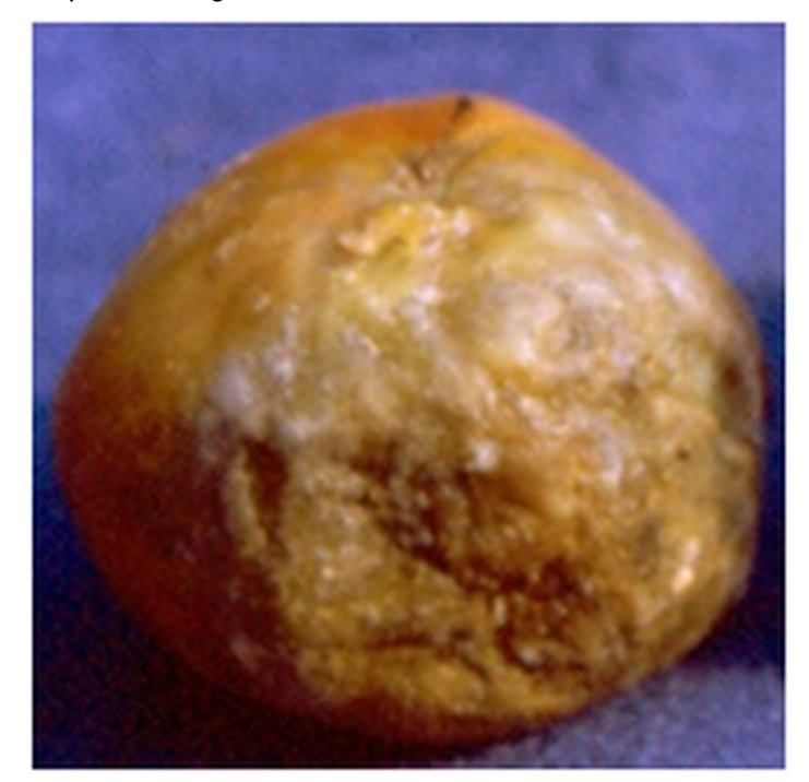
Figure 7. Advanced buckeye rot.

Phytophthora , or buckeye rot , usually causes a circular rot that looks water-soaked, later darkening in the center and/ or becoming overgrown with sparse, white mycelia (Figure 7). The pathogen belongs to a group of microorganisms often referred to as "water molds," because their infectious propagules are dispersed by water. Therefore, buckeye rot often develops on fruit growing near wet spots in a field. Initial symptoms appear as small stains in the fruit surface. On harvested fruit these stains may be overlooked by sorters. However, in storage the small stains enlarge, and the pathogen can move from diseased to adjacent healthy fruit, leading to the term "buckeye nesting" or "snowballs" (Figure 8). Buckeye rot is rare during normal production seasons but is not uncommon during wet periods, particularly if standing water exists in fields.