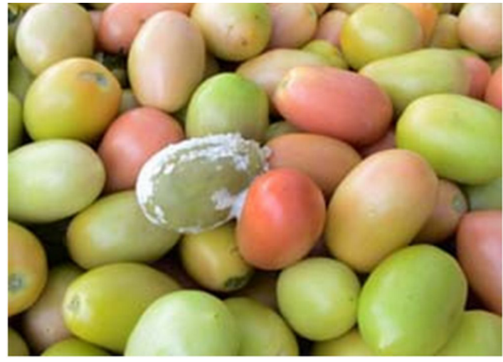
Figure 8. Water mold covering infected fruit (snowball) and spreading to adjacent fruit.

have lost their gel due to a severe internal bruise (Figure 11) are likely to develop internal blackspot. This disease usually does not spread from fruit to fruit in boxes. Green fruit are quite resistant unless exposed to chilling temperatures, blossom-end rot, or damage by certain spray mixtures.