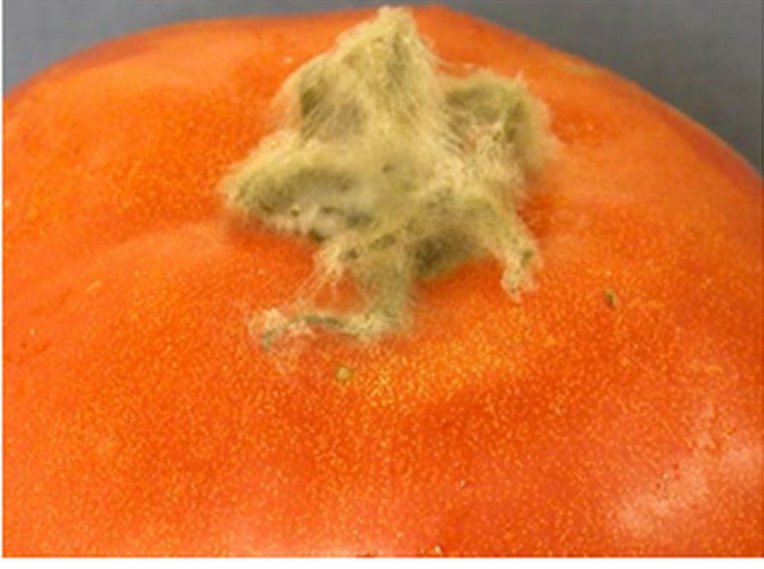
Figure 12. Storage mold covering an attached stem but without evidence of penetration into the fruit.

Storage molds can develop on fruit that have been gassed or stored for prolonged periods of time in humidified rooms. These molds grow over the stem scar, attached stem, blossom scar or other corky areas (Figure 12). They are generally nonpathogenic and do not penetrate into the flesh of the fruit. However, the mold detracts from the appearance of the fruit and may lead to shipment rejection.