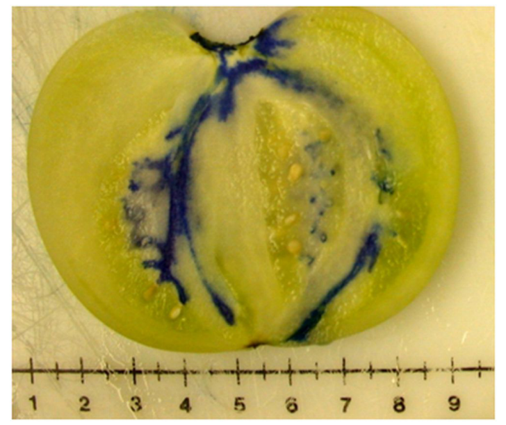
Figure 14. An extreme infiltration of the stem scar and blossom-end scar by a dye solution illustrates that microbes could be internalized under certain conditions.

Microbe infiltration: In contrast to internalization, dry surfaces can be penetrated by water through a process called infiltration. Infiltration occurs when the external pressure of the liquid contacting the fruit surface overcomes the natural hydrophobic resistance of the wax and/or presence of air bubbles in openings in the tomato surface, particularly the stem scar. For example, infiltration occurs when warm tomatoes are submerged in cool water as briefly as 5-10 minutes. As the fruit cools, air inside its tissues contracts, creating a vacuum that draws the surrounding water (and suspended microbes) into openings such as the stem scar or catface at the blossom end (Figure 14). Infiltration can also occur when fruit are struck by a high-pressure stream of water such as when tomatoes are flumed from a gondola or if there is an excessive amount of fruit in a dump tank or flume that causes some fruit to be submerged several layers deep.