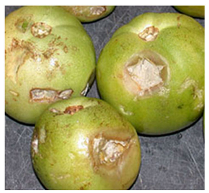
Figure 4. Sour rot lesions covered with pathogen growth.

A second common fungal pathogen is Rhizopus stolonifer , which is in the bread mold group of fungi. This pathogen grows very aggressively . On tomatoes, Rhizopus rot appears