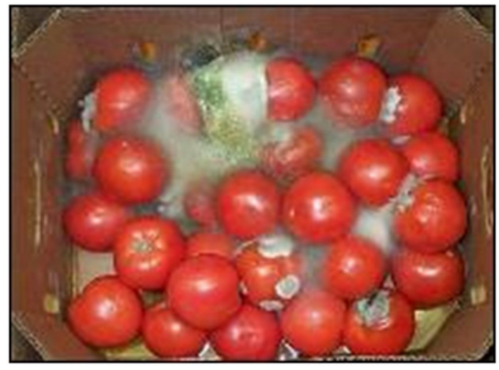
Figure 6. A carton of tomatoes with "nested" Rhizopus rot (and secondary fungi).

Phytophthora , or buckeye rot , usually causes a circular rot that looks water-soaked, later darkening in the center and/ or becoming overgrown with sparse, white mycelia (Figure 7). The pathogen belongs to a group of microorganisms often referred to as "water molds," because their infectious propagules are dispersed by water. Therefore, buckeye rot often develops on fruit growing near wet spots in a field. Initial symptoms appear as small stains in the fruit surface. On harvested fruit these stains may be overlooked by sorters. However, in storage the small stains enlarge, and the pathogen can move from diseased to adjacent healthy fruit, leading to the term "buckeye nesting" or "snowballs" (Figure 8). Buckeye rot is rare during normal production seasons but is not uncommon during wet periods, particularly if standing water exists in fields.