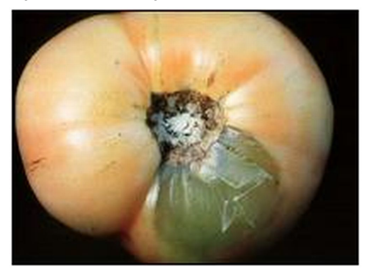
Figure 1. A typical bacteria soft rot lesion.

ubiquitous and have been found in places as diverse as ocean spray off the coast of California, snow in the Rocky Mountains, well water in a few locations, and surface water nearly everywhere. These soft rot strains can grow on the surface of plants and cause a soft rot of succulent plant parts, particularly during wet weather. They can be spread by rainstorms, insects, harvest crews, picking containers, and packinghouse equipment. Fortunately, these bacteria cannot penetrate directly through the waxy skin of a tomato. However, small wounds, even the size of abrasion from sand particles or tiny cuticle cracks, enable the bacteria to infect fruit tissues. Additionally, fruit may internalize the bacteria (see discussion below on internalization). Cells inside the fruit lack a cuticle or other structures that protect the fruit surface from direct pathogen attack. Consequently, soft rot bacteria that are internalized initiate lesions that begin inside the fruit (Figure 2).