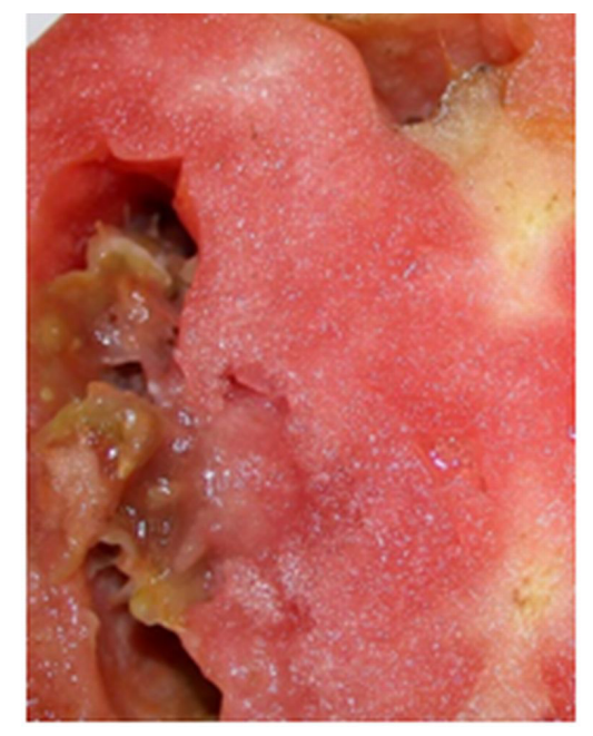
Figure 11. Dry locular cavity due to severe internal bruise.