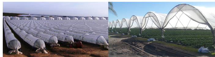
Figure 4. Low (left) and high (right) tunnels for vegetable and small fruit production.

High tunnels are passively ventilated structures built with metal (e.g., galvanized steel or iron), plastic (e.g., polyvinyl chloride [PVC] pipes), or wood, which is usually covered with one or more layers of plastic film and anti-insect screen (Figure 4). Their height is generally between 10 and 16 ft, and they are recommended for indeterminate-growth cultivars, which cannot be grown under low tunnels. Their height also allows for personnel and large agricultural equipment, unlike low tunnels.