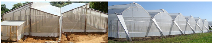
Figure 3. Multi-chapel (left) and semi-cylindrical (right) greenhouse units with passive ventilation on roofs.

This permanent structure has a roof with two tilted surfaces, between 25° and 45°, and is oriented according to wind speed and rainfall. It has either active or passive ventilation through the roof and sides. It's made of wood or steel and ranges in height from 12 to 20 ft (Figure 3). Multi-chapel units are composed of single units attached to each other by rain gutters.