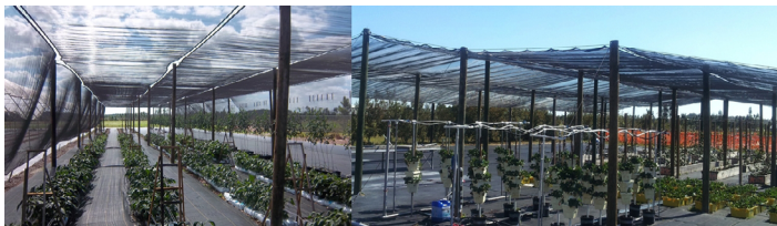
Figure 2. Shade houses for vegetable and small fruit production.

because of the high incidence of physiological disorders and propagation of disease-causing pathogens. Both shade houses and screen houses have very low initial costs (<$0.50/ft 2 ) and maintenance.