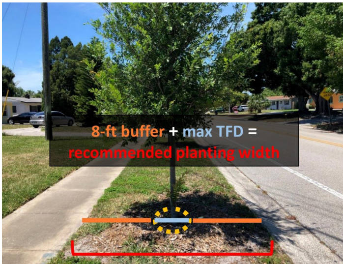
Figure 5. A Chinese elm tree ( Ulmus parvifolia ) in a planting strip between street and sidewalk. Recommended planting strip width is 8 feet of buffer (4 feet on each side) plus the expected trunk flare diameter (TFD). For this Chinese elm, that would be 10 feet total. (Figure not to scale.) Credits: Deborah R. Hilbert, UF/IFAS

For this article, we looked at the maximum diameter at breast height of common urban trees by searching through champion tree registers. This gave us an idea of how large a species' trunk can grow in natural conditions (i.e., the maximum genetic potential of the trees). Then we plugged those DBH values into a series of equations from our abovementioned research (Hilbert et al. 2020) to calculate these species' TFDs. To determine recommended planting space, we added 4 feet of buffer to either side of the trunk flare to account for large supportive roots that (while hidden below the soil surface) could still lift or crack sidewalks (Hauer et al. 2020; Johnson & North 2016; Perry 1992). The figures below help explain this.