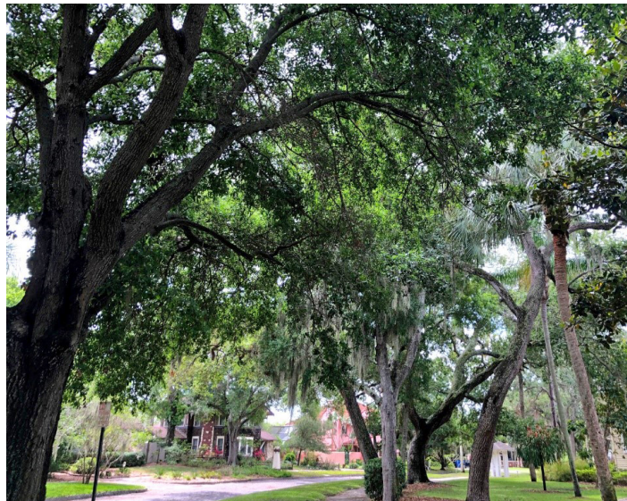
Figure 1. Residential trees like these in Pinellas County provide many benefits.

This fact sheet is intended to help arborists, urban foresters, landscape designers, landscapers, and anyone else responsible for the planting of trees in developed areas make informed decisions regarding the planting width requirements of the trees they select.