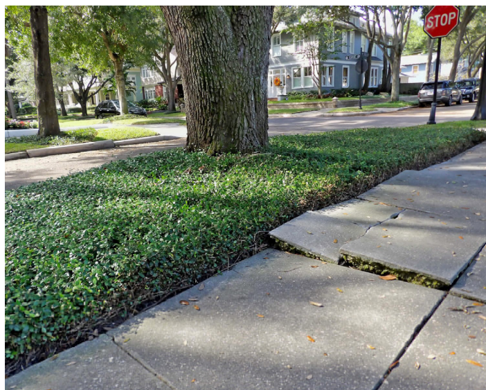
Figure 2. Sidewalk damage caused by a large southern live oak ( Quercus virginiana ).