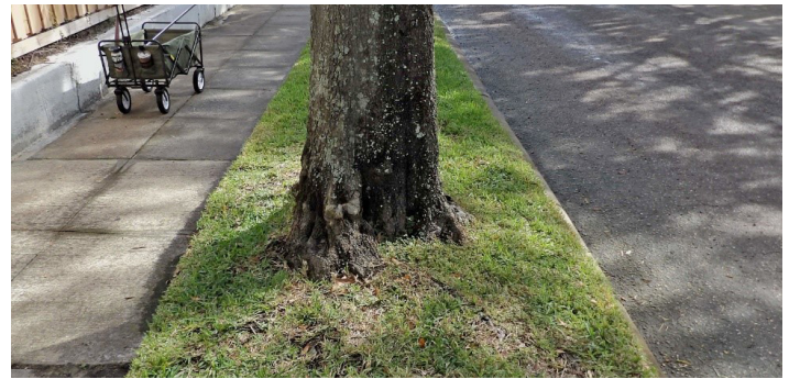
Figure 3. A large laurel oak ( Quercus laurifolia ) planted in a narrow planting strip. The lighter-colored pavement squares on the left were most likely replacements due to tree root damage.