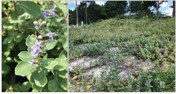
Figure 2. Beach vitex ( Vitex rotundifolia ) is a recent invader to Florida coastal areas. This plant threatens the nesting habitat of sea turtles and ground nesting shore birds. This species was evaluated with the Predictive Tool. It received a score of 21 and is a high risk for invasion.

Each question receives a numerical score between -3 and 5 points (most -1, 0, or 1), and conclusions are made based on the cumulative score. There are three potential outcomes of the Predictive Tool: