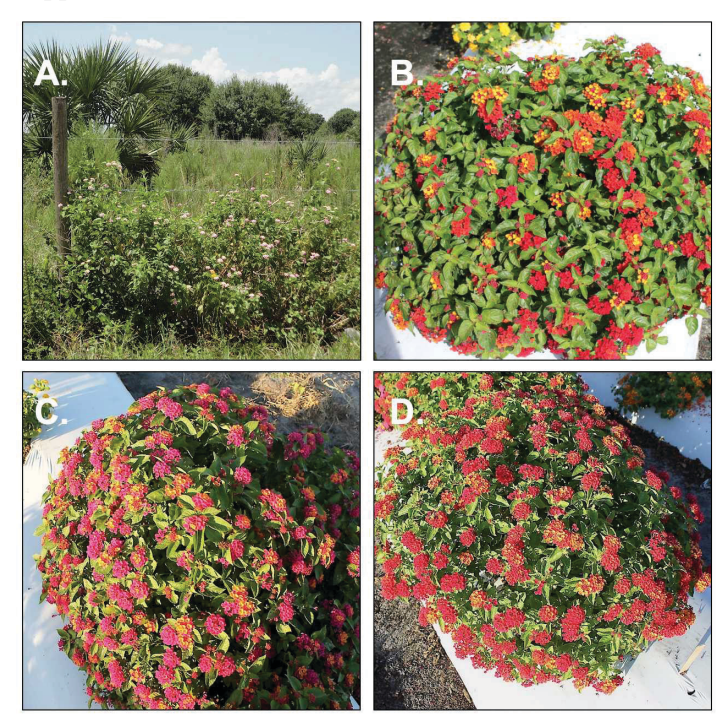
Figure 3. The resident species, Lantana camara (A), and the three cultivars, Luscious Royal Red<sup>™</sup> (UF-1013-1; B), Bloomify Rose<sup>™</sup> (UF-1011-2; C), and Bloomify Red<sup>™</sup> (UF-1013A-2A; D) that were approved by the Invasive Plant Working Group after evaluation using the Infraspecific Taxon Protocol. UF/IFAS approved these three cultivars for recommendation because of their sterility and distinctiveness from the resident species.

3). Even though the ITP is used infrequently, it provides a process to evaluate cultivars that may offer viable alternatives to popular agronomic or horticulture species that also happen to be common invaders.