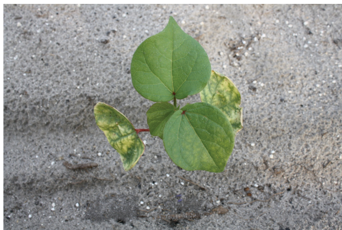
Figure 1. Atrazine injury in cotton from a preemergence application. Note that older leaves have more damage than newer leaves.

*Indicates herbicide labeled for use in cotton.