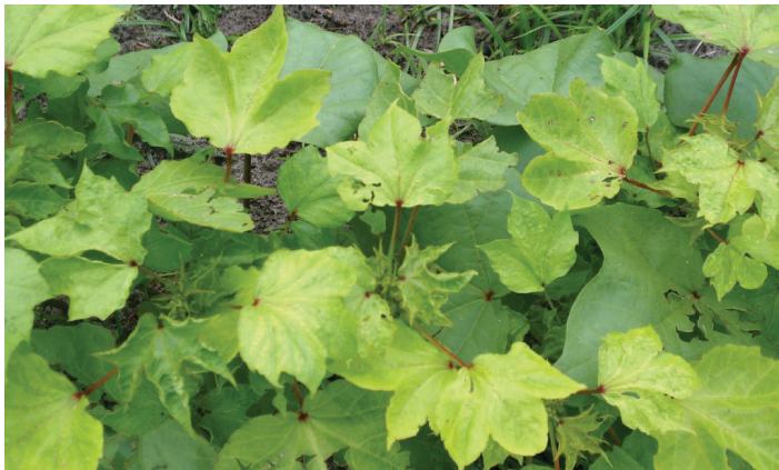
Figure 25. Early glufosinate injury on cotton. Note lime-colored leaves with chlorosis or yellowing.

*Indicates herbicide labeled for use in cotton.