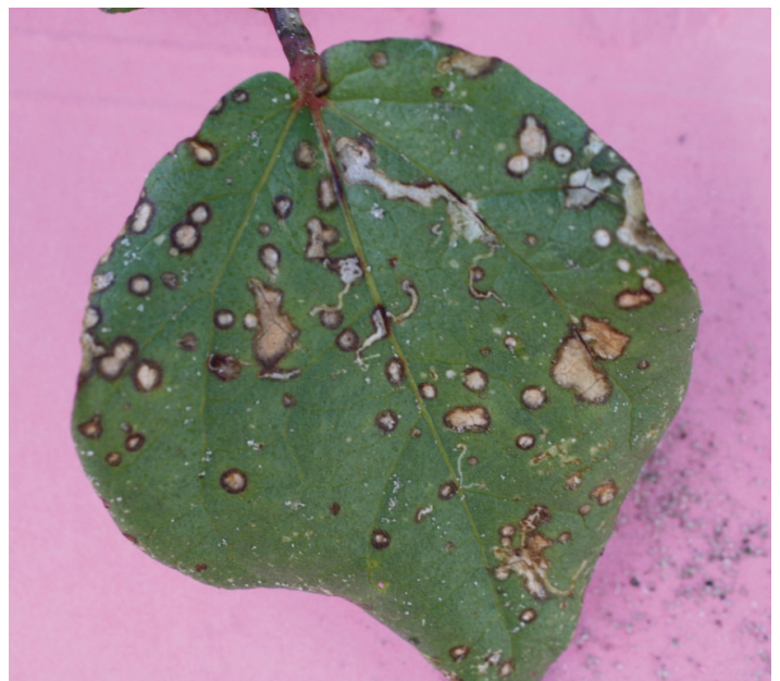
Figure 18. Flumioxazin damage from a postemergence application. Note red halos around lesions.