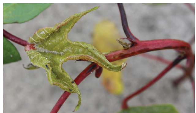
Figure 10. Injury from a 2,4-D postemergence application. Note the malformed leaf and twisted stem.