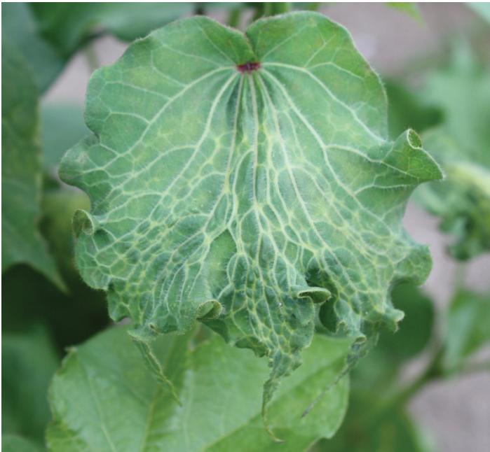
Figure 12. Dicamba injury from a postemergence application.