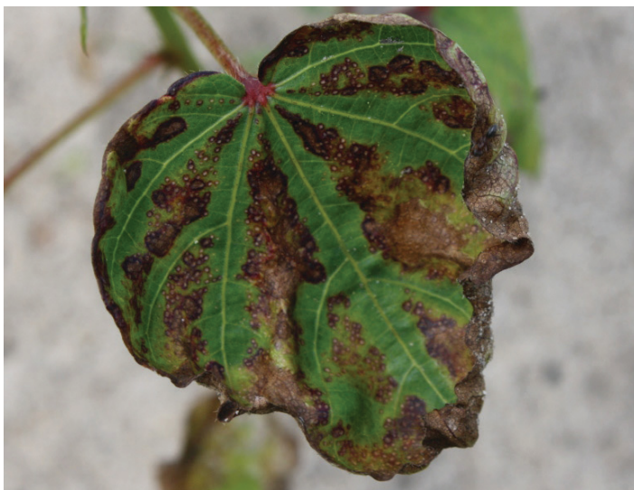
Figure 26. Necrosis (tissue death) following glufosinate application.