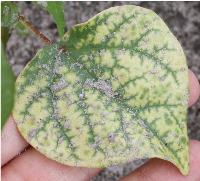
Figure 2. Severe atrazine injury from a preemergence application. Tissue death (or necrosis) will soon develop at leaf margins.