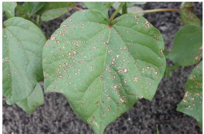
Figure 30. COC injury following an application in hot and humid conditions. Speckled leaf burning can occur after COC is applied.