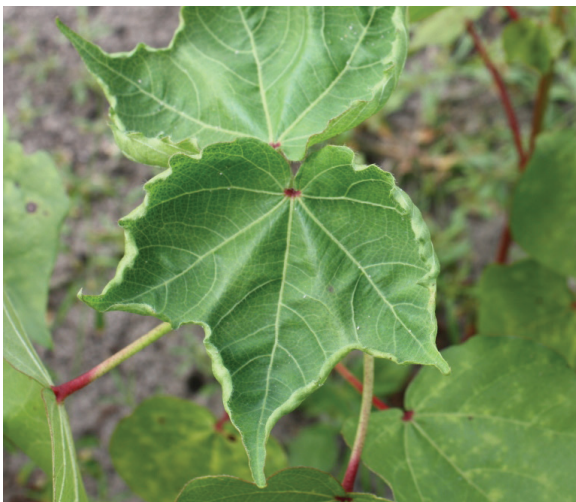
Figure 13. Quinclorac injury from a postemergence application. Note leaf curling and cupping.