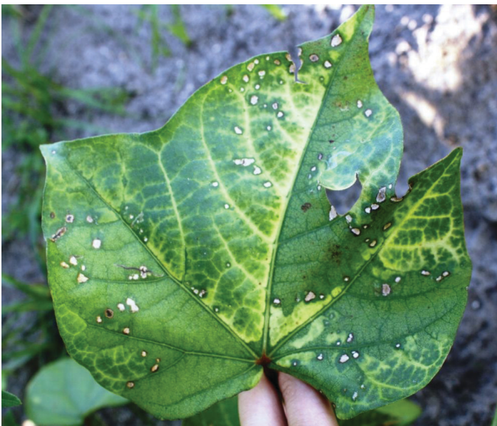
Figure 3. Injury from bentazon applied postemergence. Note the uneven pattern of injury due to bentazon not moving within the plant.