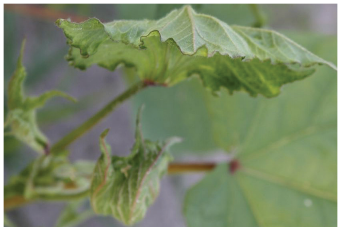
Figure 9. Twisting and cupping following a 2,4-D postemergence application.

Herbicides with This Mode of Action: 2,4-D, dicamba, picloram, triclopyr, aminopyralid, quinclorac (Drive)