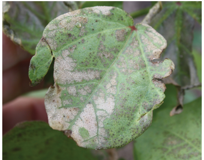
Figure 4. Advanced injury from bentazon applied postemergence. Note the necrosis or its paper bag-like appearance.

Mechanism of Action: The ALS-inhibiting herbicides block the acetolactate synthase (ALS) enzyme. The ALS enzyme is responsible for the formation of essential amino acids (isoleucine, leucine, and valine) in the plant. Without these amino acids, proteins (complex molecules that control all plant functions) cannot be formed and the plant slowly dies.