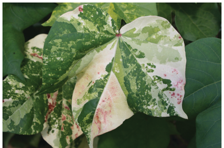
Figure 6. Injury caused by diuron applied preemergence.