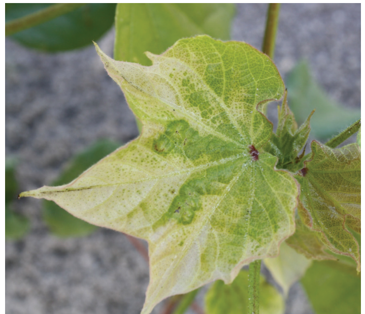
Figure 14. Tembotrione injury from a postemergence application. Note bleaching concentrated at leaf margins.

*Indicates herbicide labeled for use in cotton.