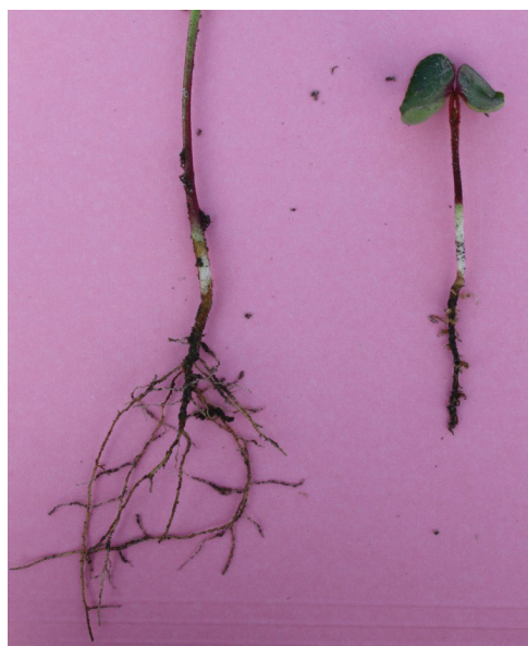
Figure 21. A healthy plant (left) compared to a plant with pendimethalin injury (right). Note the short, club-like roots and overall stunted growth.

*Indicates herbicide labeled for use in cotton.