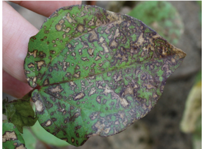
Figure 17. Lactofen injury from a postemergence application. Note speckling and slight bronzing.

*Indicates herbicide labeled for use in cotton.