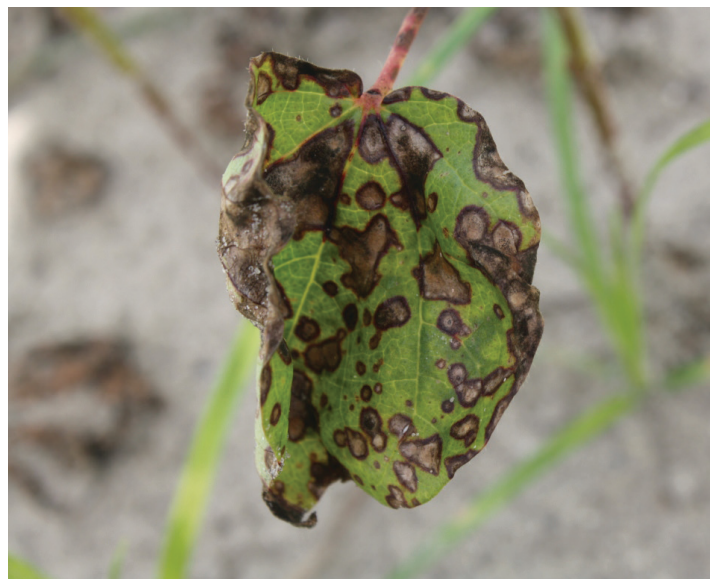
Figure 29. Paraquat injury from a postemergence application. Lesions followed by tissue death are common after paraquat applications.