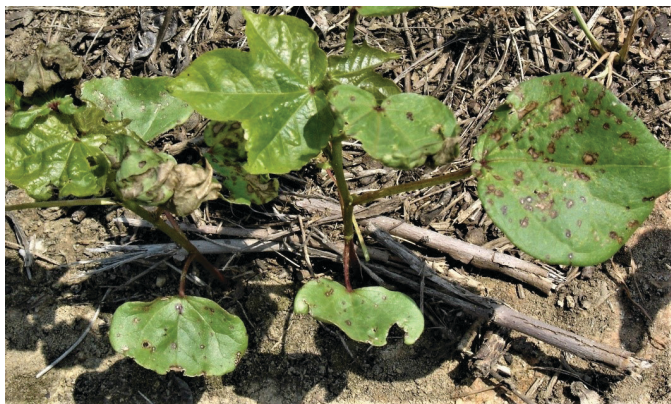
Figure 24. Injury from Roundup + Warrant on Flex Cotton.