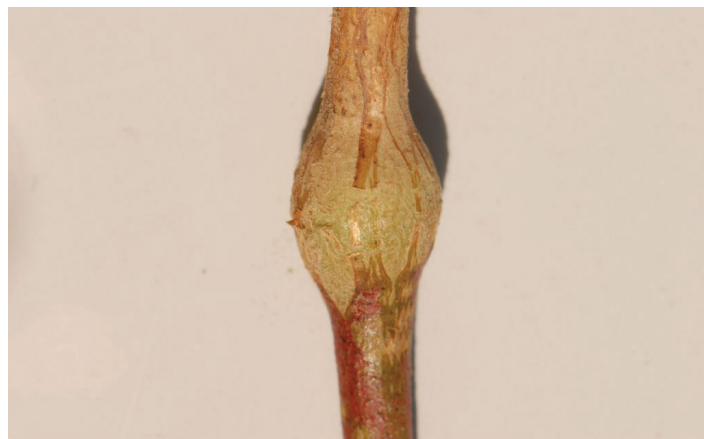
Figure 22. Swelling at the stem of a cotton plant from exposure to preemergence pendimethalin.