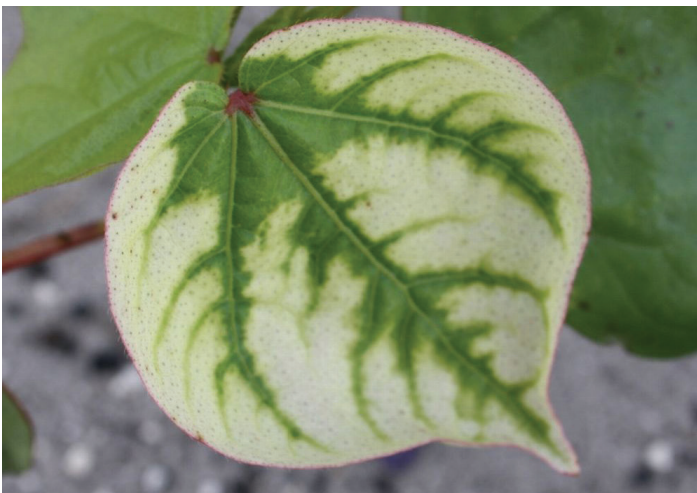
Figure 16. Clomazone injury from preemergence application. Note bleaching at leaf margins.