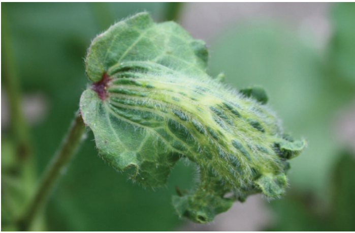
Figure 11. Dicamba injury from a postemergence application. Note the malformed veins and leaf strapping.