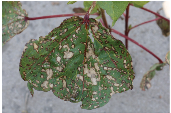
Figure 28. MSMA postemergence injury on cotton. Burning and lesions pictured are typical of MSMA injury.

Symptoms: Crop oils have a tendency to injure cotton when applied in hot and humid conditions. Injury symptoms include leaf burning and spots of necrosis similar to those of the cell membrane disruptors, but without the bronzing.