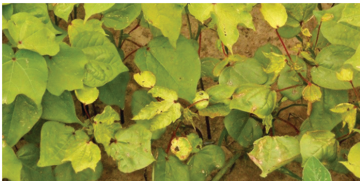
Figure 7. Accent injury from a postemergence application. Note the lime color of injured leaves.

*Indicates herbicide labeled for use in cotton.