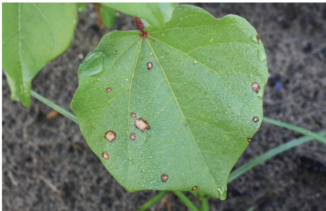
Figure 23. Injury from metolachlor applied postemergence. Note the lesions or burning on the leaf.

*Indicates herbicide labeled for use in cotton.