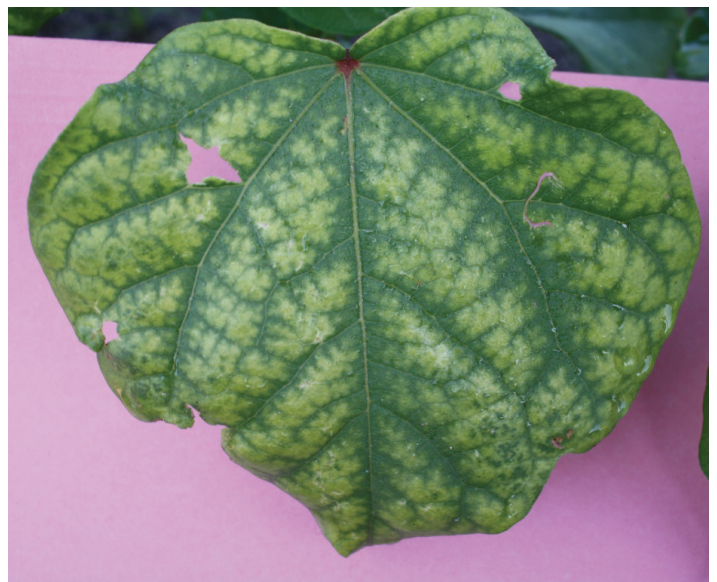
Figure 5. Injury from fluometuron applied preemergence.