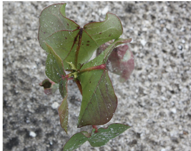
Figure 27. Glyphosate injury on a glyphosate-susceptible cultivar. Note the red veins that are similar to ALS injury symptoms.

*Indicates herbicide labeled for use in cotton.