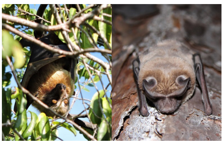
Figure 2. Bats make valuable contributions to natural ecosystems and people. Some, such as the Sulawesi flying fox ( Acerodon celebensis , left), pollinate plants, producing many of the fruits we eat. Others, such as the Florida bonneted bat ( Eumops floridanus , right), eat insects we consider pests.

Represented by more than 1,400 species, bats are one of the most diverse groups of mammals on the planet. Bats eat a variety of types of food, and in the process, they provide many ecological services to humans (Figure 2). Exterminating bats would result in ramifications harmful to people from an economic and health perspective.