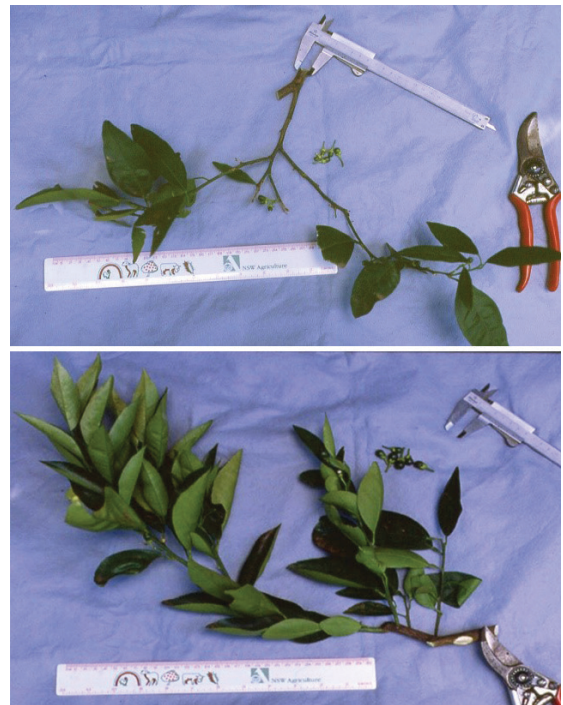
Figure 11. Top: Weak bearing branch units (WBBU) arising from the underside of a branch from a ‘Bellamy’ navel orange tree. These should be removed by cuts made to the undersides of their supporting branches. The supporting branch is indicated by the jaws of the Vernier caliper. Bottom: An example of strong bearing branch units (SBBU) arising from the top of the supporting branch in ‘Bellamy’ navel orange. Note the relatively large fruitlet diameter compared with those from WBBU in Figure 11, top. The supporting branch, trimmed for clarity, is indicated by the pruning shear blades.

operations transform and maintain favorable tree structure and productivity and lay the foundation for sustained heavy crops of high-quality fruit. Practical experiences suggest pruners should spend no more than 5 to 6 minutes per tree, per year, and that repeated light and selective pruning significantly improves tree productivity.