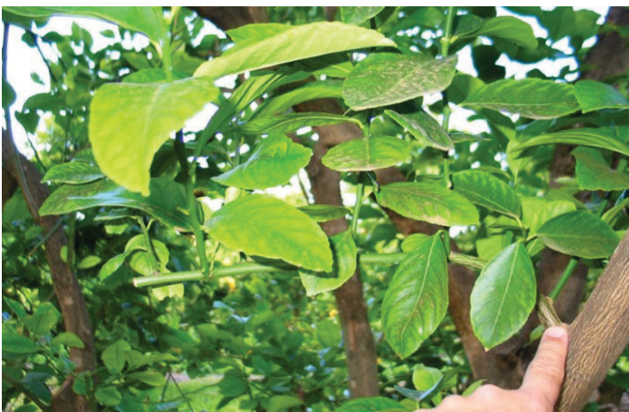
Figure 13. The bent watershoot may later be shortened with secateurs (usually in early fall) to leave behind a strong, short branch, bearing well-spaced lateral shoots that mature to form SBBU, which usually produce large, high-quality, easily harvested fruit.

General considerations: Canopy management is one of a number of cultural practices forming the basis of best management practices in groves; fertigation, pest and disease management, fruit size management or thinning, grove sanitation, and harvest are others. Citrus growers are best able to assess the performance of their trees and to plan and implement their canopy management activities accordingly. Consider the following: