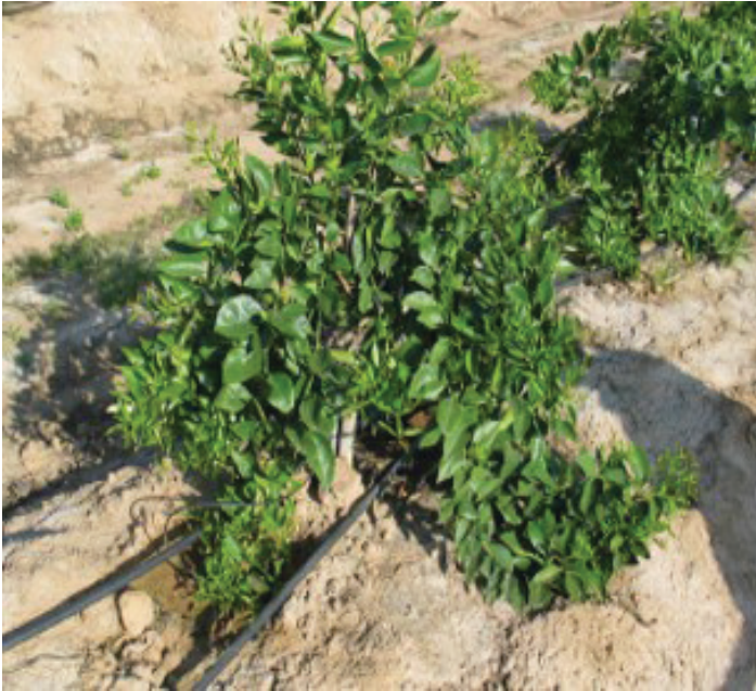
Figure 7. Trees should be skirted at a suitable height above ground level (for example, 45 cm above soil level) to keep foliage and fruit off the ground and above the level of soil “splash,” and to facilitate under-tree operations such as fertigation, grove sanitation, and weed management.

a convenient side-branch to redirect the growth. A skirting height of 45 to 65 cm (18 to 26 inches) is suggested, carried out to keep branches and fruit clear of the soil, perhaps every second year.