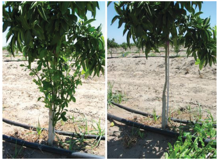
Figure 1. Removal of sucker shoots from rootstock, bud union, and tree trunk, before (left) and after (right). These suckers compete with the tree canopy above for water and nutrients. Remove these as soon as they arise in both nonbearing and bearing trees through the life of the grove.

Decide on the standard height above soil level of the lowest limb that will be allowed to develop on the trees. This is usually 45 to 65 cm (ca. 18 to 26 inches) above soil level. Keep the rootstock, bud union, and trunk clear of all growth below this point by carefully rubbing off new shoots by hand or using pruning shears (secateurs) to cut older branches (Figure 1). Failure to do so usually results in dominant, out-of-place branches (Figure 2) that shade more favorably placed branches and compete with them for sap flow and nutrients, or branches so low that they or their fruit touch the soil surface.