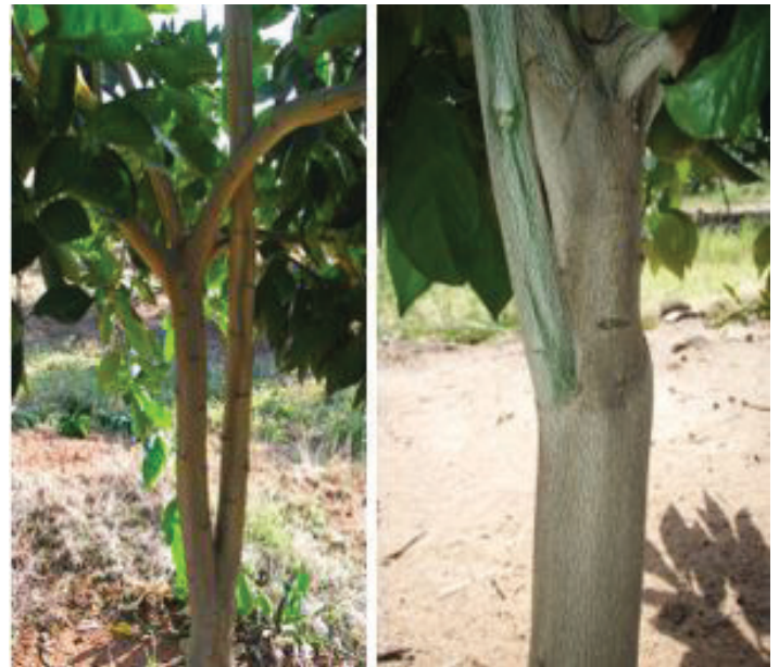
Figure 2. Poorly positioned main branches arising at the bud union and below the level of the tree's main branches allowed to develop on a low-budded tree (left) and high-budded tree (right). Both cases result in mechanically weak branches that are prone to breakage when laden or during storms. They also shade, dominate, and compete with well-placed branches in the canopy and should already have been removed long before they reached this size.