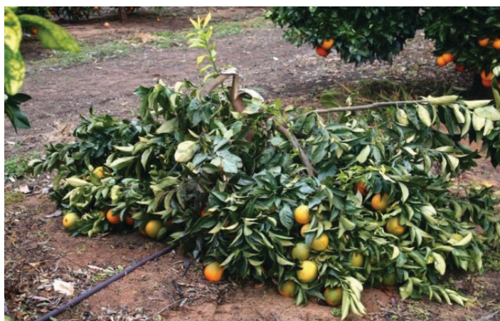
Figure 3. Branch breakage under fruit load: the result of leaving young trees untrained, leading to poor scaffold branch placement and mechanically weak trees.

infestations can weaken branches, and already stressed branches may be more susceptible to heavy infestations.