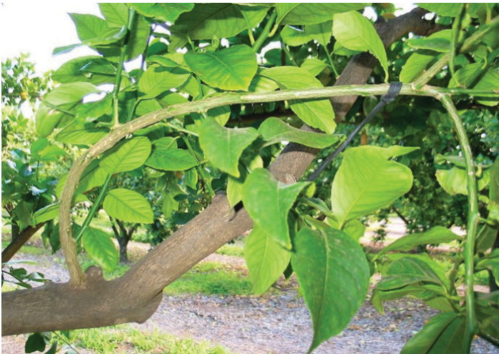
Figure 12. Bending a vigorous watershoot to induce lateral branching. A previously upright, vigorous lemon branch has been drawn down with a degradable natural rubber tree-training band, which within months weathers and breaks down in place, does not damage the branch it encircles, and leaves the branch permanently bent over.

leaving in place a new, strong scaffold branch that bears large fruit (Figure 13).