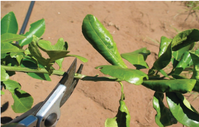
Figure 8. Shortening a long horizontal branch by cutting below the junction or intercalation between successive growth flushes, here located a centimeter or so to the right of the blades. This results in spaced lateral regrowth shoots on a shorter branch that does not touch the ground.