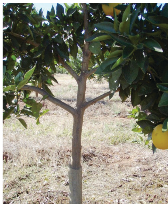
Figure 5. Aim to maintain tree structural “balance,” comprising those well-spaced, mechanically strong, correctly oriented scaffold branches that were chosen when nonbearing trees were trained. This permanent structure, or something similar, is the foundation for a productive lifespan of the grove.