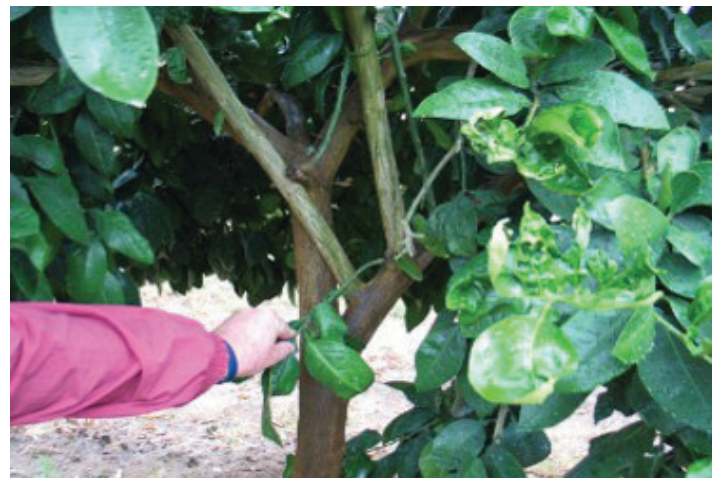
Figure 9. Two poorly positioned branches with green bark being pointed out. The one on the left is growing back toward the center of the tree and rubbing against other, better-positioned scaffold branches in the canopy above. The right-hand branch is growing up the center of the canopy and is shading and dominating the canopy beneath. It is the tallest branch on the tree shown. Both of these branches are also excessively vigorous. Both should be removed by cutting at their bases to intersect the so-called “branch collar.” This speeds wound healing.