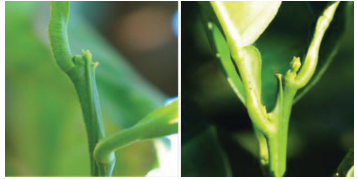
Figure 6. Ideal stage for pruning of bearing citrus trees: at or just after budbreak. This is not always possible in late-harvested varieties and where late freezes may be expected. The rule is: Prune as soon after harvest as possible.

2. Tree containment: Keep canopies within their allocated space by reducing tree height and spread and by skirting. Height reduction is particularly important in CUPS, where tree canopies should never contact the screen house roof. This is to protect the roof, and because pest management on branches close to the roof becomes more difficult. These practices are usually done annually, as soon after harvest as possible, and make it easier for pruners to access tree canopies and concentrate on optimizing tree canopy form and function by using selective pruning.