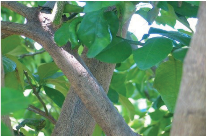
Figure 10. A poorly positioned branch “crossing over” or growing back into the canopy and over the center of the tree instead of radiating outwards. Such branches must be removed by cutting at the branch collar at their base.