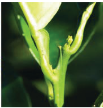
Figure 6. Ideal stage for pruning of bearing citrus trees: at or just after budbreak. This is not always possible in late-harvested varieties and where late freezes may be expected. The rule is: Prune as soon after harvest as possible.