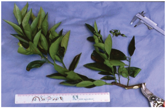
Figure 11. Top : Weak bearing branch units (WBBU) arising from the underside of a branch from a 'Bellamy' navel orange tree. These should be removed by cuts made to the undersides of their supporting branches. The supporting branch is indicated by the jaws of the Vernier caliper. Bottom : An example of strong bearing branch units (SBBU) arising from the top of the supporting branch in 'Bellamy' navel orange. Note the relatively large fruitlet diameter compared with those from WBBU in Figure 11, top. The supporting branch, trimmed for clarity, is indicated by the pruning shear blades.

4. Management of vegetative regrowth: Healthy trees respond by producing localized regrowth close to where cuts were made and general regrowth throughout well-lit parts of the canopy. Both should be managed some 4 to 5 months after pruning (i.e., in late summer/early fall) to maintain good canopy illumination and effective spray coverage, optimize bearing potential of regrowth, and improve fruit quality. Regrowth should be spaced out by hand-thinning to leave new shoots 10 to 15 cm (4 to 6 inches) apart. Well-placed but excessively vigorous watershoots may be bent and secured toward the horizontal to greatly slow their extension growth, stimulate lateral shoot growth, and make the new branch fruitful (Figure 12). Once "set" in its new orientation, a bent shoot can later be shortened to a convenient side-branch,