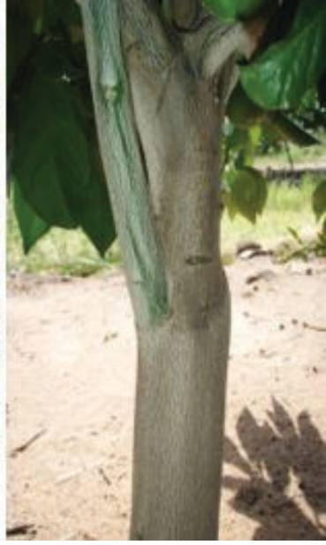
Figure 2. Poorly positioned main branches arising at the bud union and below the level of the tree's main branches allowed to develop on a low-budded tree (left) and high-budded tree (right). Both cases result in mechanically weak branches that are prone to breakage when laden or during storms. They also shade, dominate, and compete with well-placed branches in the canopy and should already have been removed long before they reached this size.

• Remove dead or diseased branches at once. Also remove any broken branches. This can sometimes be a drastic operation where trees were left to form their own branch structure and in cultivars with inherently brittle wood (Figure 3). It may be easier and more effective to remove branches heavily infested with scale insects. Heavy