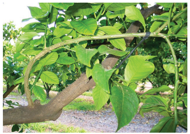
Figure 12. Bending a vigorous watershoot to induce lateral branching. A previously upright, vigorous lemon branch has been drawn down with a degradable natural rubber tree-training band, which within months weathers and breaks down in place, does not damage the branch it encircles, and leaves the branch permanently bent over.

leaving in place a new, strong scaffold branch that bears large fruit (Figure 13).