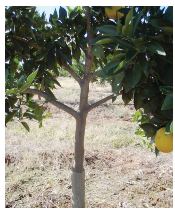
Figure 5. Aim to maintain tree structural "balance," comprising those well-spaced, mechanically strong, correctly oriented scaffold branches that were chosen when nonbearing trees were trained. This permanent structure, or something similar, is the foundation for a productive lifespan of the grove.