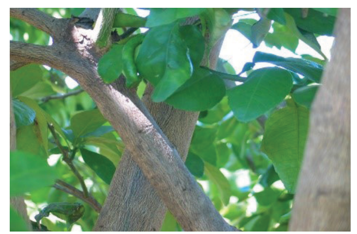
Figure 10. A poorly positioned branch "crossing over" or growing back into the canopy and over the center of the tree instead of radiating outwards. Such branches must be removed by cutting at the branch collar at their base.