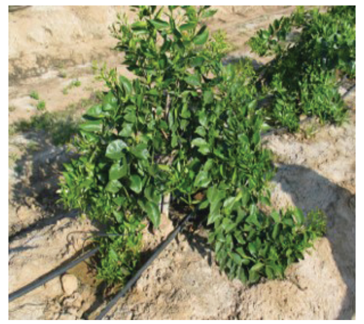
Figure 7. Trees should be skirted at a suitable height above ground level (for example, 45 cm above soil level) to keep foliage and fruit off the ground and above the level of soil "splash," and to facilitate under-tree operations such as fertigation, grove sanitation, and weed management.

a convenient side-branch to redirect the growth. A skirting height of 45 to 65 cm (18 to 26 inches) is suggested, carried out to keep branches and fruit clear of the soil, perhaps every second year.