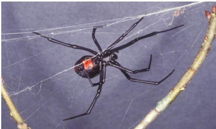
Figure 1. Adult female Southern black widow, Latrodectus mactans (Fabricius).

The Southern black widow spider, Latrodectus mactans (Fabricius), is a venomous spider found throughout the southeastern United States. Widow spiders received their name from the belief that they would kill and consume their mate following copulation. However, the practice was mainly observed in laboratory settings under crowded conditions. It is believed that sexual cannibalism within the widow species in natural settings is more associated with the male's physical inability to escape rather than the female's interest in consuming him (Breene and Sweet 1985).