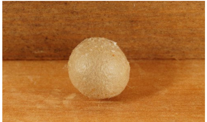
Figure 6. Egg sac of a Southern black widow, Latrodectus mactans

The female Southern black widow, as described by Mote and Gray (1935), is a shiny black spider with a distinctive red hourglass on the abdomen. The Southern black widow has a complete hourglass, while the Western species' hourglass can vary from two connected triangles to separated triangles to a minimum of barely visible red blotches. The Northern widow typically has the hourglass on their abdomen but some individuals lack it completely (Kaston 1954). Females are typically 3.75 to 5 cm long including the leg span, while their bodies are 1.25 cm long. Male Southern black widows are smaller, typically with a 0.6 cm long body (Mote and Gray 1935). Male Southern black widows lack the characteristic hourglass of the female, but may have red spotting on the top or underside of the abdominal segment.