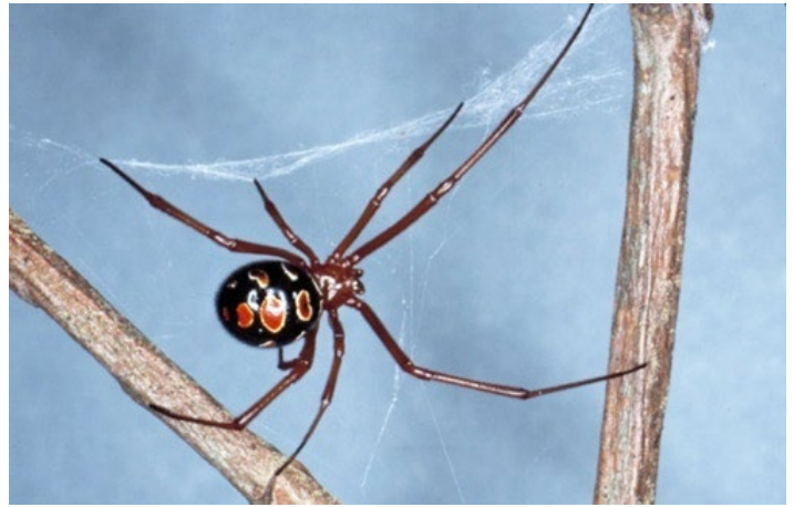
Figure 3. Dorsal view of adult red widow spider, Latrodectus bishopi (Kaston).