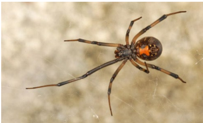
Figure 2. Adult female brown widow spider, Latrodectus geometricus (C.L. Koch).

Latrodectus variolus Walckenaer: Northern black widow