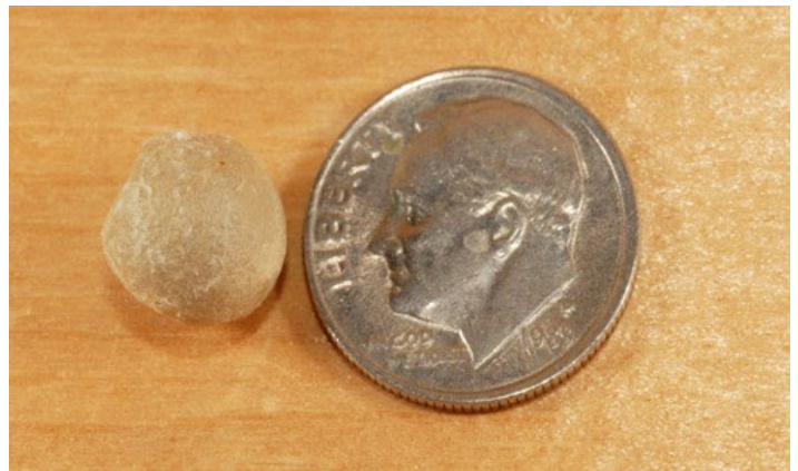
Figure 7. Egg sac of a Southern black widow, Latrodectus mactans (Fabricius). Southern black widow egg sacs are typically 1.0-1.25 cm across; the photo demonstrates the size in comparison to a dime.