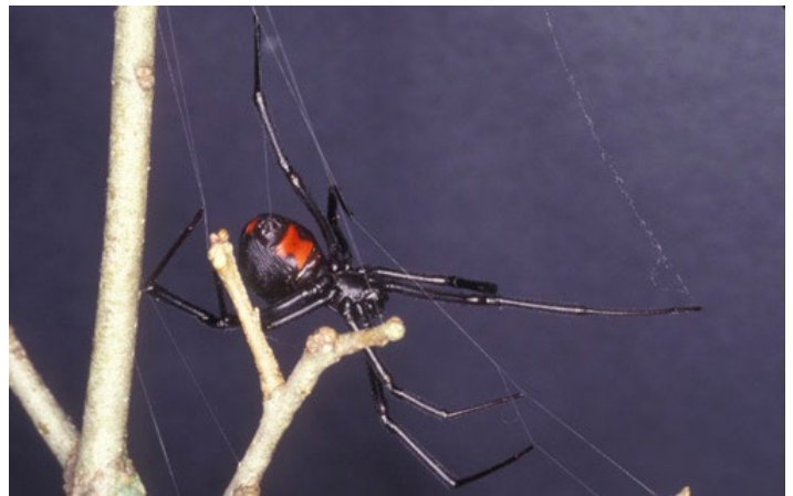
Figure 10. Adult female Southern black widow, Latrodectus mactans (Fabricius).