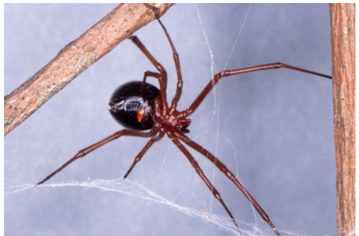
Figure 4. Ventral view of adult red widow spider, Latrodectus bishopi (Kaston).