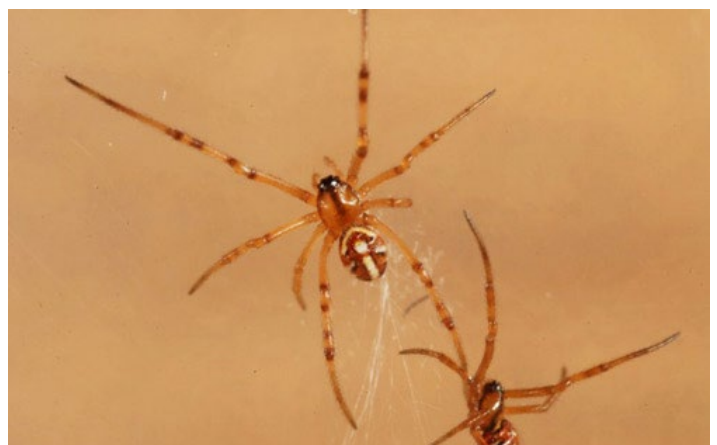
Figure 8. Dorsal view of Southern black widow spiderlings, Latrodectus mactans (Fabricius).