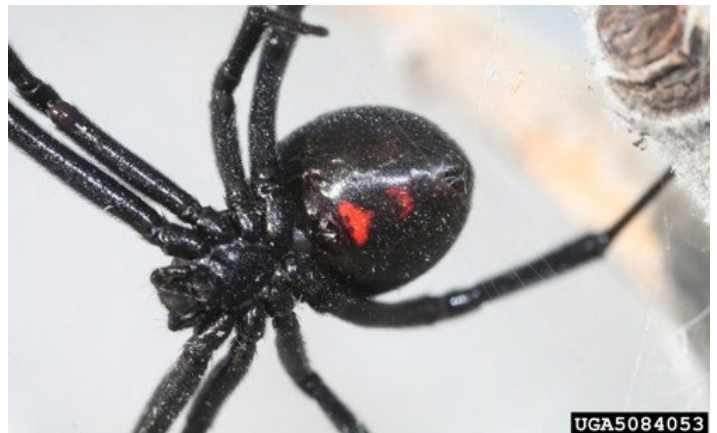
Figure 5. Adult female Western black widow, Latrodectus hesperus (Chamberlain and Ivie).