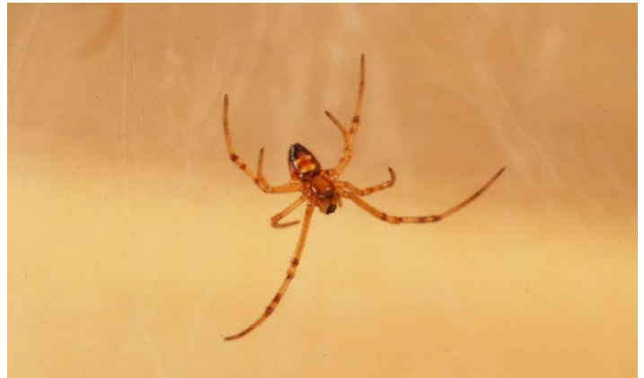
Figure 9. Ventral view of Southern black widow spiderlings, Latrodectus mactans (Fabricius).

Southern black widows are normally predators, but under special circumstances they can serve as prey. Wasps ,