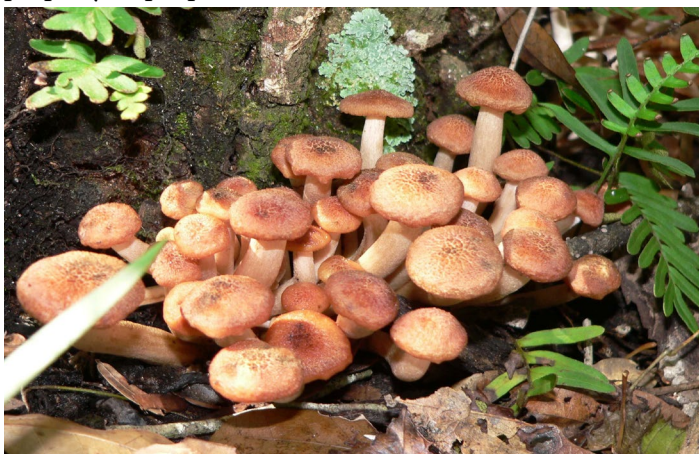
Figure 3. Young developing mushrooms of Armillaria tabescens .

During high winds, trees infected with Armillaria may break from the weakened base and cause damage or injury. Large trees infected with Armillaria are considered hazard trees and should be removed when near targets, such as property or people.