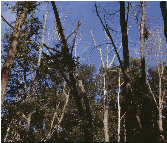
Figure 2. Oak stand exhibiting pocket mortality typical of Armillaria root rot.