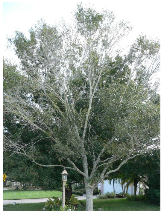
Figure 1. Thinning foliage of a laurel oak ( Quercus hemisphaerica ) infected with Armillaria tabescens .

Armillaria spp. cause root and butt rot of trees and shrubs worldwide, from tropical to boreal regions (Sinclair and Lyon 2005). Armillaria spp. have a wide host range, including many hardwoods and conifers. The fungus infects the roots and bases of trees, causing them to decay, weaken, or die. Some species of Armillaria are primary pathogens, capable of attacking and killing trees, but others are opportunistic pathogens that kill only unhealthy or stressed trees. In some western conifer forests, Armillaria is considered a major forest pathogen, and silvicultural practices must be tailored to prevent major tree loss (Hagle 2008). In Florida, Armillaria tabescens is the most common pathogenic species (Sinclair and Lyon 2005) and is primarily an opportunistic pathogen, but it may kill seemingly healthy trees and shrubs in both urban and natural areas, particularly when host species are stressed.