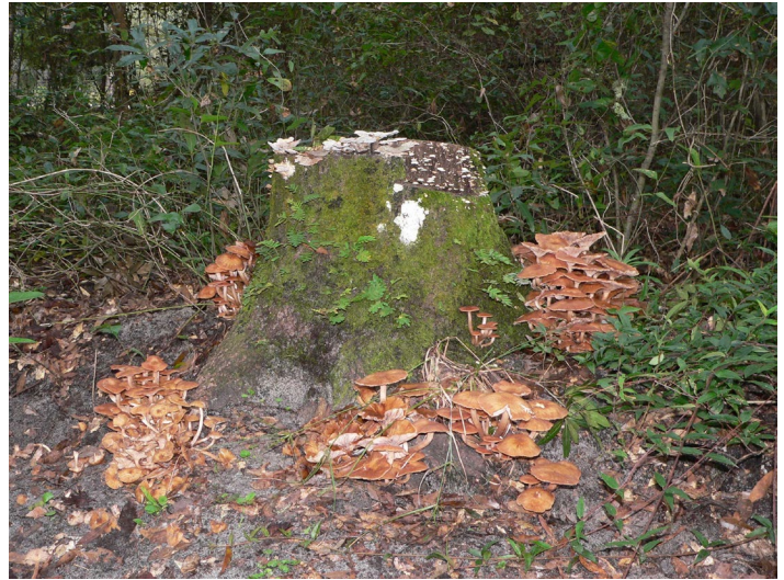
Figure 8. Armillaria tabescens fruiting near a stump of a previously killed laurel oak.