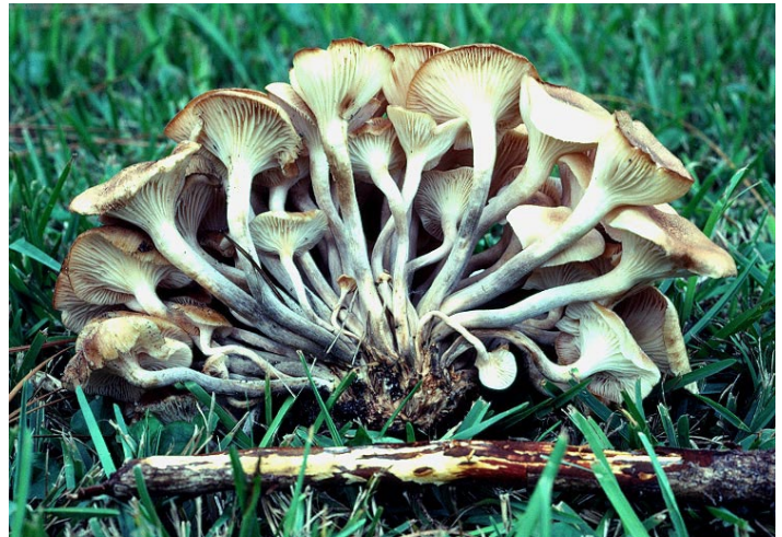
Figure 4. Mature mushrooms of Armillaria tabescens and root of an oak infected with the pathogen.