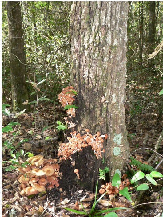
Figure 7. Mushrooms of Armillaria tabescens at the base of an infected mockernut hickory ( Carya tomentosa ).

Armillaria rhizomorphs are also vegetative parts of the fungus. They are thick mycelial growths that transport nutrients and increase the fungus's size. Rhizomorphs look like long, black shoestrings, giving Armillaria root rot the nickname "shoestring root rot." They are frequently overlooked because they blend in with the tree's existing root system. This is especially true with trees that tend to have many aerial and surface roots, such as those in the Ficus species. However, rhizomorphs are frequently absent in Florida.