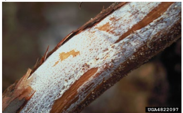
Figure 5. White mycelial fan under the bark of a root infected with Armillaria tabescens .

Armillaria root rot can be easily recognized by a few distinct signs. Clusters of short-lived yellowish to honey-brown mushrooms (Figures 3 and 4) are the reproductive structures of the fungus and are usually observed when there are cool, moist conditions during the fall and winter, or occasionally in late spring. The mushrooms often occur at the base of an infected tree (Figure 5) or on and near stumps of previously killed trees (Figure 6), but they may also grow from the underground roots of an infected tree away from the main stem. White fans of mycelia (the vegetative form of the fungus) (Figure 7) can be observed under the bark of stems and roots of infected trees. The purpose of the mycelia is to absorb nutrients and decompose dead vegetative matter. The mycelia of most Armillaria species is bioluminescent (it glows in the dark); however, that is not the case for Armillaria tabescens , the most common species in Florida. Armillaria can also be identified by dark, string-like, underground mycelial growths known as rhizomorphs (Figure 8), which originate at the infected root system.