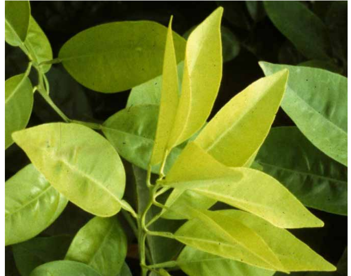
Figure 3. These leaves have sulfur deficiency symptoms because they show chlorosis (pale green to yellow in color) similar to N deficiency. S deficiency symptoms appear on new growth because S does not move readily from old to young leaves like N.

Because S is associated with forming proteins and chlorophyll, deficiency symptoms resemble those of N deficiency, but the symptoms first appear on new growth (Figure 3). Such chlorosis in citrus is worse on new growth because S does not move readily from old to young leaves like N. Plants are stunted and pale green to yellow in color. Visual diagnosis of S deficiency is not easy to identify in citrus production. Accurate diagnosis should involve tissue analysis.