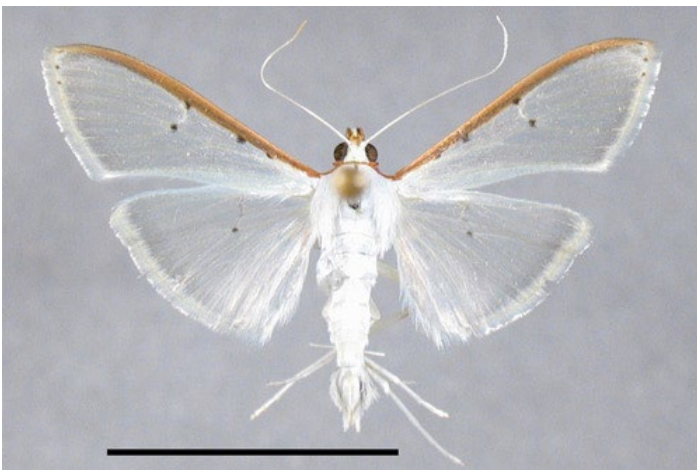
Figure 1. Palpita persimilis , adult habitus. Scale = 1 cm.

The initial detection in Florida was an infestation of ornamental privet trees in Sumter County in July 2012. The homeowner indicated that other infestations were