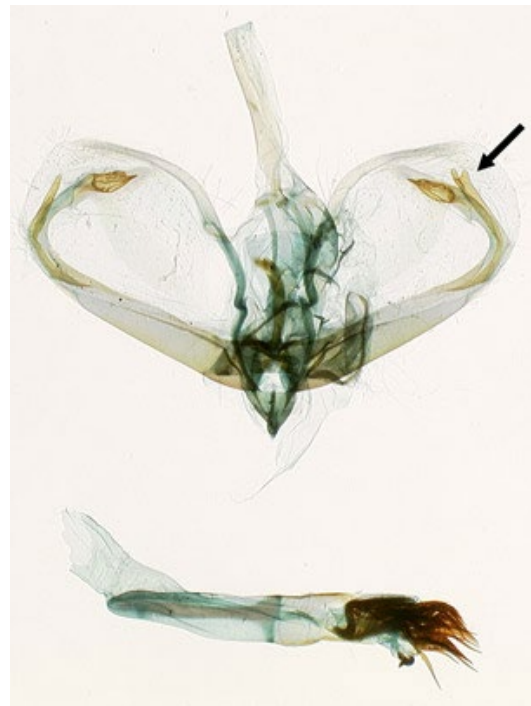
Figure 4. Male genitalia. Elongate processes of right valve indicated.

Larva: Characters used to diagnose larvae of Palpita persimilis from other Palpita species are not yet known. Live larvae are green with a pale yellow head and grow