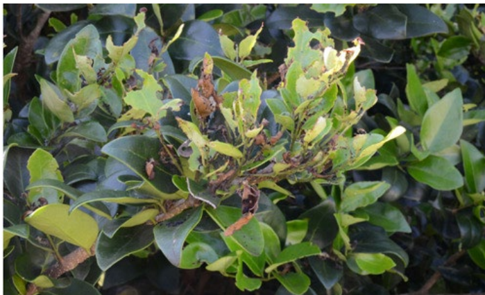
Figure 10. Defoliation of new growth.

Wille (1952) and Chiaradia and Da Croce (2008) describe larval behavior in South America. The number of days until egg hatch depends on temperature, ranging from 8 to 15 days. Early instar larvae consume buds and tender leaves, and later instars may eat older, harder leaves. They roll leaves into nests, stripping the surface or skeletonizing, and the buds and leaves dry up. They eat the olive fruits only rarely, and damage to flowers is not reported. The larval stage lasts 30 to 45 days. Pupation usually occurs in crevices in the bark and lasts 10 to 20 days. Total generation time is 50 days in spring to 65-80 days in winter. There may be five or six generations per year. Adults are active by day as well as night, but they are reclusive and hide under leaves of the host. Elevated temperatures (especially warm winters) and high precipitation and humidity favor population growth (Wille 1952; Chiaradia and Da Croce 2008). Observations of the species in Florida agree with the above. Larvae of all stages prefer young leaves and new growth, but not flowers. They feed primarily on the epidermis (Fig. 8), but older larvae can eat holes in larger leaves. They construct shapeless, frass-laden nests of leaves tied together with silk