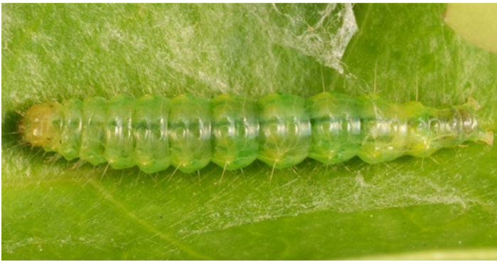
Figure 6. Live larva, about 2 cm long.