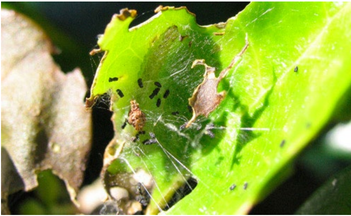
Figure 9. Leaves tied together with larva inside.