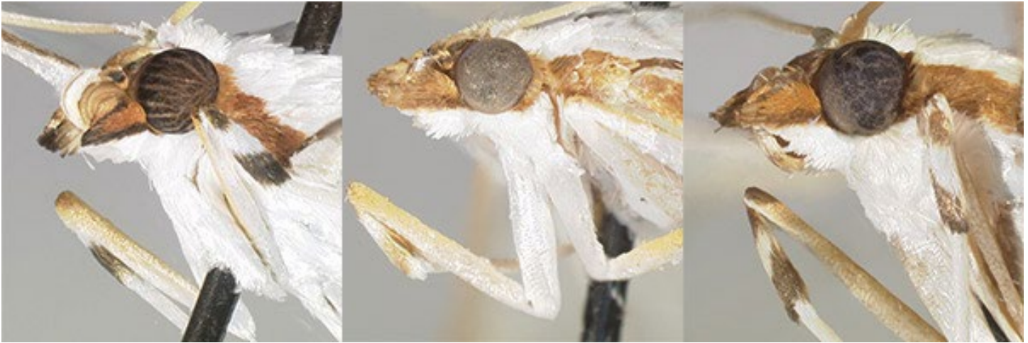
Figure 3. Labial palpi and foreleg tibia: A. Palpita persimilis ; B. Palpita kimballi ; C. Palpita quadristigmalis .