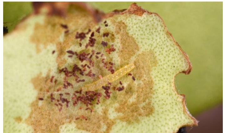
Figure 11. Young larva, about 2 mm long.

Control measures are difficult because of the habit of concealed feeding. Several natural enemies have been tested with varying success (Chiaradia and Da Croce 2008). Trimming foliage to remove eggs and nests, if applied, should be done thoroughly, because any surviving larvae will prefer to consume the resulting new growth.