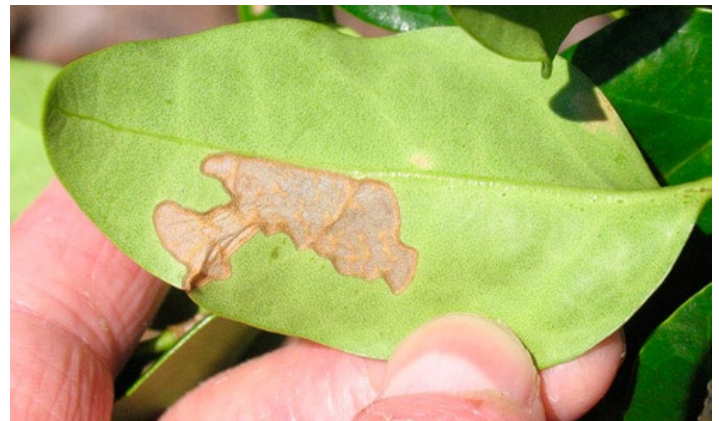
Figure 8. Feeding damage to epidermis of leaf. Credits: James E. Hayden

Ligustrum japonicum Thunb. (Japanese privet) in Florida and elsewhere, and Olea europaea L. (olive) in southern and western South America (Wille 1952; Chiaradia and Da Croce 2008).