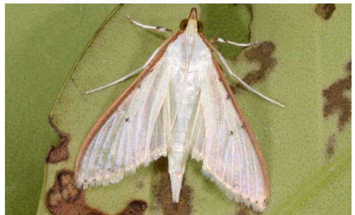
Figure 2. Palpita persimilis , live adult.