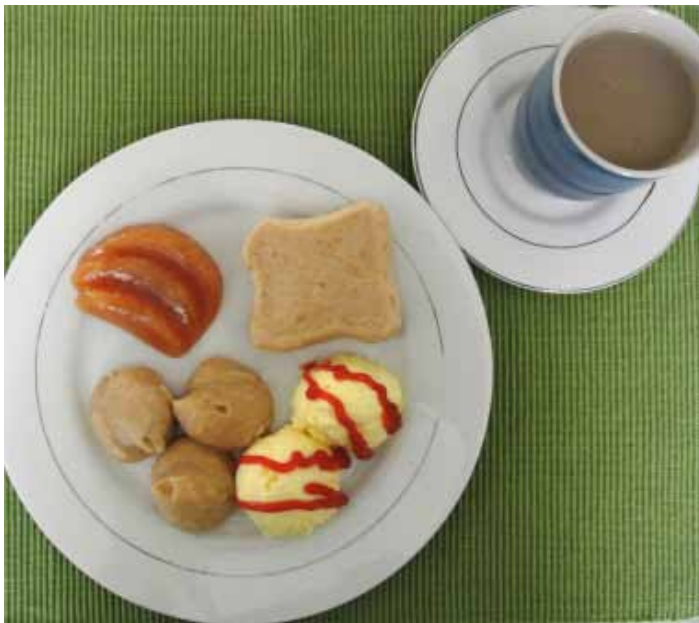
Figure 1. Scrambled eggs and ketchup with bacon, toast, peaches, and a side of coffee and milk

A puréed food is a food item that has been blended, mixed, or processed into a smooth and uniform texture. Examples of foods with a purée consistency include applesauce, pumpkin pie filling, and hummus. Puréed foods may be necessary for people with chewing and/or swallowing problems (ADA, 2002).