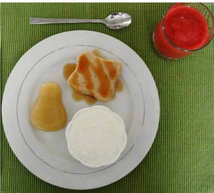
Figure 5. French toast and syrup with a side of cottage cheese and peaches and a strawberry yogurt smoothie

and nutrition classes for you to attend. Also, a registered dietitian (RD) can provide you with reliable information.