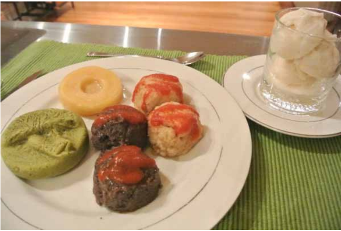
Figure 4. Spanish-style rice and beans with red chile sauce, a side of broccoli, pineapple, and vanilla frozen yogurt for dessert