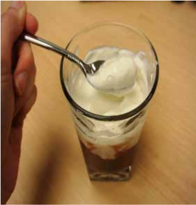
Figure 2. Dark chocolate mousse with sweet vanilla crème

3. If the purée is too thick or too thin, take the necessary steps to get the purée to the proper consistency.