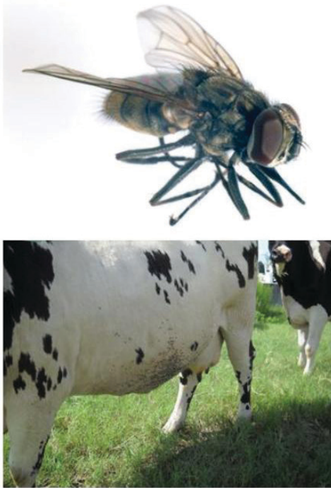
Figure 2. Adult horn fly (top); horn flies attacking cattle (below).

is adversely affected. Extreme numbers of 10,000 to 20,000 flies per animal have been reported and could make blood loss alone (0.5 gal/month) an important factor in reduced production.