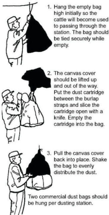
Figure 5. Directions for hanging commercial dust bags.

See ENY-272, Pesticide Safety Around Animals , for more information about the safe use of pesticides on livestock.