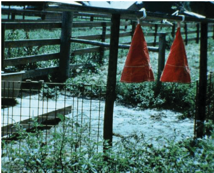
Figure 1. Forced-use dust bags positioned correctly to ensure self-application by cattle when visiting the water trough.