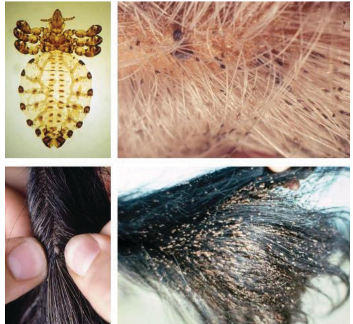
Figure 3. Cattle tail louse (top left) and adults attacking cattle (top right and bottom left). Top and bottom right show tail switch full of hatched and developing cattle tail louse eggs.

tail lice may be present year-round, it is best to treat in the months from spring to fall. Proper control procedures in the fall will prevent the winter build-up of eggs and subsequent damage to cattle when the nymphs emerge. Early spring insecticide applications will control the damaging emergence of nymphs from the over-winter build-up of eggs as well as aiding in horn fly control. Mid-winter spray treatments are not economically feasible because the population is generally in the egg stage and will not be killed by an insecticide application.