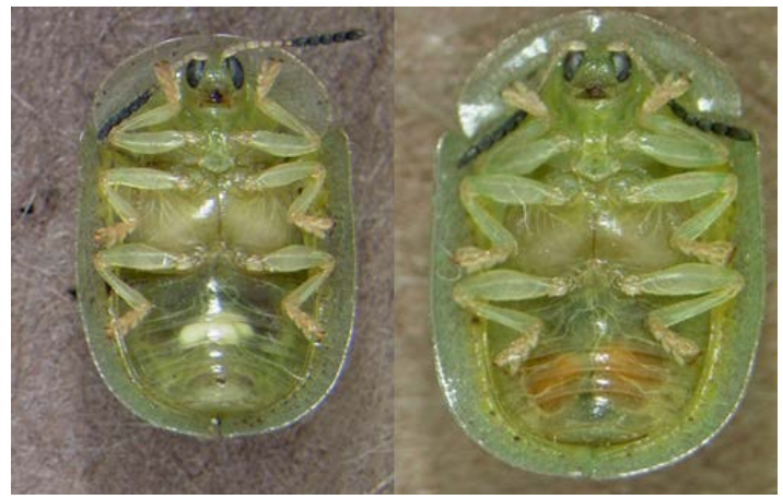
Figure 7. Female (left) and male (right) Gratiana boliviana ; note paired white oviducts and orange testes.

Reproductive males and females can be distinguished by examination of the ventral side of the posterior abdomen. Two orange testes are visible through the integument of males, whereas white oviducts can be seen in females.