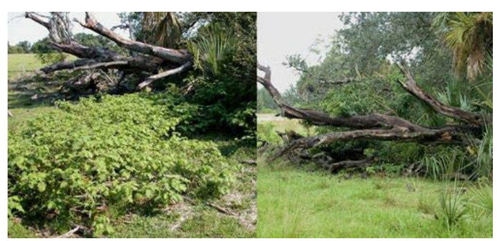
Figure 9. Pasture before and after the release of Gratiana boliviana , St. Lucie Co., Florida.

Feeding damage by larvae and adults of Gratiana boliviana is characterized by a distinctive 'shotgun' hole pattern on leaves and is apparent from April to November. This damage not only reduces the photosynthetic area of the leaves but also creates wounds that may facilitate attack by plant diseases. These cumulative stresses hinder the growth and reproduction of tropical soda apple. By reducing the competitive ability of the weed, Gratiana boliviana indirectly facilitates the recovery of pasture grasses and native vegetation.