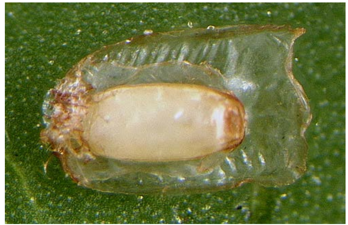
Figure 3. Egg of Gratiana boliviana .

The eggs are 1 to 1.8 mm long, brown and enclosed in a papery envelope.