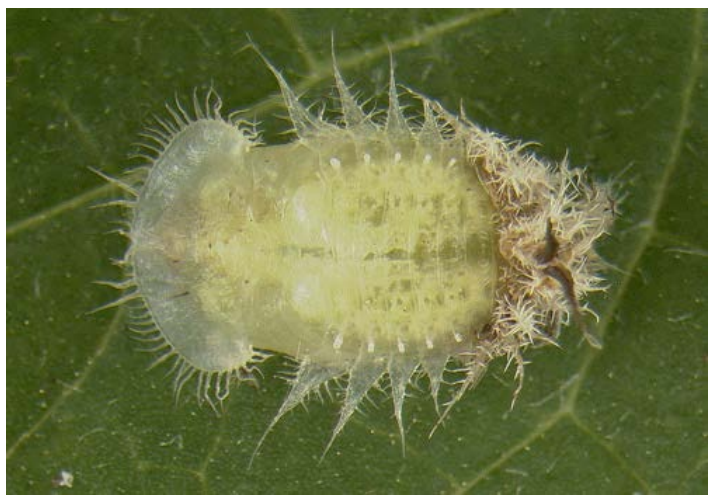
Figure 5. Pupa of Gratiana boliviana .

The pupae are 5 to 6 mm long, pale green, spiny, flattened and immobile. Pupae are found on the underside of leaves.