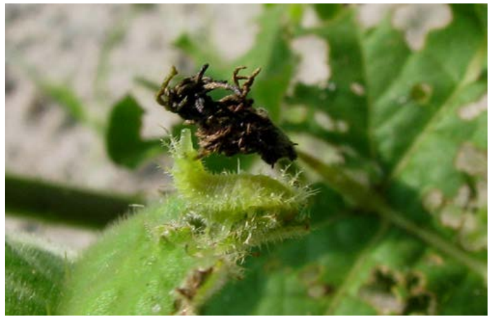
Figure 4. Larva of Gratiana boliviana ; note frass and cast skin.

The larvae are pale green and spiny. Later instars can be recognized by the presence of cast skins and frass that they carry as camouflage on their backs.