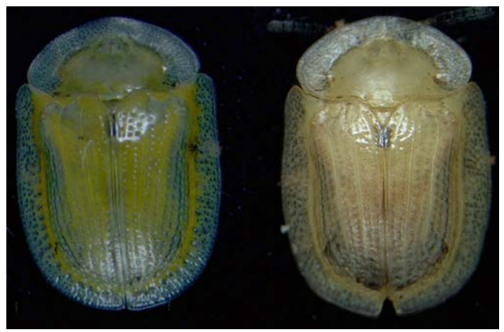
Figure 6. Reproductive adult (left) and adult in diapause (right) of Gratiana boliviana .

Adults are about 6 mm (1/4") long and 4 to 5 mm wide. The coloration of reproductive adults is deep green whereas that of adults in diapause (overwintering stage) is pale brown.