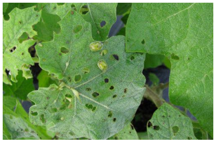
Figure 8. Tropical sodaapple leaves showing the shotgun hole damage by Gratiana boliviana .

In Florida, Gratiana boliviana actively feeds and reproduces from March/April until October/November and during these months can complete 7 to 8 generations. From December to early March, adults are in a reproductive diapause (resting stage), this allows them to survive periods of cold temperature and food scarcity. They are difficult to locate during the winter, as they hide in leaf litter beneath plants.