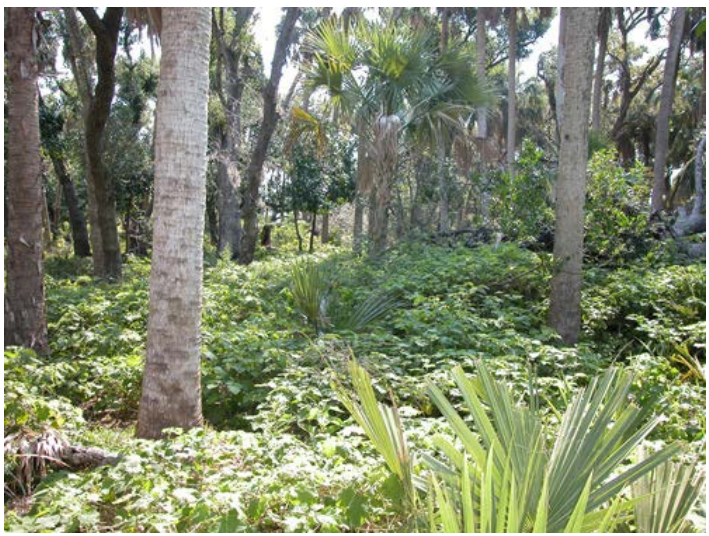
Figure 1. Tropical soda apple infestation in St. Lucie Co., Florida. April 2006.

The tropical soda apple leaf beetle, Gratiana boliviana Spaeth, was discovered in Paraguay and imported into the United States to study its potential as a biological control agent. Because Gratiana boliviana fed and survived only on tropical soda apple, field release was approved in 2003. A multi-agency program supported the rearing, distribution, and release of more than 250,000 beetles across Florida from 2003 to 2011. Gratiana boliviana was also released in Texas, Alabama, and Georgia, but establishment has not been confirmed.