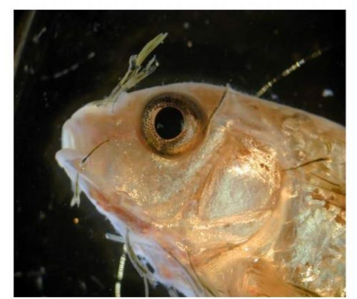
Figure 2. Koi infested with numerous female Lernaea

While an infection by small numbers of parasites isn't necessarily fatal, it is extremely irritating to the fish. Lernaea can cause intense inflammation, leading to secondary bacterial (e.g., Aeromonas hydrophila ) and fungal infections. These secondary infections sometimes worsen and kill the fish. Larger numbers of parasites on the gill can interfere with respiration, causing death. Fish can survive Lernaea infection, but chronic conditions frequently result in poor growth and body condition.