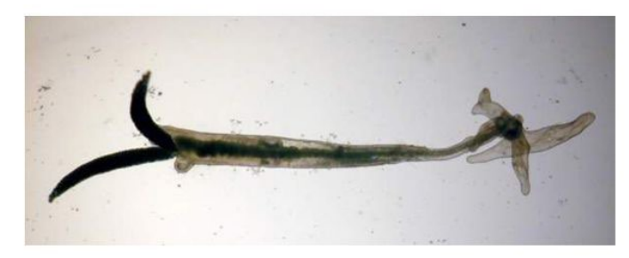
Figure 3. Adult female, removed from fish. Note "anchor" on right, which embeds into the fish, and paired egg sacs on left.

When seen by the naked eye, the most commonly observed life stage of the organism—the adult female—appears as a small, thin "thread" or "hair" approximately 25 mm long. Under the microscope, the long, tubular body has an anchor on the anterior end and paired egg sacs on the posterior end (Figure 3). The anchor, located in the anterior ("head") region, is typically embedded into the host's tissue, while the posterior end, with its egg sacs, extends out into the water column. Juvenile life stages, especially the copepodid stages, may also be seen on skin, fin, or gill samples with use of a microscope (Figure 1). Because adult female Lernaea may be confused with plant fibers, fungi, or other organisms, a fish health professional should be consulted for an accurate diagnosis. Use of a microscope to examine wet mounts of affected areas (skin, gill, oral cavity, fins) will be necessary to confirm the presence of this parasite.