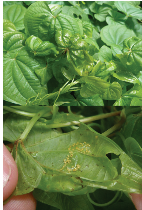
Figure 3. A deformed expanding leaf of air potato (top) and the Lilioceris cheni eggs enclosed within (bottom).