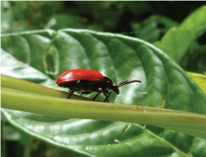
Figure 2. Adult Lilioceris cheni beetle.

to release this beetle was acquired from USDA-APHIS after extensive testing demonstrated its host specificity with virtually no risk to other plant species (Pemberton and Witkus, 2010).