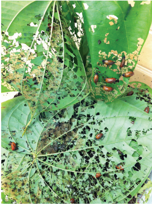
Figure 5. An aggregation of late instar L. cheni larvae feeding on air potato leaves.