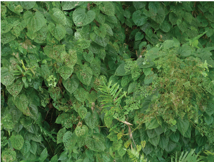
Figure 6. Air potato leaves defoliated by L. cheni at Snyder Park less than a month after release.

The host plant drops its leaves during the winter, which forces the adult beetles to go several months without food, presumably in diapause beneath leaf litter or other debris on the ground. The overwintered adults emerge during spring. Females initially lay about 90 eggs/day during a 13-day period of ovipositional activity.