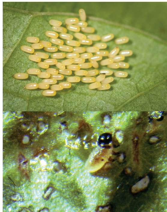
Figure 4. L. cheni eggs (top) and a freshly emerged first instar larva (bottom).

When fully grown, larvae drop from the host plant and enter the soil. They then produce a whitish oral secretion that hardens into a foam-like cocoon. Pupation occurs gregariously, often with several pupae clumped together within a matrix of this material. Adults emerge in about 16 days, begin mating in about 10 days, and initiate