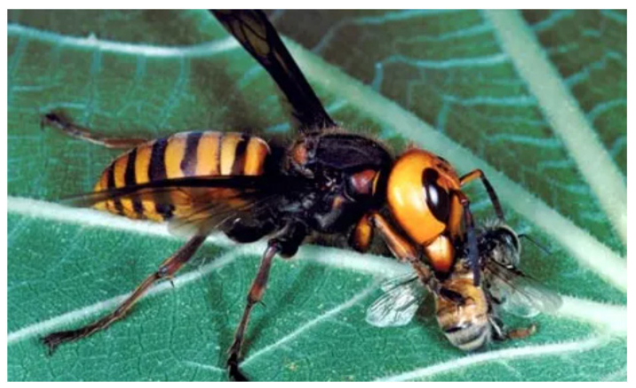
Figure 4. Vespa mandarinia Smith processing its honey bee prey capture.

colonies, depending upon the honey bee species. Similarly, another invasive wasp species Vespa velutina attacks honey bee colonies in this way, weakening about 30% of honey bee hives (Monceau et al. 2014). The most famous mode of predation by this hornet, often referred to as a slaughter, it is extremely damaging to the prey colony (Matsuura and Yamane 1990).