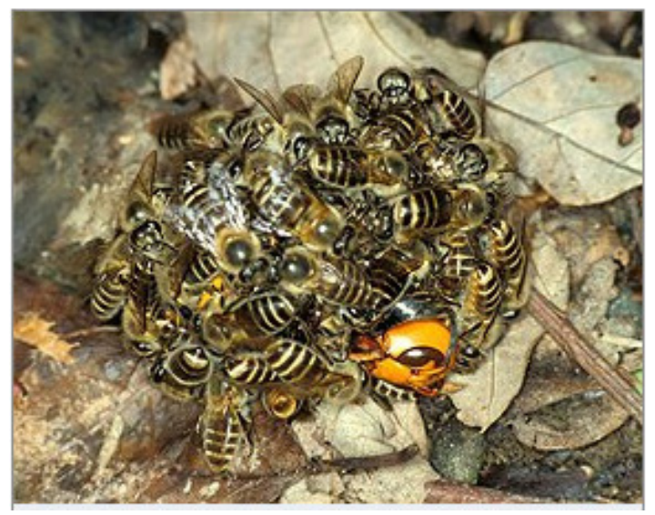
Figure 5. Honey bees defensively "balling" a single Vespa mandarinia Smith.

co-existence with Vespa mandarinia . The bees communicate to each other to begin surrounding (or "balling") the hornet in order to raise their group temperature to approximately