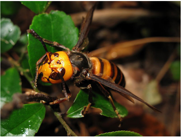
Figure 1. Female Vespa mandarina Smith, resting.

Vespa japonica Radoszkowski (1857) Vespa latilineata Cameron (1903) Vespa sonani Matsumura (1930) Vespa mandarinia bellona Smith (1871) Vespa mandarinia magifica Smith (1852) Vespa mandarinia nobilis Sonan (1929) (Catalogue of Life: 2019 Annual Checklist)