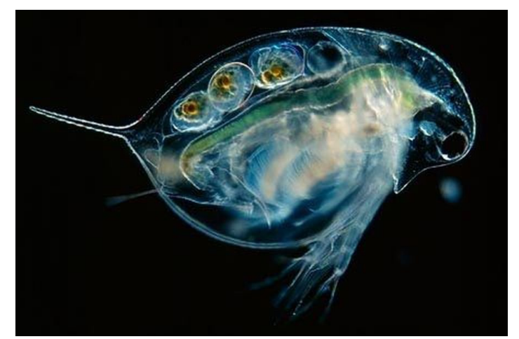
Figure 2. Microscopic photograph of a Daphnia , a zooplankton that eats algae and can be used to manage eutrophication.

• Higher nutrient levels lead to loss of the submerged aquatic plants that provide good habitat for fish. At higher temperatures, even low levels of nutrient enrichment can cause such plant loss. Once again, nutrient enrichment and climate change combined make eutrophication problems worse.