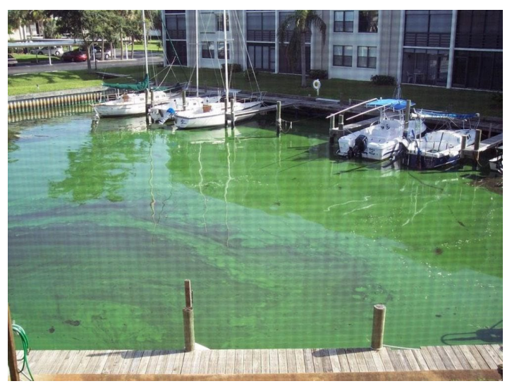
Figure 1. A bloom of blue-green algae on the water surface in the St. Lucie Estuary, Fla.

Cultural eutrophication is harmful, but it can be reversed if the nutrients come from easily identified point sources such as sewage treatment plants or septic systems. It is far more difficult to control nutrients if they come from diffuse sources such as large land areas with fertilized crops, lawns, or animal pastures.