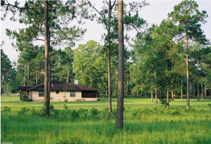
Figure 3. The best way to minimize risk of fire damage is to reduce fuels around the structure.

resources to ensure safety and success. Certification, burn plans, and permits are required by state forestry agencies.