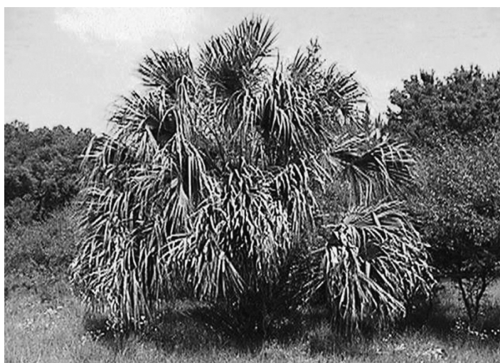
Figure 1. The dead or dying fronds on this cabbage palm increase its overall flammability and create a fire hazard when in close proximity to a house.

Resource managers often face challenges implementing firewise landscaping because landowners resist modifying or removing vegetation from around their houses. Some residents worry that firewise landscaping conflicts with their goals to maximize aesthetics and privacy, both of which are enhanced by vegetation around the structure. Many landowners live in interface forests because they want to be near forest vegetation. Firewise practices remove some of this vegetation, changing the look and feel of the landscape. Landowners may also fear losing the cooling shade of trees or the wildlife habitat that dense vegetation provides. Some landowners may ignore firewise principles because they care more about living in nature and protecting nature than they care about losing their property to fire. Therefore, they are willing to live with the risk of property loss in order to minimize disruption to natural systems.