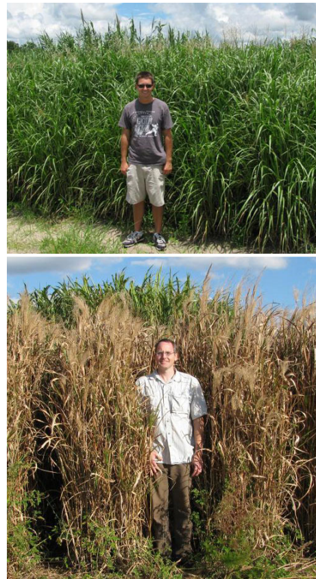
Figure 2. Stands of Miscanthus x giganteus reach maturity in July (top) in Florida, and continued growth is limited through November (bottom).

In Florida, less is currently known about Miscanthus x giganteus production compared to other potential biofuel crops such as sugarcane, sweet sorghum, and elephantgrass,