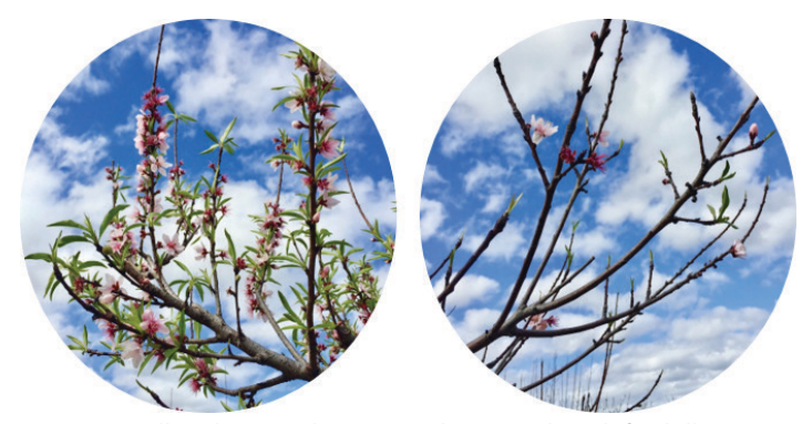
Figure 3. Budbreak in peach cv. 'Tropicbeauty' when (left) chilling requirements have been met, and (right) when they have not.