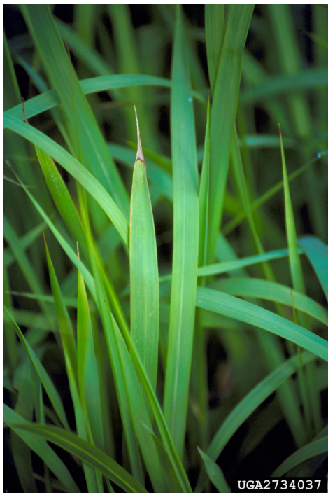
Figure 1. Cogongrass plants are yellow to green in color. Note that the edges of the leaf tend to have more yellow than green.