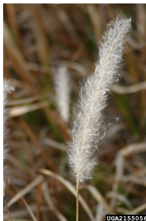
Figure 3. Cogongrass seed heads are fluffy and white. Each plant produces nearly 3,000 seeds.