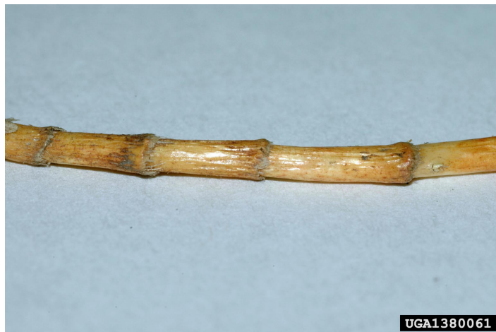
Figure 4. Cogongrass rhizomes are segmented (have nodes) where new shoots are able to grow.

Herbicide inputs alone are rarely successful in eradicating perennial species like cogongrass. In these cases, we need to