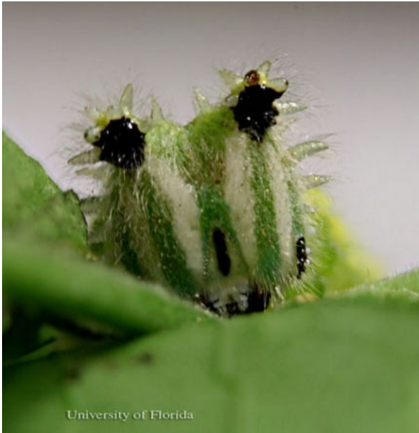
Figure 11. Anterior view of head of a larva of the tawny emperor, Asterocampa clyton (Boisduval & Leconte), showing cephalic horns.

and a pair of short black-tipped horns on top (Minno et al. 2005). See Wagner (2005) for excellent drawings comparing the cephalic horns and lateral spines of the tawny and hackberry emperors.