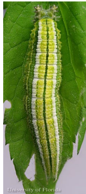
Figure 10. A full-grown larva of the tawny emperor, Asterocampa clyton (Boisduval & Leconte), dorsal view.