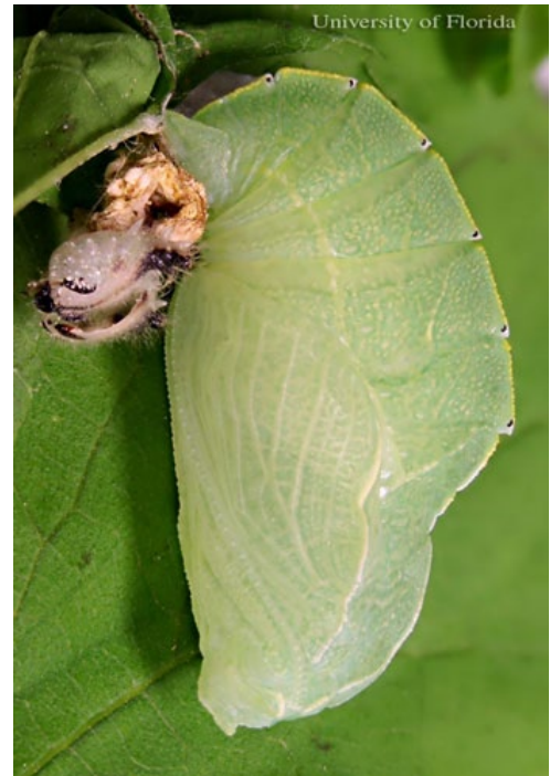
Figure 13. Lateral view of recently pupated tawny emperor, Asterocampa clyton (Boisduval & Leconte). Note the fifth (last) instar larval exuviae to the left of the pupal point of attachment.

Mature pupae are green with small yellow spots and a yellow mid-ventral line that branches and runs to the tips of two horns at the anterior end of the pupa. There are also two yellow lateral lines and diagonal yellow lines on the sides of the abdomen. Each abdominal segment has a dark dot at the anterior end on each side of the mid-ventral line. The pupa is attached to a silk pad by the cremaster (hooked spines on tip of pupa). Pupae are virtually identical to those of the hackberry emperor except for the thin yellow lines that are white in the hackberry emperor.