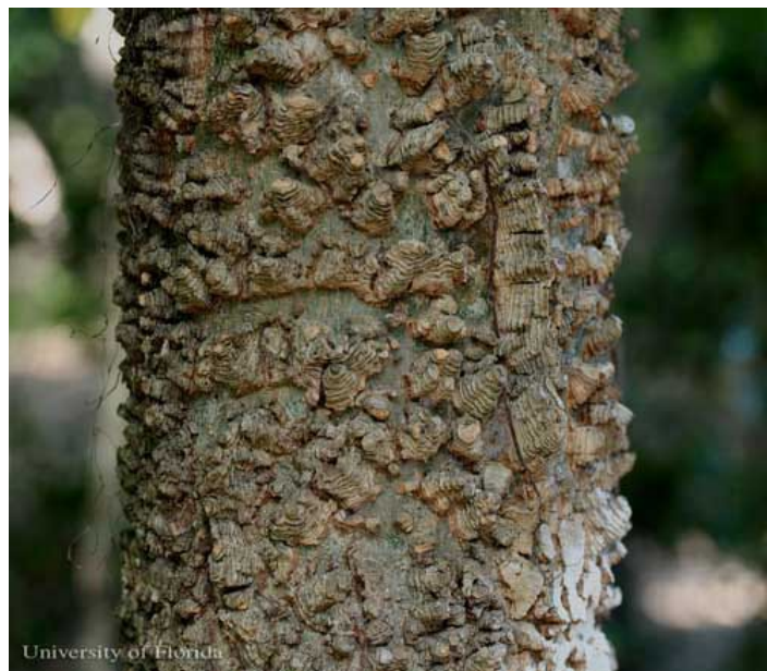
Figure 25. Heavily warty trunk of sugarberry, Celtis laevigata Willd., a host of the tawny emperor, Asterocampa clyton (Boisduval & Leconte).