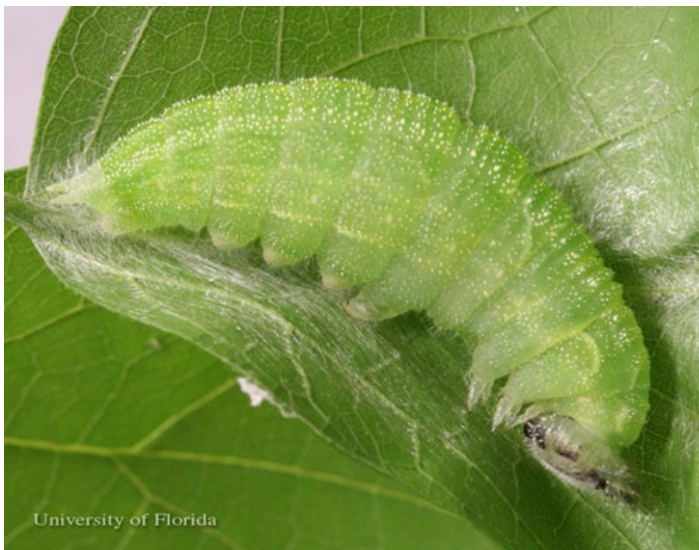
Figure 12. Pre-pupal larva of the tawny emperor, Asterocampa clyton (Boisduval & Leconte).

Prior to pupation, the prepupal larva spins a silk pad and attaches to it with its terminal prolegs. It then becomes inactive and fades to a pale green color.