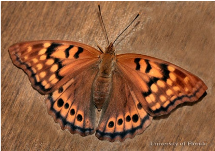
Figure 2. An adult female tawny emperor, Asterocampa clyton (Boisduval & Leconte), with wings open.

The wings are brown to orange-brown. Adults may be distinguished from those of the hackberry emperor by the two complete dark bars in the front wing cell and the lack of a sub-marginal dark eyespot on the front wings. Also, the hackberry emperor has rows of pure white spots on the upper front wings that are pale yellow in the tawny emperor. Males can be differentiated from females by their smaller size and the concave outer margins of their wings.