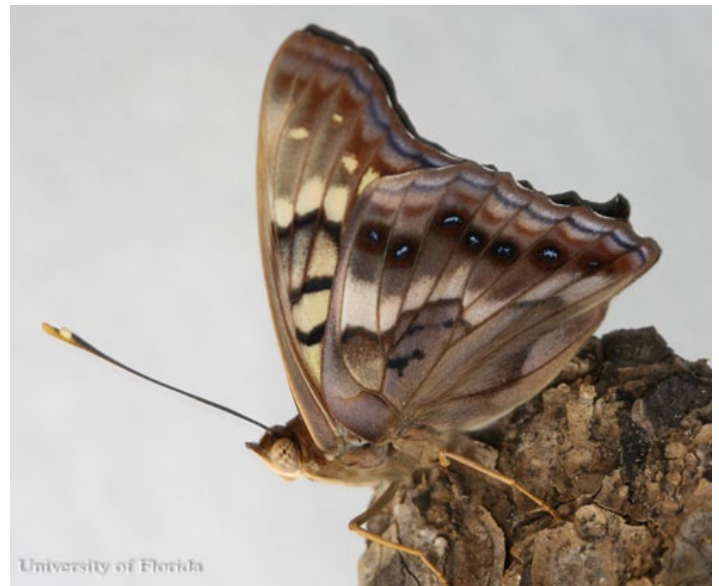
Figure 5. An adult male tawny emperor, Asterocampa clyton (Boisduval & Leconte), with wings closed.