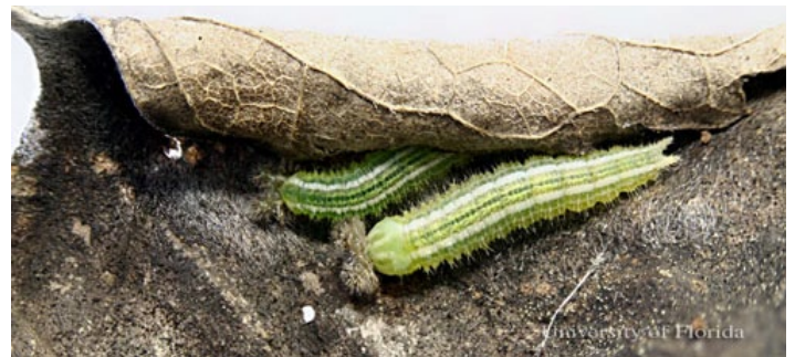
Figure 21. Post-hibernation larvae of the tawny emperor, Asterocampa clyton (Boisduval & Leconte), on hibernaculum.