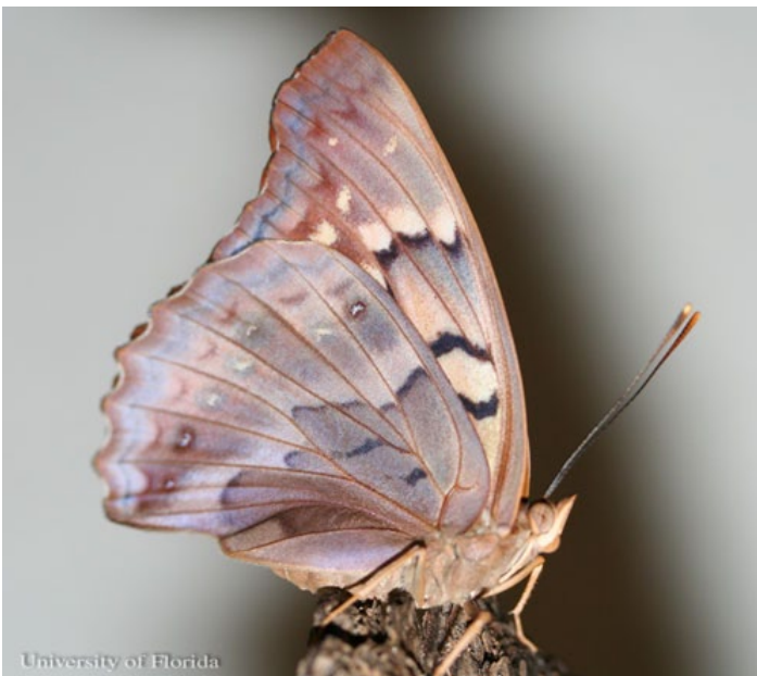
Figure 3. An adult female tawny emperor, Asterocampa clyton (Boisduval & Leconte), with wings closed.