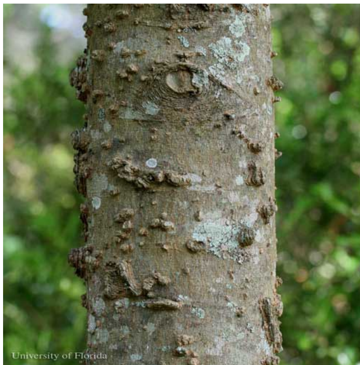
Figure 24. Warty trunk of sugarberry, Celtis laevigata Willd., a host of the tawny emperor, Asterocampa clyton (Boisduval & Leconte).