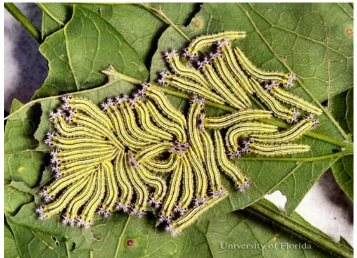
Figure 17. Eleven-day-old (third instar) gregarious larvae of the tawny emperor, Asterocampa clyton (Boisduval & Leconte).