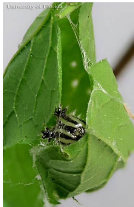
Figure 22. Fourth instar larva of the tawny emperor, Asterocampa clyton (Boisduval & Leconte), in leaf shelter.

As the new foliage begins to appear, the larvae come out of hibernation and begin to feed, after which they regain their green color. A few days later they molt to the next instar. For a period of time they continue to return to the shelter of the hibernaculum after feeding.