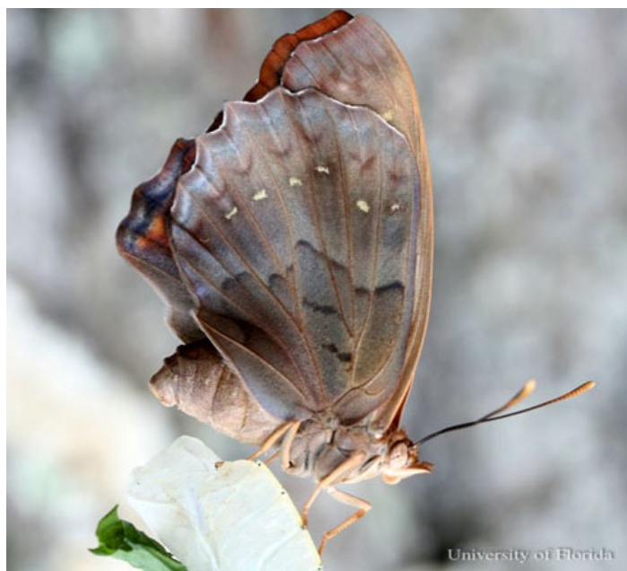
Figure 1. A newly emerged, adult female tawny emperor, Asterocampa clyton (Boisduval & LeConte), clinging to its pupal exuviae. Credits: Don Hall, University of Florida

The wing spread of adults is 2 – 2 5/8 inches (5 – 6.7 cm) (Allen 1997). Females are much larger than males (Minno and Minno 1999). Adults are somewhat variable regionally and the variants have previously been considered separate species (Glassberg et al. 2000). Gatrell (1999)