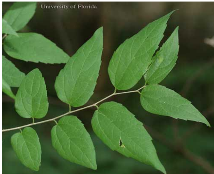
Figure 23. Sugarberry, Celtis laevigata Willd., a host of the tawny emperor, Asterocampa clyton (Boisduval & Leconte).

northern hackberry, Celtis occidentalis Linnaeus, and the more southern sugarberry, Celtis laevigata Willd., can usually be recognized by the slightly to heavily warty appearance (or pronounced ridges on mature C. occidentalis ) of the bark. More information and a key to the Celtis species is available at efloras.org (2009).