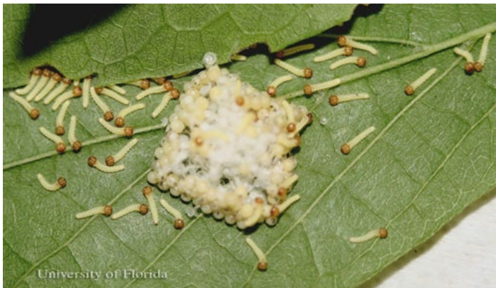
Figure 15. Newly hatched larvae of the tawny emperor, Asterocampa clyton (Boisduval & Leconte).

When threatened, young larvae swing their spiny, shield-like heads and attempt to bite with their mandibles—behavior that may defend against ants and other small predators (Stamp 1984).