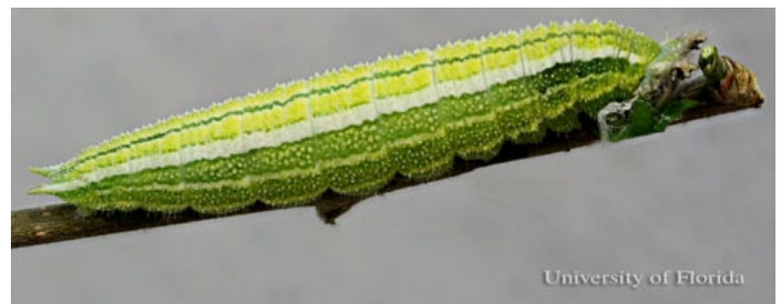
Figure 9. A full-grown larva of the tawny emperor, Asterocampa clyton (Boisduval & Leconte), lateral view.