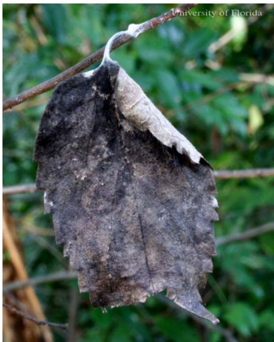
Figure 19. A hibernaculum of the tawny emperor, Asterocampa clyton (Boisduval & Leconte), formed by curling the edge of a single leaf. This small hibernaculum contained five larvae.

As the new foliage begins to appear, the larvae come out of hibernation and begin to feed, after which they regain their green color. A few days later they molt to the next instar. For a period of time they continue to return to the shelter of the hibernaculum after feeding.