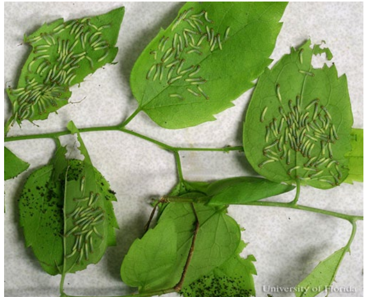
Figure 16. Two-day-old gregarious larvae of the tawny emperor, Asterocampa clyton (Boisduval & Leconte).