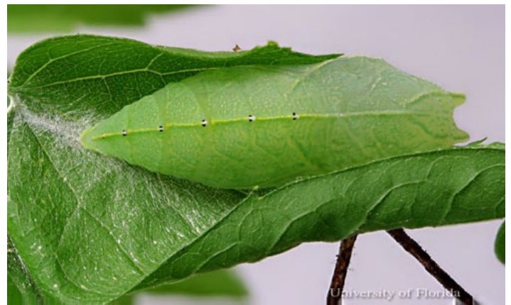
Figure 14. Dorsal view of pupa of the tawny emperor, Asterocampa clyton (Boisduval & Leconte).