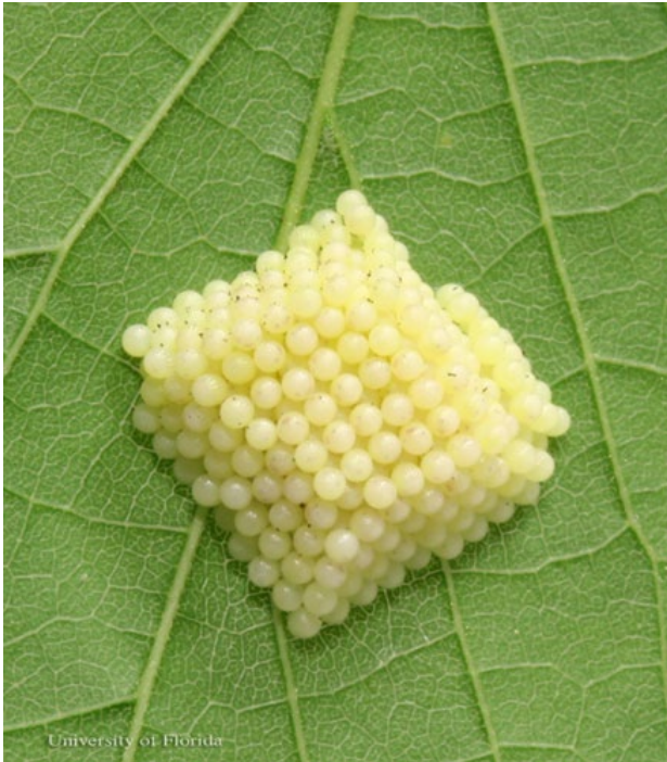
Figure 6. Eggs of the tawny emperor, Asterocampa clyton (Boisduval & Leconte).