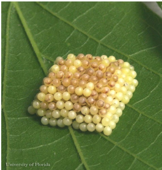
Figure 7. Eggs of the tawny emperor, Asterocampa clyton (Boisduval & Leconte), one day before hatching