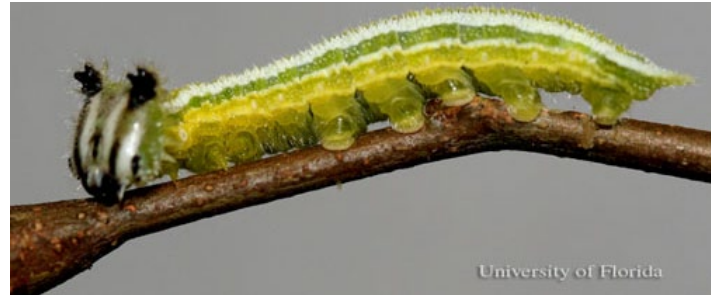
Figure 8. A fourth instar larva of the tawny emperor, Asterocampa clyton (Boisduval & Leconte), lateral view.

Full grown larvae are approximately 1.5 inches (3.8 cm) in length (Minno et al. 2005). The body is green with yellow and white longitudinal stripes, a dark blue-green mid-dorsal line, and a pair of short tails on the posterior end. The shield-like head has short spines on the sides