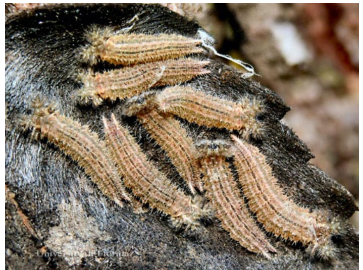
Figure 20. Overwintering larvae of the tawny emperor, Asterocampa clyton (Boisduval & Leconte).