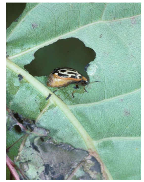
Figure 2. Adult cottonwood leaf beetle, Chrysomela scripta Fabricius, feeding on foliage.

Cottonwood, Populus deltoides , is its primary host. As soon as spring leaf growth occurs, the cottonwood leaf beetle moves from under the bark, litter, or forest debris to the host trees to feed on the leaves and twigs. The beetle feeds most often on immature buds. Leaf beetles can complete