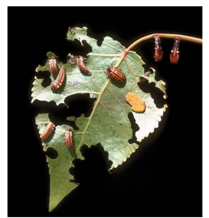
Figure 10. Life cycle of the cottonwood leaf beetle, Chrysomela scripta Fabricius.

Early stage larvae are not readily susceptible to predation due to their repellent defenses (Krischiks 2007). The larvae emit a pungent odor from the scent glands when disturbed. Interestingly, the scent droplet is reabsorbed by the larvae after danger has passed. Mature larvae also posess this same defensive ability.