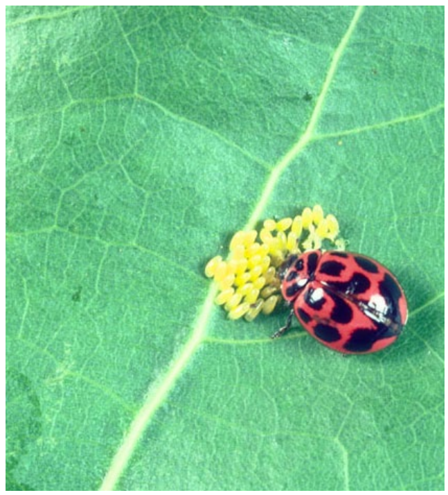
Figure 15. The v-marked lady beetle, Neoharmonia venusta (Melsheimer), feeding on eggs of the cottonwood leaf beetle, Chrysomela scripta Fabricius.