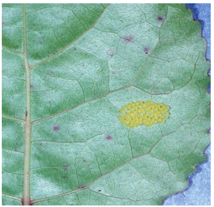
Figure 5. Eggs of the cottonwood leaf beetle, Chrysomela scripta Fabricius, on leaf.

The yellow, lemon-like eggs are laid in clusters of 15–75 on the underside of the foliage.