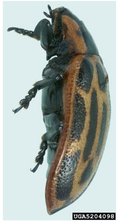
Figure 4. Adult cottonwood leaf beetle, Chrysomela scripta Fabricius, lateral view. Credits: Natasha Wright, Florida Department of Agriculture and Consumer Services; www.insectimages.org

Credits: Natasha Wright, Florida Department of Agriculture and Consumer Services; www.insectimages.org