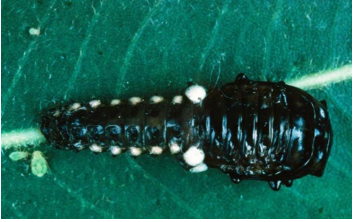
Figure 8. Pupa of the cottonwood leaf beetle, Chrysomela scripta Fabricius, on leaf.

The pupae resembles the larvae, being black in color. Pupae are found on branches and leaves.