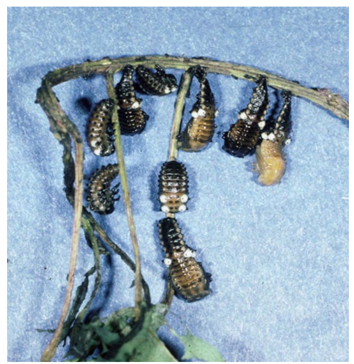
Figure 9. Pupae of the cottonwood leaf beetle, Chrysomela scripta Fabricius, on branch.