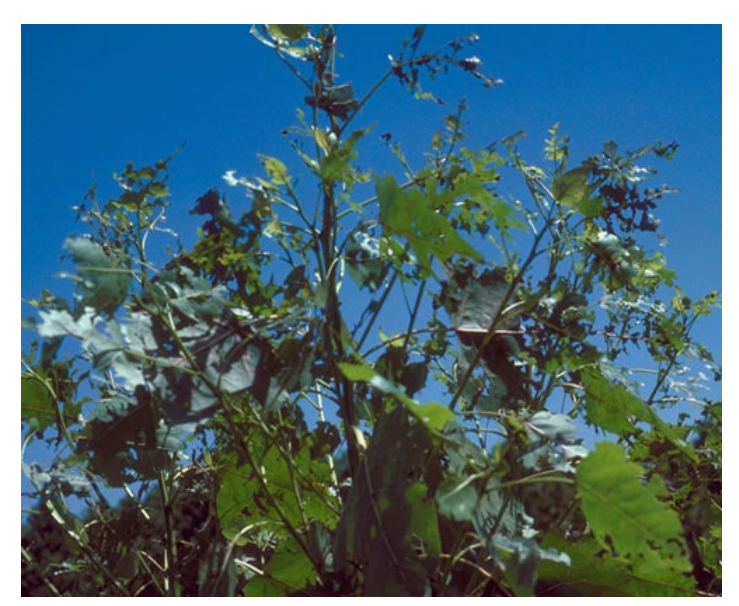
Figure 13. Defoliation caused by the cottonwood leaf beetle, Chrysomela scripta Fabricius.

Figure 12. Initial feeding damge from the cottonwood leaf beetle, Chrysomela scripta Fabricius.