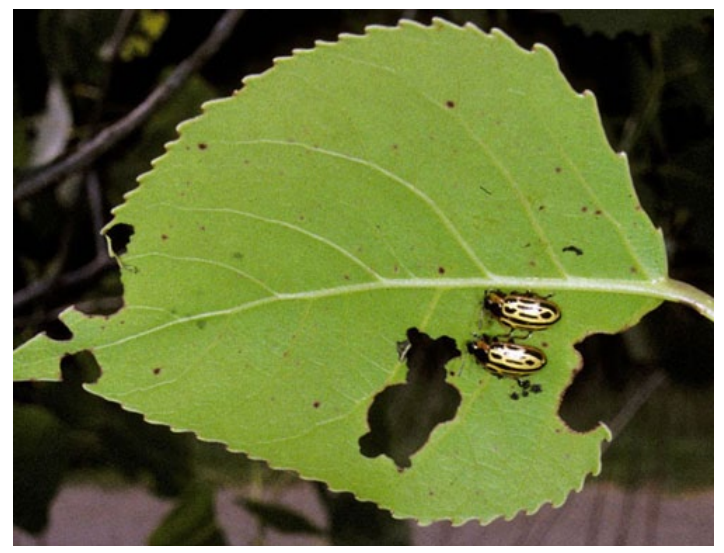
Figure 12. Initial feeding damge from the cottonwood leaf beetle, Chrysomela scripta Fabricius.