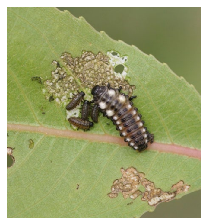
Figure 7. Size differences of young and mature larvae of the cottonwood leaf beetle, Chrysomela scripta Fabricius.

The young larvae are black in color, but will eventually become light to dark brown with noticeable white scent glands as spots along their body. In many instances, young larvae begin their feeding gregariously on the underside of the foliage. Older larvae feed singularly and usually consume the entire leaf, except for the thicker veins. However, they vary in color, often are gray, and may grow to 12 mm in length (Smith and Ward 1998).