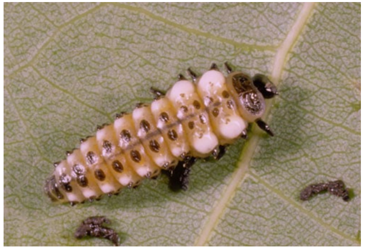
Figure 11. Larva of the cottonwood leaf beetle, Chrysomela scripta Fabricius, with scent droplets.

As larvae mature, they become lighter in color and reach the pupa stage after one or two weeks of feeding. The mature larvae attach in an upside down position to the underneath leaves and bark of their hosts or on weeds to initiate pupation. After five to 10 days of pupation, the first generation of adults appears. The number of generations varies according to latitude and climate (Krischiks 2007).