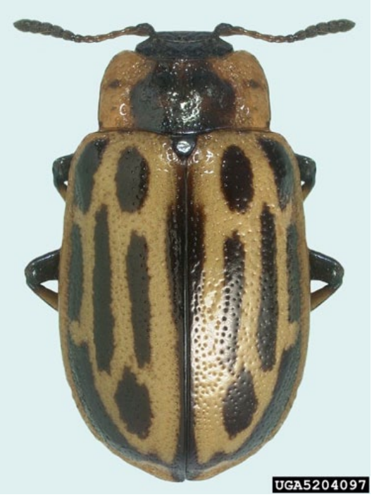
Figure 3. Adult cottonwood leaf beetle, Chrysomela scripta Fabricius, dorsal view.

The adult beetles are 6 mm (1/4 inch) long with a black head and thorax and clavate antenna. They also possess yellow or reddish margins on the thorax. However, the orange patterns vary among the adults. The elytra are yellowish with broken black stripes. In most cases, the male is considerably smaller than the female.