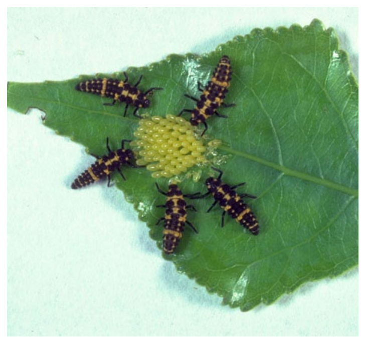
Figure 16. Larvae of the convergent lady beetle, Hippodamia convergens Guerin-Meneville, feeding on eggs of the cottonwood leaf beetle, Chrysomela scripta Fabricius.

Smith R, Ward C. (September 1998). Chrysomela scripta F. New Mexico State University . http://aces.nmsu.edu/pubs/_circulars/circ552.html (21 February 2012).