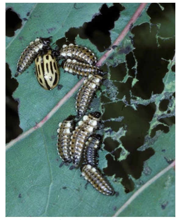
Figure 1. Adult (upper left) and various larval instars of the cottonwood leaf beetle, Chrysomela scripta Fabricius, feeding on foliage.

The cottonwood leaf beetle, Chrysomela scripta Fabricius, is one of the most economically-important pests of managed cottonwood, aspen, and some poplar and willow species. Although it does not present a serious pest problem in forests, often it is a severe pest of urban ornamental trees. This leaf feeder has several generations each year, may