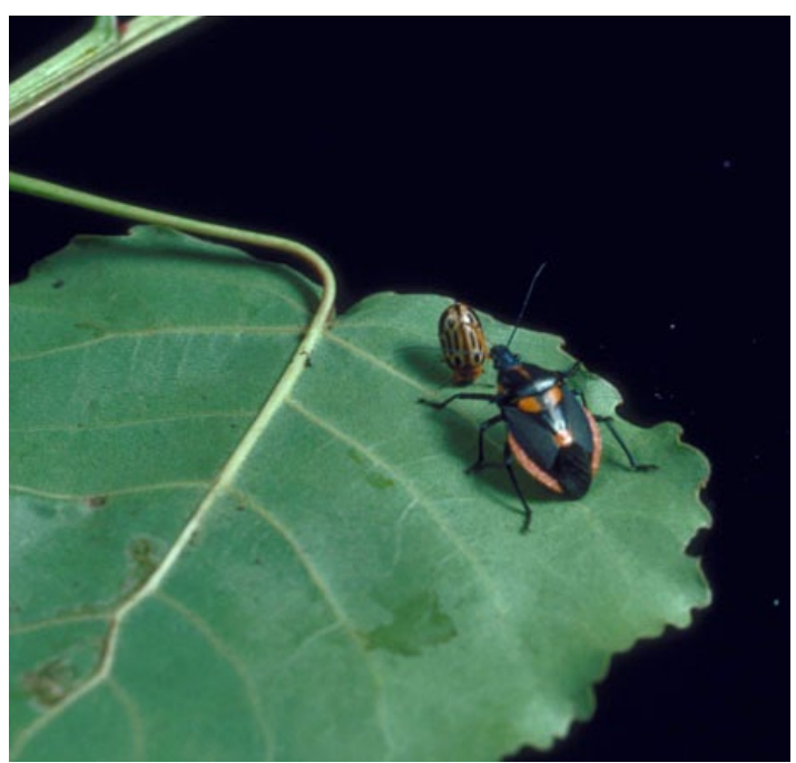
Figure 14. The anchor stink bug, Stiretrus anchorago (Fabricius), a predator of adult cottonwood leaf beetles, Chrysomela scripta Fabricius, as seen here

There have been reports of a number of natural enemies that attack cottonwood leaf beetle. These include the stink bug, Stiretus anchorago ; the convergent lady beetle, Hip podamia convergens ; v-marked lady beetle, Neoharmonia venusta ; as well as ants, spiders and parasitic wasps. The convergent lady beetle feeds on the eggs while stink bugs attack the adult beetles. The microbial insecticide Bacillus thuringiensis strains "San Diego" and "tenebrionis" have been used as a preventative and curative method to control cottonwood leaf beetle adults.