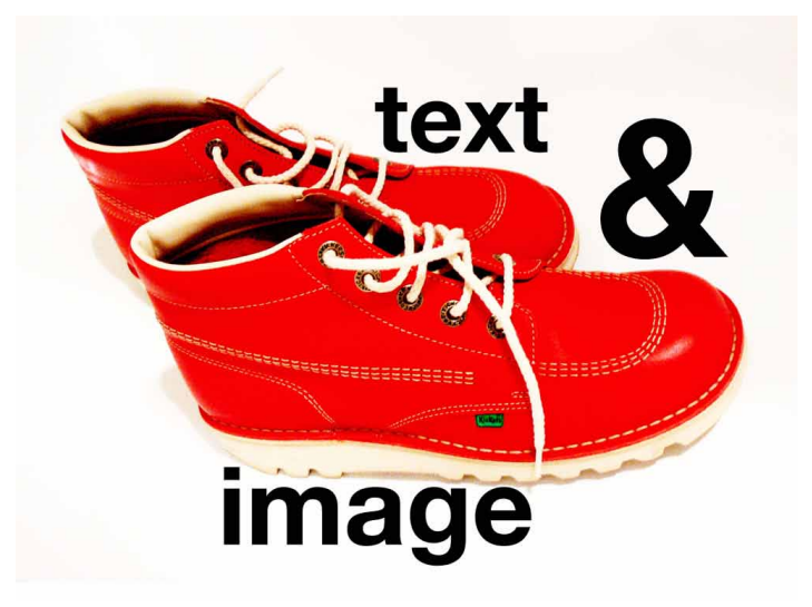
Figure 1. Designer Anthony Sigalas created this bold visual that kicks with vivid color, high contrast, large typefaces, and surrounding white space. CC BY-NC-SA 2.0. http://flic.kr/p/4rhH4P