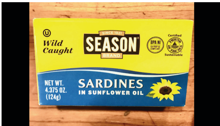
Figure 3. A can of wild-caught fish bearing a Friend of the Sea logo.

Certified products will be added to a digital database and will be allowed to bear an FotS logo. Products certified with both GlobalGAP and FotS will be entitled to a label that bears both the FotS logo and the product's GGN.