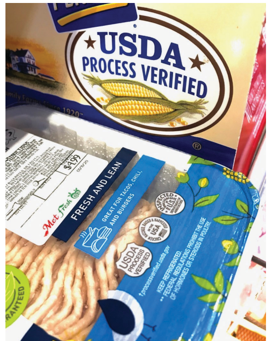
Figure 5. Although the poultry industry is the largest participant in the USDA Process Verified program, the program is open to aquaculture products as well.

In addition to being able to market a final product with a verified process claim, producers also benefit from being able to use a USDA Process Verified shield in promotional materials. The use of such shield and label claims are governed by the USDA Food Safety and Inspection Service.