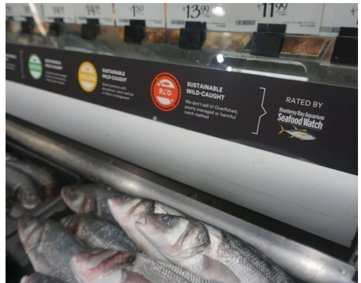
Figure 1. The Monterey Bay Aquarium's "Seafood Watch" is an example of ecolabeling wild-caught seafood that uses a red, yellow, and green system to identify sustainable seafood.

When considering any form of label-based marketing it is advised that interested parties consult the Federal Trade Commission's (FTC) "Green Guides," which are publications that are meant to clarify relevant sections of federal consumer protection law (Czarnezki et al. 2014). The FTC, Food and Drug Administration (FDA), the United States Department of Agriculture (USDA), and state-level consumer protection agencies prosecute false marketing claims and unauthorized use of ecolabels (Czarnezki et al. 2014).