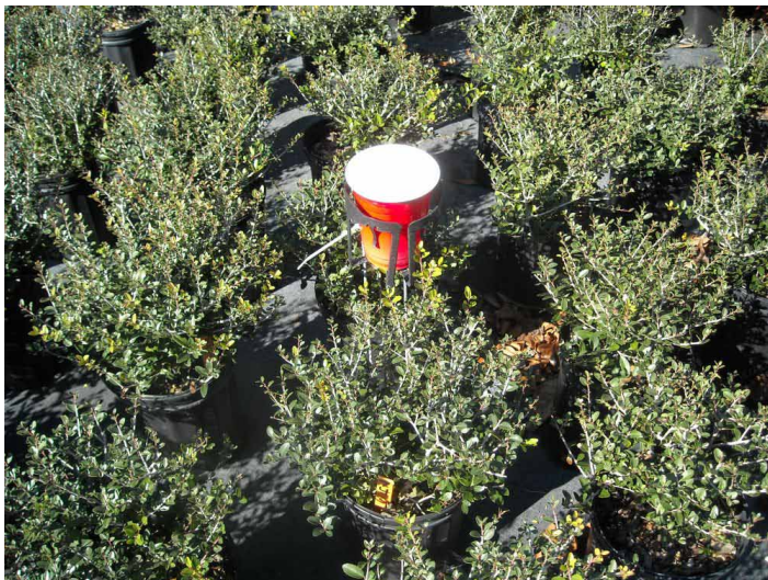
Figure 3. Irrigation collection cups are placed above canopy in the vicinity of test plants.