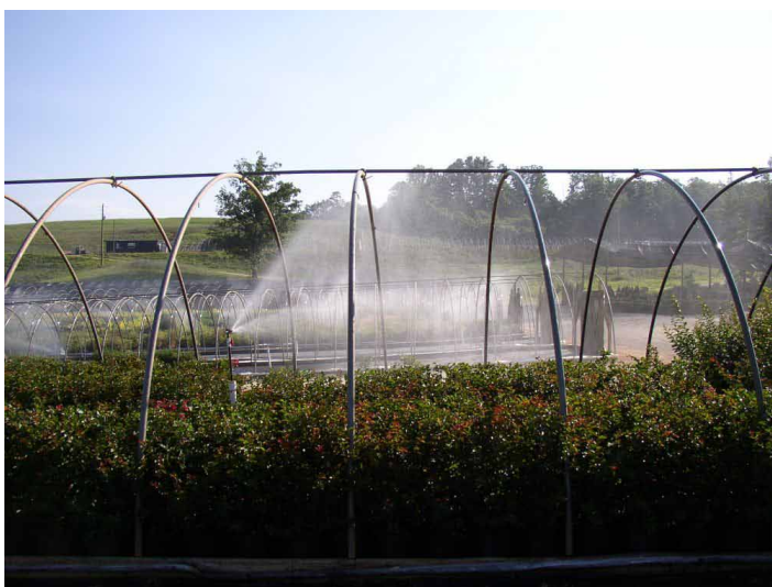
Figure 1. The irrigation requirement is the amount of irrigation water needed to resupply water lost through evapotranspiration.

Container nurseries irrigate to resupply water lost through evapotranspiration ( http://edis.ifas.ufl.edu/ae256 ). Evapotranspiration (ET) rates for container-grown plants are affected by plant size, container size and spacing, and weather. Because plant size changes slowly, weather is the primary factor affecting day-to-day changes in ET water loss from containers. Water deficits in container substrates can be measured directly by weighing, indirectly with sensors, or estimated with predictive models. When determining the irrigation requirement based on measured