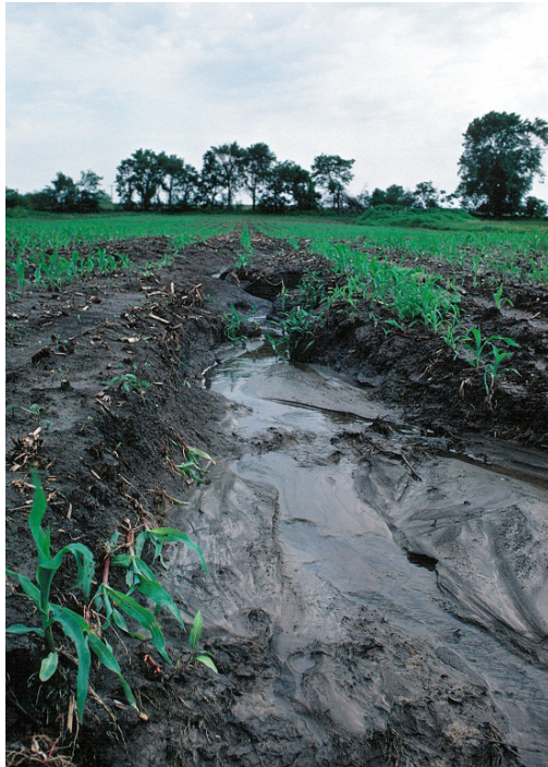
Figure 1. Erosion resulting from concentrated flow in a cornfield.