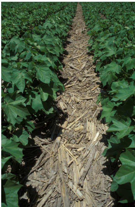
Figure 2. Cotton under conservation tillage; soil is completely covered by corn crop residues, protecting against soil erosion and non-beneficial evaporation.