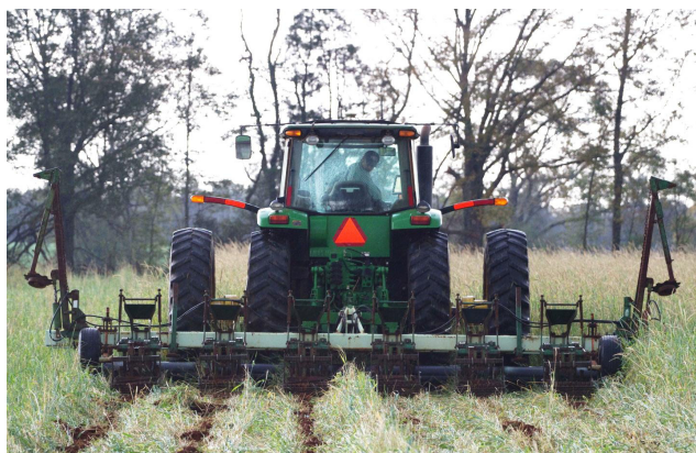
Figure 3. Cover crop rolling and strip tillage in preparation for planting; note the substantial plant residues maintained on the soil surface. Custom roller/strip-till unit by Myron Johnson of Headland, AL.