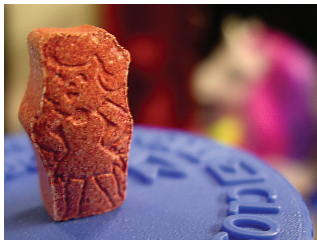
Figure 1. Many of us may think of this iconic image when we think about vitamins, but a healthy diet really starts with healthy food choices.

Ascorbic Acid (Vitamin C) Thiamin (Vitamin B 1 ) Riboflavin (Vitamin B 2 ) Niacin (Vitamin B 3 ) Pyridoxine (Vitamin B 6 ) Cobalamin (Vitamin B 12 ) Folate Pantothenic Acid Biotin