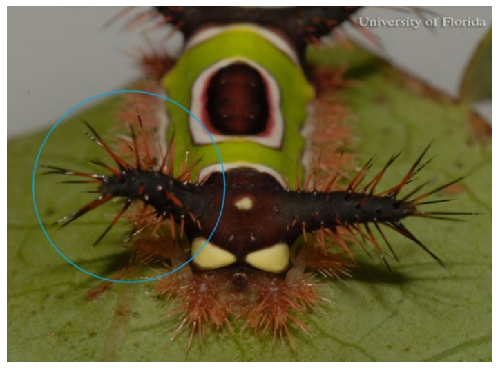
Figure 5. Close up of urticating spines of the saddleback caterpillar, Acharia stimulea (Clemens) larva, on blueberry.

This green section is bordered with white markings that outline a saddle-like shape. The skin has a granulated texture, and large fleshy tubercles extend from both anterior and posterior ends. Each tubercle is covered in long setae and a complex of varied urticating spines embedded among the setae.