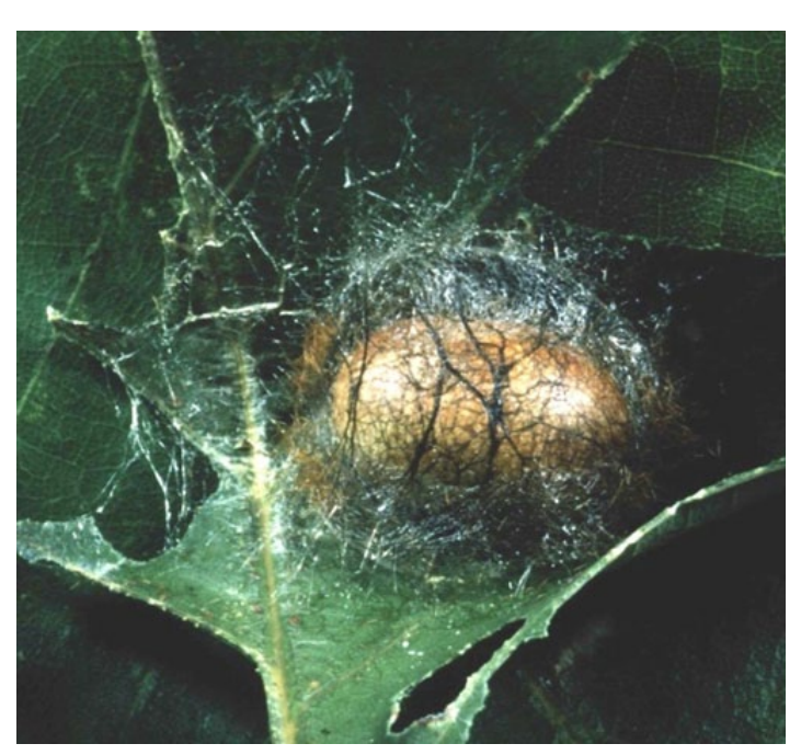
Figure 9. Cocoon of the saddleback caterpillar, Acharia stimulea (Clemens).

Larvae spin compact, silk cocoons roughly half the size of the last instar. The cocoon is then hardened to protect the pupa contained within.