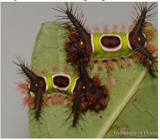
Figure 1. Mature larvae of the saddleback caterpillar, Acharia stimulea (Clemens).

Acharia stimulea (Clemens) is a limacodid moth, or slug moth, best known for its larval growth phase. Distinct bright color patterns and the presence of venomous, urticating spines lead to its recognition as the saddleback caterpillar. It is native to a large range in the eastern United