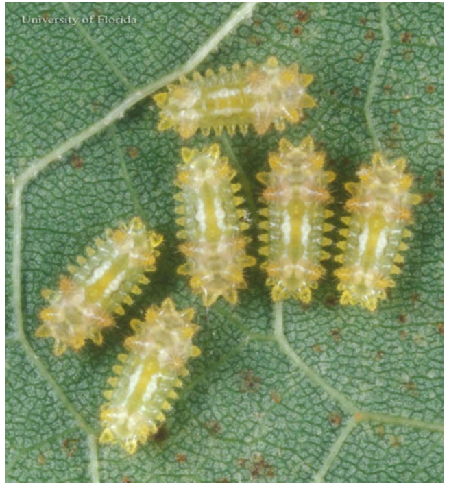
Figure 7. Early instar larvae of the saddleback caterpillar, Acharia stimulea (Clemens).

At hatching, larvae can be as small as 1.2 mm (0.05 in) and during last instar the larvae can be as large as 20 mm (0.8 in) with a 7 mm (0.28 in) width. Early instars lack defined aposematic coloration, but still have the stout body design and fleshy tubercles shown by later instars.