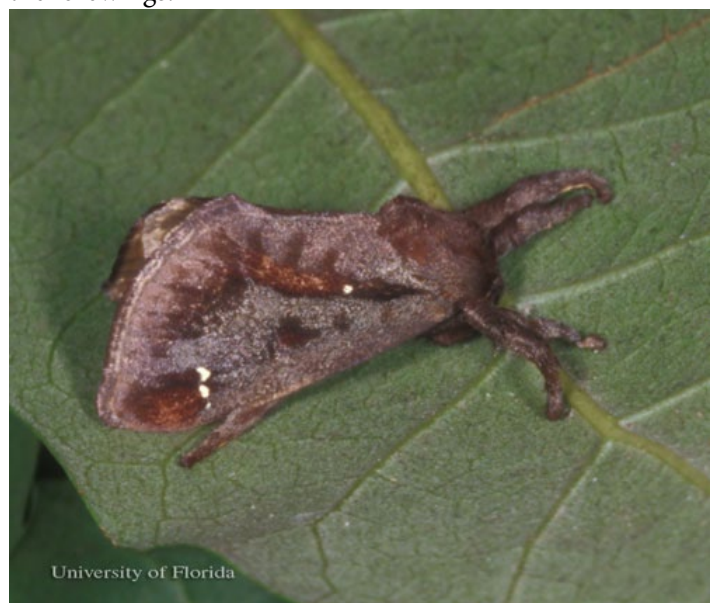
Figure 3. Adult stage of the saddleback caterpillar, Acharia stimulea (Clemens), showing the white dots on the wings.

Acharia stimulea adults are glossy dark brown in color with black shading. Dense scales are present on the body and wings, giving it a furry appearance. Wing span ranges from 26–43 mm (1.0–1.7 in), with females typically larger in size than males. A single white dot is present near the forewing base. Near the forewing apex, one to three additional white dots are present. The hind wings will be a paler brown than the forewings.