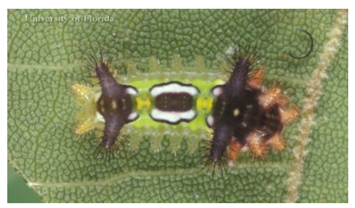
Figure 8. Middle instar larvae of the saddleback caterpillar, Acharia stimulea (Clemens).

Middle instars begin to develop the well defined markings of the species and the enlarged spinal processes.