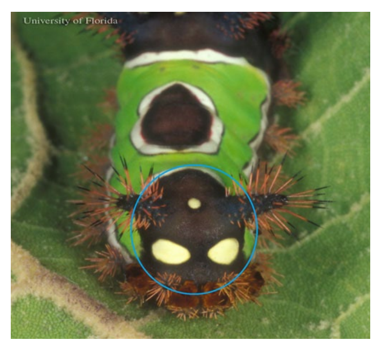
Figure 6. Close up the startle display marking of the saddleback caterpillar, Acharia stimulea (Clemens).

At hatching, larvae can be as small as 1.2 mm (0.05 in) and during last instar the larvae can be as large as 20 mm (0.8 in) with a 7 mm (0.28 in) width. Early instars lack defined aposematic coloration, but still have the stout body design and fleshy tubercles shown by later instars.