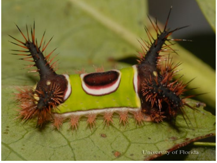
Figure 4. Late instar larva of the saddleback caterpillar, Acharia stimulea (Clemens) larva, on blueberry.

The caterpillars have a truncated, slug-like body form that is not typical of other Lepidoptera families. The prolegs are concealed under the ventral surface of the body. Color patterns are aposematic, or having bright warning colors that denote toxicity or distastefulness. The caterpillars are dark brown on the anterior and posterior ends with a contrasting bright green pattern blanketing the dorsal midsection.