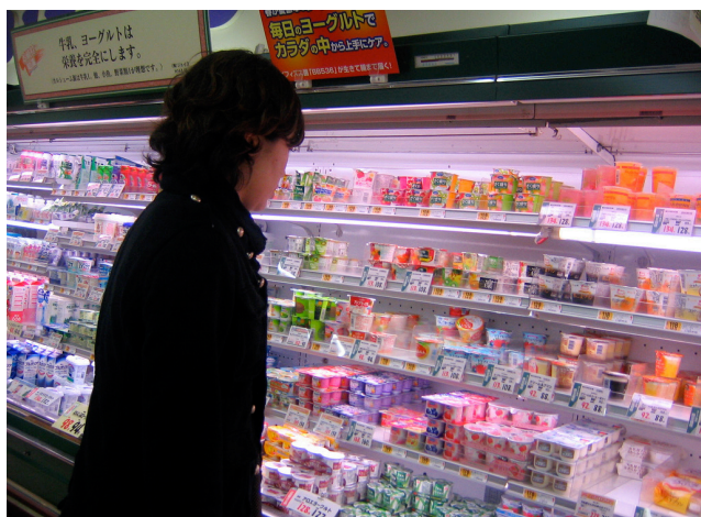
Figure 1. Yogurt selection in the dairy aisle