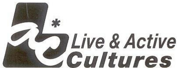
Figure 3. Live & Active Culture seal Credits: Trademark of the National Yogurt Association

The National Yogurt Association (NYA), a non-profit trade organization of the dairy industry, has created a Live & Active Cultures seal that approved manufacturers can voluntarily place on the packaging if their product meets the requirements outlined by the NYA. Yogurts with live and active cultures may have more health benefits. These health benefits may include reducing high blood pressure and aiding in digestive health (6).