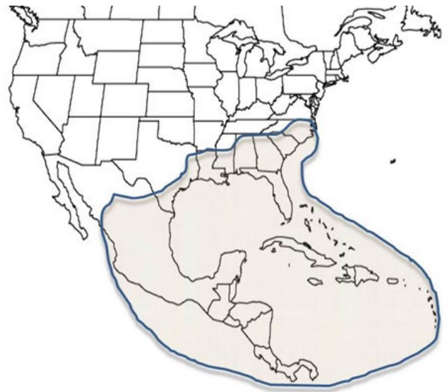
Figure 1. Distribution of Culex pilosus as of March 2012.