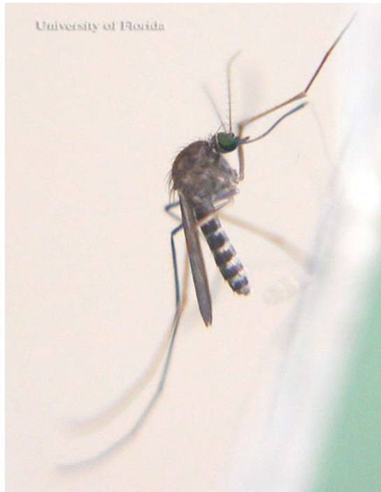
Figure 2. Adult female Culex (Melanoconion) pilosus , a mosquito.

identify to species, and an analysis of the genitalia is often necessary (Roth 1943). Positive identification of Cx. pilosus females can be accomplished by observing only three teeth on the cibarial armature (a series of specialised spicules, cibarial teeth, borne on a transverse ridge) (Michener 1944). Both sexes of Cx. pilosus have dark short palps and a long dark proboscis, dark abdomen with somewhat reflective bronze or blue-green scales, dark thorax with a lighter patch on the dorsal portion of the mesepimeron, narrow and dark wing scales, and dark legs (Cutwa and O'Meara 2012).