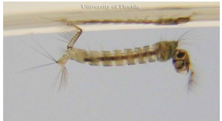
Figure 3. Larva of Culex (Melanoconion) pilosus , a mosquito.

antennae (Carpenter and LaCasse 1955). They have an upcurved siphon and a curved preapical spine at the end of the siphon. There are eight pairs of long tufts of setae on the siphon, comb scales on the eighth abdominal segment in a single row that appear long and pointed, and gills of two different lengths (Cutwa and O'Meara 2012).