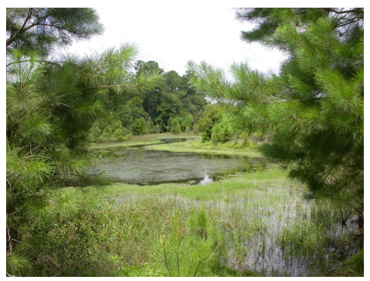
Figure 3. An enhanced stormwater basin used to treat runoff.