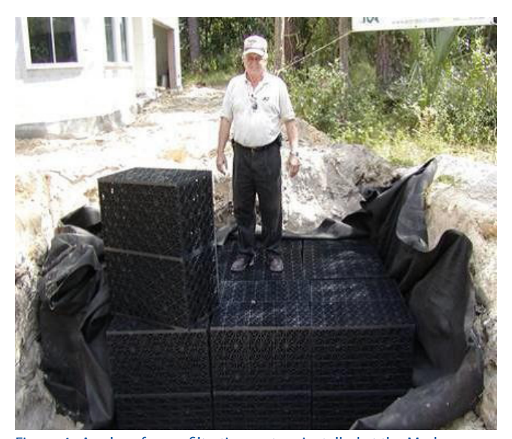
Figure 4. A subsurface exfiltration system installed at the Madera subdivision in Gainesville, FL.

• Cluster Design: A site planning technique also known as "conservation design," which uses smaller lot sizes that are "clustered" to achieve a smaller impact area. Sometimes this practice is considered a separate element from LID tools or is included in the low impact site preparation category. The smaller footprint of a cluster design reduces impervious surfaces, protects natural drainage paths and high infiltration soils, and maintains open space/natural areas (USEPA 2007, Williams and Wise 2009).