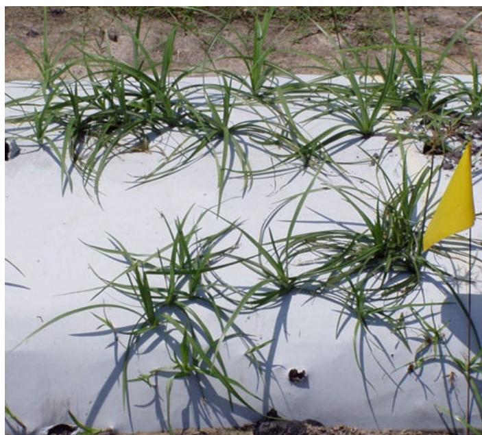
Figure 1. Nutsedge sprouting through white polyethylene mulch.

Isothiocyanate-generator fumigants break down as either allyl or methyl isothiocyanate (ITC), which are potent