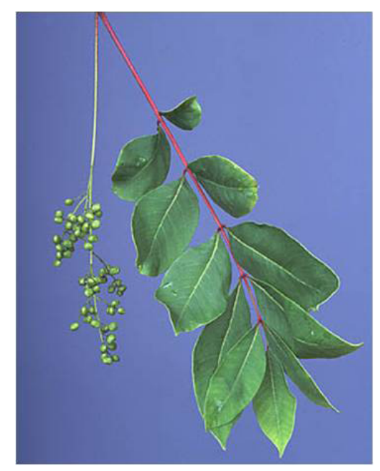
Figure 10. Poison sumac leaflets, reddish stems, and immature green fruit

Poison sumac leaves consist of 7–13 leaflets arranged in pairs with a single leaflet at the end of the midrib. Distinctive features include reddish stems and petioles (Figure 10). Leaflets are elongated, oval, and have smooth margins. They are 2–4 inches long, 1–2 inches wide, and have a smooth, velvety texture. In early spring, the leaves emerge bright