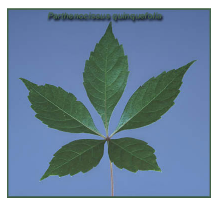
Figure 5. Virginia creeper

tendrils that end in tiny sticky pads that attach to trees and other surfaces. In winter, the leaves of Virginia creeper turn red and drop from the plant (Figure 6). For more information, see http://edis.ifas.ufl.edu/fp454.