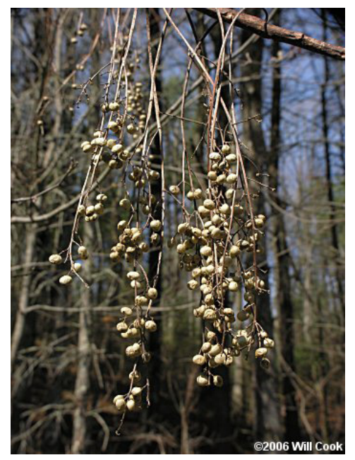
Figure 11. Poison sumac mature fruit in winter

orange. Later, they become dark green and glossy on the upper leaf surface and pale green on the underside. In the early fall, leaves turn a brilliant red-orange or russet shade. The small, yellowish-green flowers are borne in clusters on slender stems arising from the leaf axils. Flowers mature into ivory-white to gray fruits resembling those of poison oak or poison ivy, but they are usually less compact and hang in loose clusters of up to 10-12 inches in length (Figure 11).