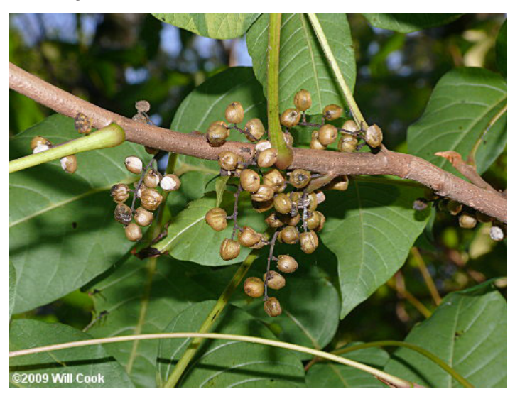
Figure 4. Poison ivy mature fruits

Flowers and fruit are always in clusters on slender stems that originate in the leaf axils, or angles, between the leaves and woody twigs. The berrylike fruits are round and grooved with a white, waxy coating. They are attractive to birds. The leaves and fruit are an important food source for deer (Figure 4).