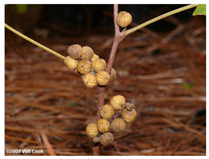
Figure 8. Poison oak mature fruit