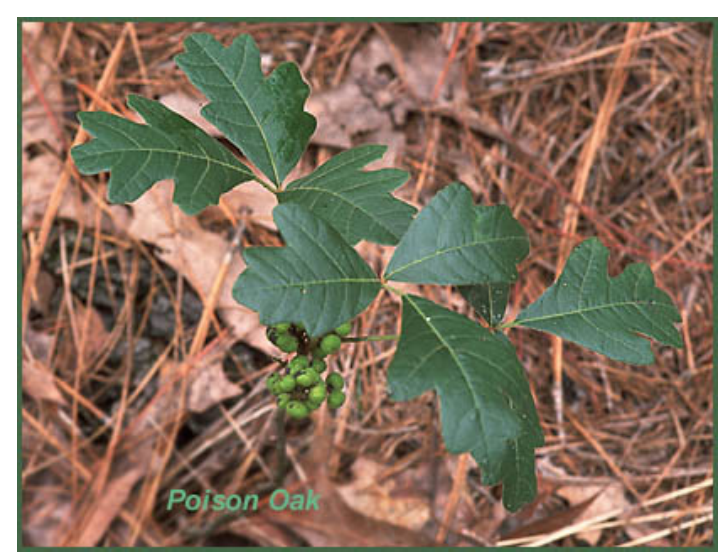
Figure 7. Poison oak lobed leaves and immature green fruit

Like poison ivy, a single poison oak leaf consists of three leaflets. The stem attaching the terminal leaflet is longer than the stems attaching the other two. One distinguishing feature of poison oak is its lobed leaves, which give it the appearance of an oak leaf. The middle leaflet usually is lobed alike on both margins, and the two lateral leaflets are often irregularly lobed (Figure 7). Leaf size varies consider-