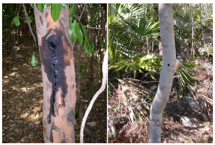
Figure 13. Poisonwood bark variations

Poisonwood is an evergreen shrub or tree that grows 25–35 feet tall in hammocks, pinelands, and sandy areas near saltwater. It is particularly abundant in the Florida Keys. As of this writing, poisonwood's range has only been confirmed in five counties in South Florida: Martin, Palm Beach, Broward, Miami-Dade, and Monroe. The tree has a spreading, rounded form with a short trunk and arching limbs with drooping branches. The bark varies in color from reddish brown to gray, depending on the habitat, and has oily patches of sap on the surface; older trees have scaly bark (Figure 13). Each leaf is comprised of three to