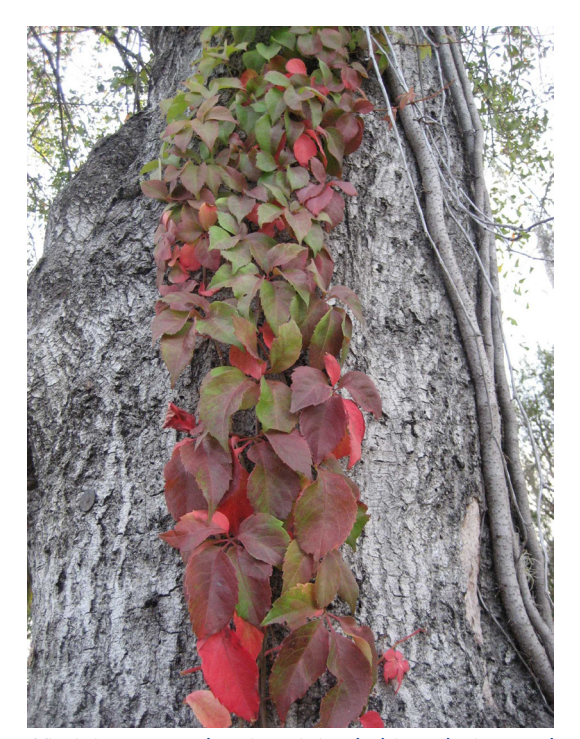
Figure 6. Virginia creeper showing vining habit and winter color