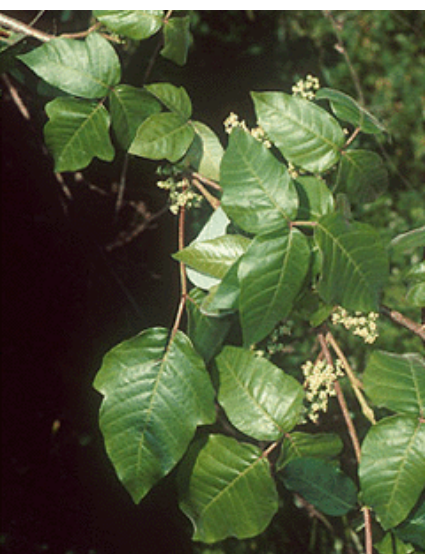
Figure 2. Poison ivy leaves (consisting of three leaflets) and flowers

Poison ivy grows in shady or sunny locations throughout Florida. It can be a woody shrub up to 6 feet tall or a vine up to 150 feet tall that climbs high on trees, walls, and fences or trails along the ground (Figure 2). All parts of