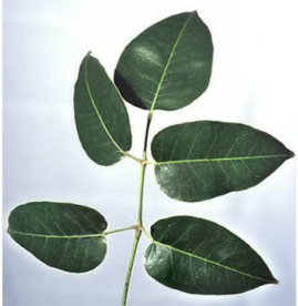
Figure 1. Poison ivy, poison oak, poison sumac, and poisonwood Credits: ( Source : Cook 2012; Larry Korhnak, UF/IFAS)