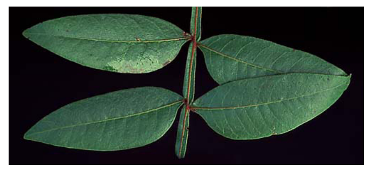
Figure 12. Winged sumac

Winged sumac ( Rhus copallinum ) has a similar appearance but is a nonallergenic relative that grows throughout Florida. It can be distinguished from poison sumac most readily by its 9–23 leaflets, clusters of red berries, and the winged rachis between the leaflets (Figure 12).