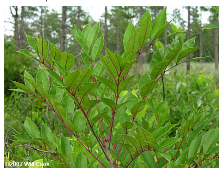
Figure 9. Poison sumac

More allergenic than poison ivy and poison oak is poison sumac, a deciduous woody shrub or small tree that grows 5–20 feet tall and has a sparse, open form (Figure 9). It inhabits swamps and other wet areas, pine woods, and shady hardwood forests. In Florida, poison sumac has been confirmed in the north and central regions, as far south as Polk County.