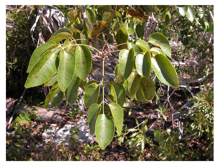
Figure 14. Poisonwood leaves with dots of resin

seven oval leaflets, although five leaflets are typical. Leaves are glossy and dark green above and paler underneath. The smooth edges are thick and curl under slightly. Irregular blotches of resin dot the surface of many of the leaflets (Figure 14). The fruit is ½ inch long, oval, yellow to orange in color, and hangs in loose clusters (Figure 15).