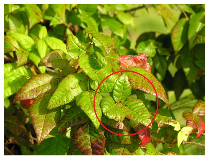
Figure 3. Poison ivy vine showing single leaf (in circle) and fall red color

reddish tinge in the spring and turn a dull green as they age, eventually turning shades of red or purple (Figure 3) in the fall before dropping.