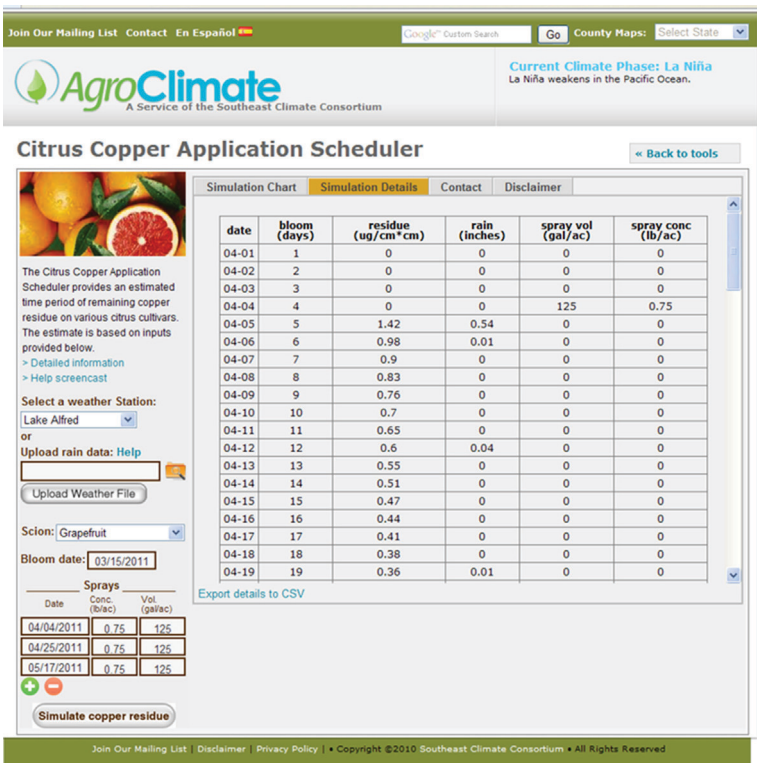
Figure 3. The tabular output of the results of a copper application program in Lake Alfred on grapefruit with three applications of 0.75 lb/acre of metallic copper in 125 gal/acre spray volume.