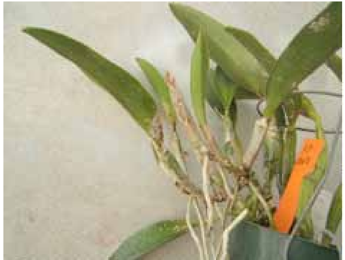
Figure 4. Cattleya orchid after being treated with horticultural oil; boisduval scale infestation is reduced, but still evident on several of the leaves.