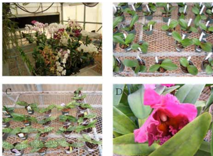
Figure 1. Some of the orchids used in the phytotoxicity study: A) Dendrobium , B) Phalaenopsis , C) Paphiopedilum , and D) Cattleya . No evidence of phytotoxicity was observed on the foliage, roots, flowers, or buds of any of the plants.

Dendrobium , Oncidium , Doritaenopsis ( Phalaenopsis hybrids), Paphiopedilum , Epidendrum , Cymbidium , and Cattleya . No phytotoxicity was observed to foliage, roots, stems, buds, or flowers on any of the orchids tested at temperatures between 21.0°C and 35.0°C (69.8 °F –95.0°F) with relative humidity between 45% and 95% (Figure 1).