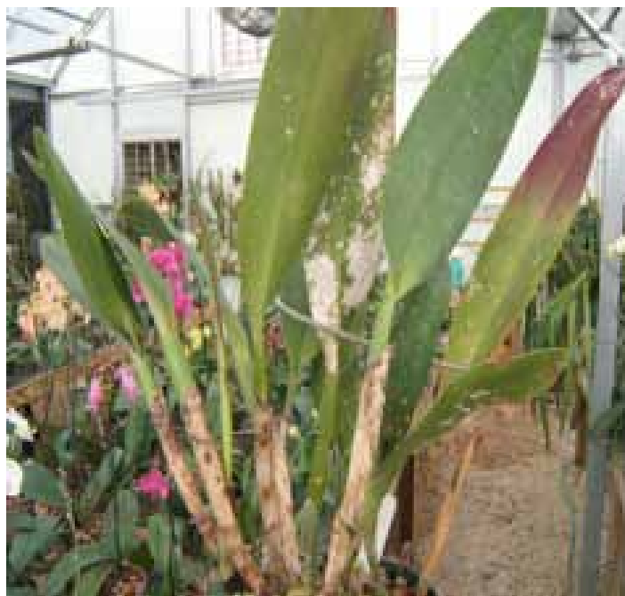
Figure 3. Cattleya orchid after being treated with water had high populations of boisduval scale.

Results indicate that the addition of Silwet® L-77 to horticultural oils significantly increases its efficacy over oil alone when treating plants for boisduval scale or flat mite infestations, and it may work well for other arthropods. Directions for using oil + Silwet® L-77 are given below using measurements suitable for homeowners.