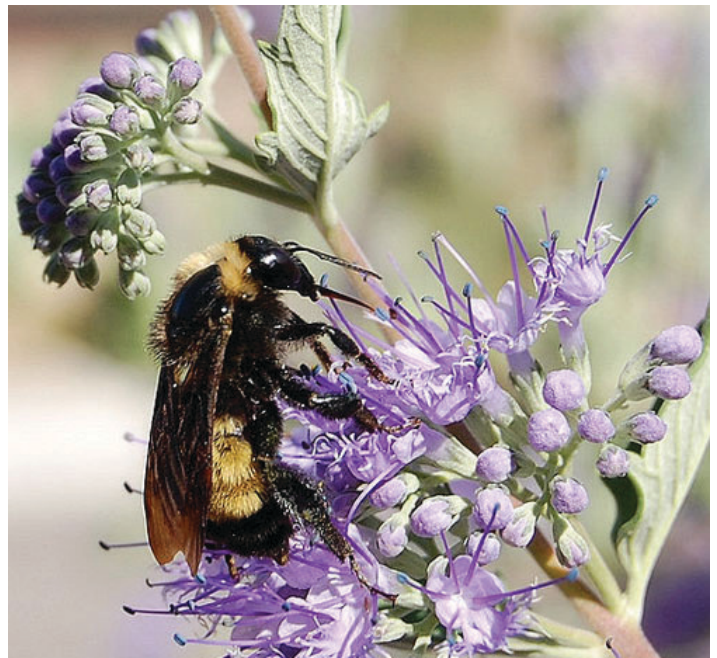
Figure 8. Adult female American bumble bee, Bombus pensylvanicus (DeGeer). Credits: 'Skoch3', Wikipedia