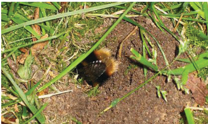
Figure 3. A bumble bee emerging backwards from her nest.

Once a nest site is found, the social bumble bee queen collects pollen and lays her first brood of worker eggs. Workers emerge about 21 days after the eggs are laid and take over the duties of pollen and nectar collection as well as colony defense. The size of the workers increases with each new brood. A third caste of bumble bees, the males, is usually produced in midsummer.