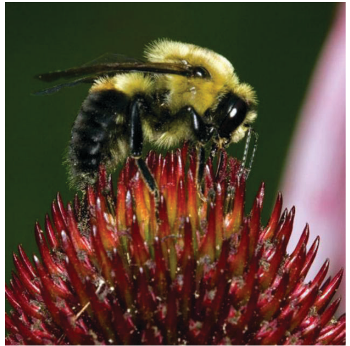
Figure 7. Adult female common eastern bumble bee, Bombus impatiens Cresson.

Bombus terricola Kirby 1837, the yellow-banded bumble bee. Originally, this species extended from Nova Scotia to Florida, west to British Columbia, Montana and South Dakota. While once common, it has declined dramatically since 1990 (Anonymous 2011). No specimens seen from Florida, but recorded from Florida by Mitchell (1962).