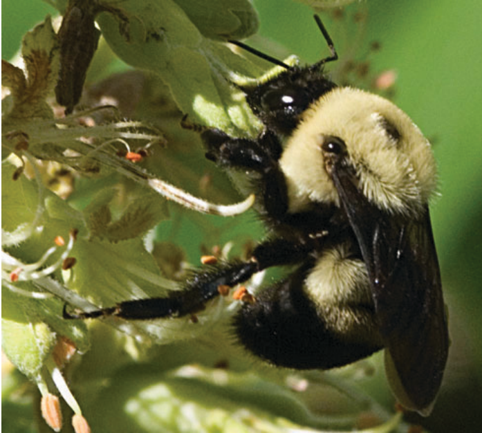
Figure 6. Adult female brownbelted bumble bee, Bombus griseocollis (DeGeer).

Bombus griseocollis (DeGeer) 1773, the brown-belted bumble bee. Its range extends from Quebec and Maine to Florida, and throughout the American West (DL 21011). Florida county records include Alachua, Clay, Collier, Highlands, Marion, and Osceola.