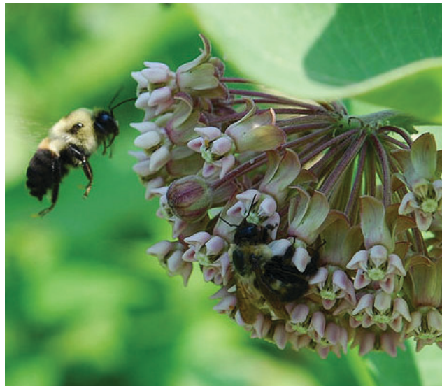
Figure 4. Adult female twospotted bumble bee, Bombus bimaculatus Cresson.

Bombus bimaculatus Cresson 1863, the twospotted bumble bee. Its range extends from Ontario to Maine, south to Florida, and west to Illinois, Kansas, Oklahoma, and Mississippi. Florida county records include Alachua, Clay, Franklin, Highlands, Lake, Levy, Marion, Okaloosa, and Orange.