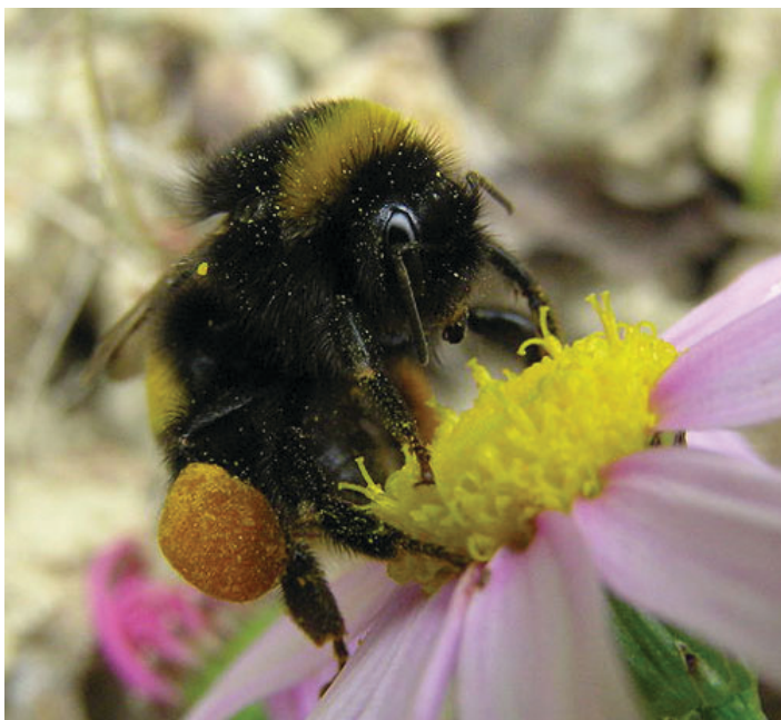
Figure 2. A bumble bee, Bombus sp., with full pollen basket.

A number of non-social Bombus species lost their social behavior and the ability to collect pollen, and are now cleptoparasites on colonies of pollen-collecting Bombus species. These cleptoparasitic species were previously listed as being in the genus Psithyrus (ITIS 2011), and are now sometimes listed as a sub-genus. The parasitic species are easily distinguished by the lack of the corbicula. The most common of this group found in Florida is B. variabilis .