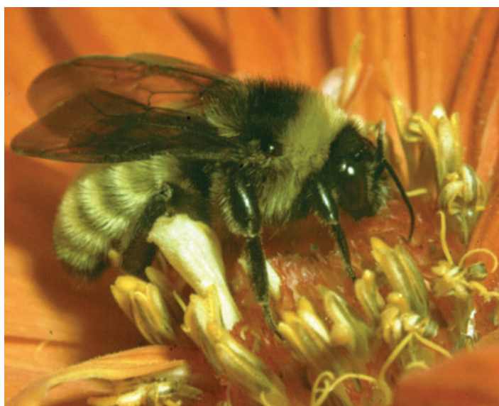
Figure 1. Adult bumble bee, Bombus sp.

The Featured Creatures collection provides in-depth profiles of insects, nematodes, arachnids and other organisms relevant to Florida. These profiles are intended for the use of interested laypersons with some knowledge of biology as well as academic audiences.