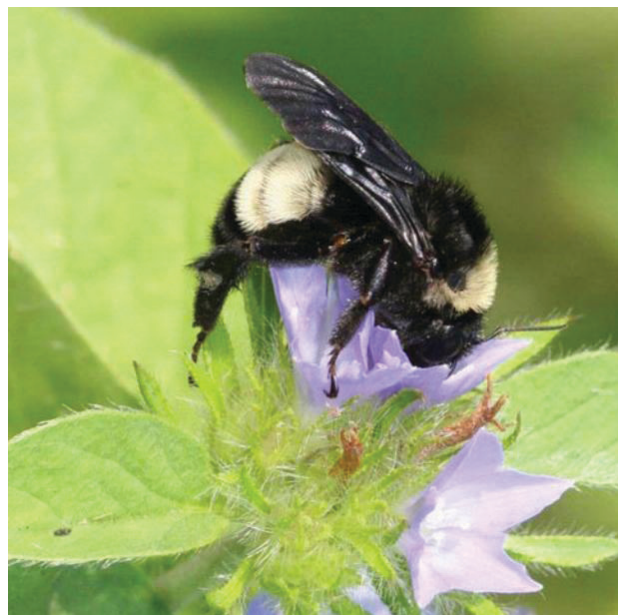
Figure 5. Adult female southern plains bumble bee, Bombus fraternus (Smith).

Bombus fraternus (Smith) 1854, the southern plains bumble bee. Its range extends from New Jersey to Florida, and west to North and South Dakota, Nebraska, Colorado and New Mexico. Florida county records include Alachua, Franklin, Gadsden, Levy, Liberty, Orange, and St. Johns.