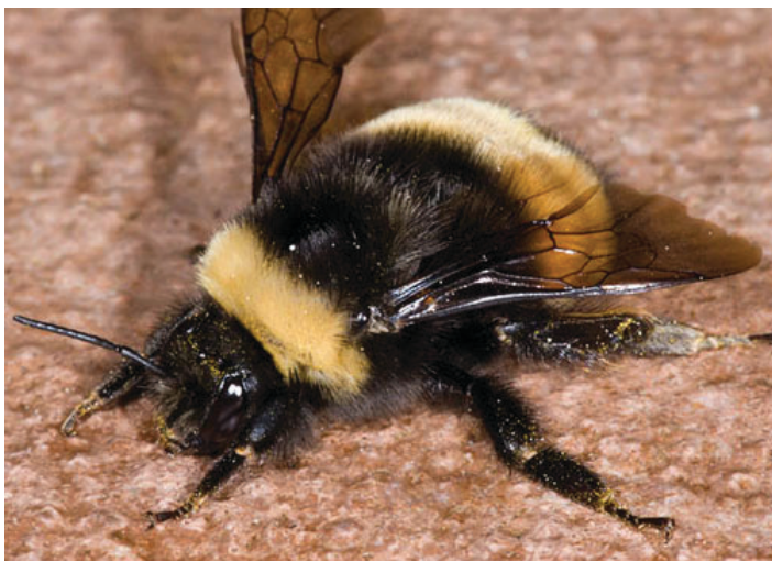
Figure 9. Adult female yellow-banded bumble bee, Bombus terricola Kirby.